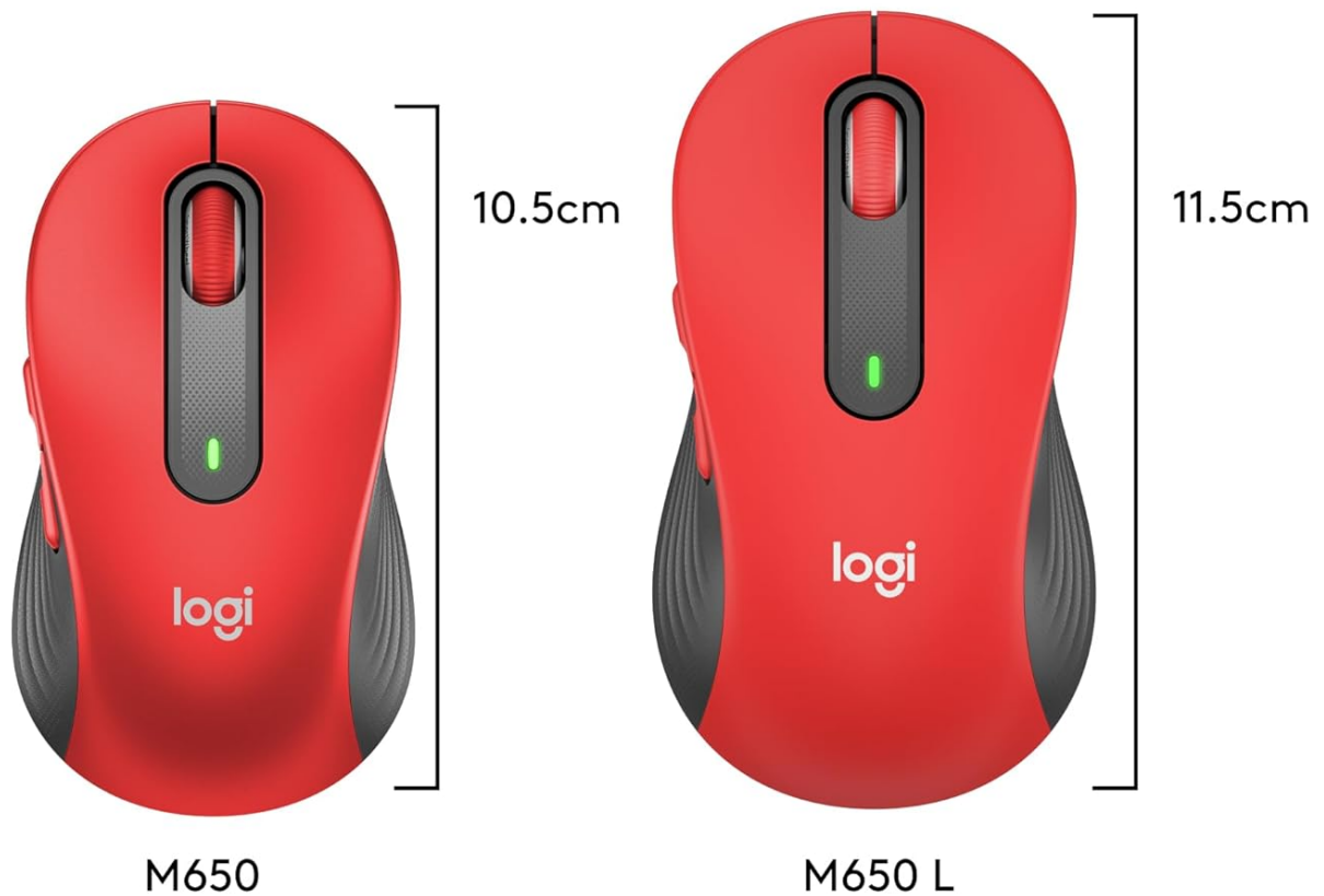
Image: A visual comparison illustrating the size difference between the standard M650 and the larger M650 L models, designed to fit various hand sizes.