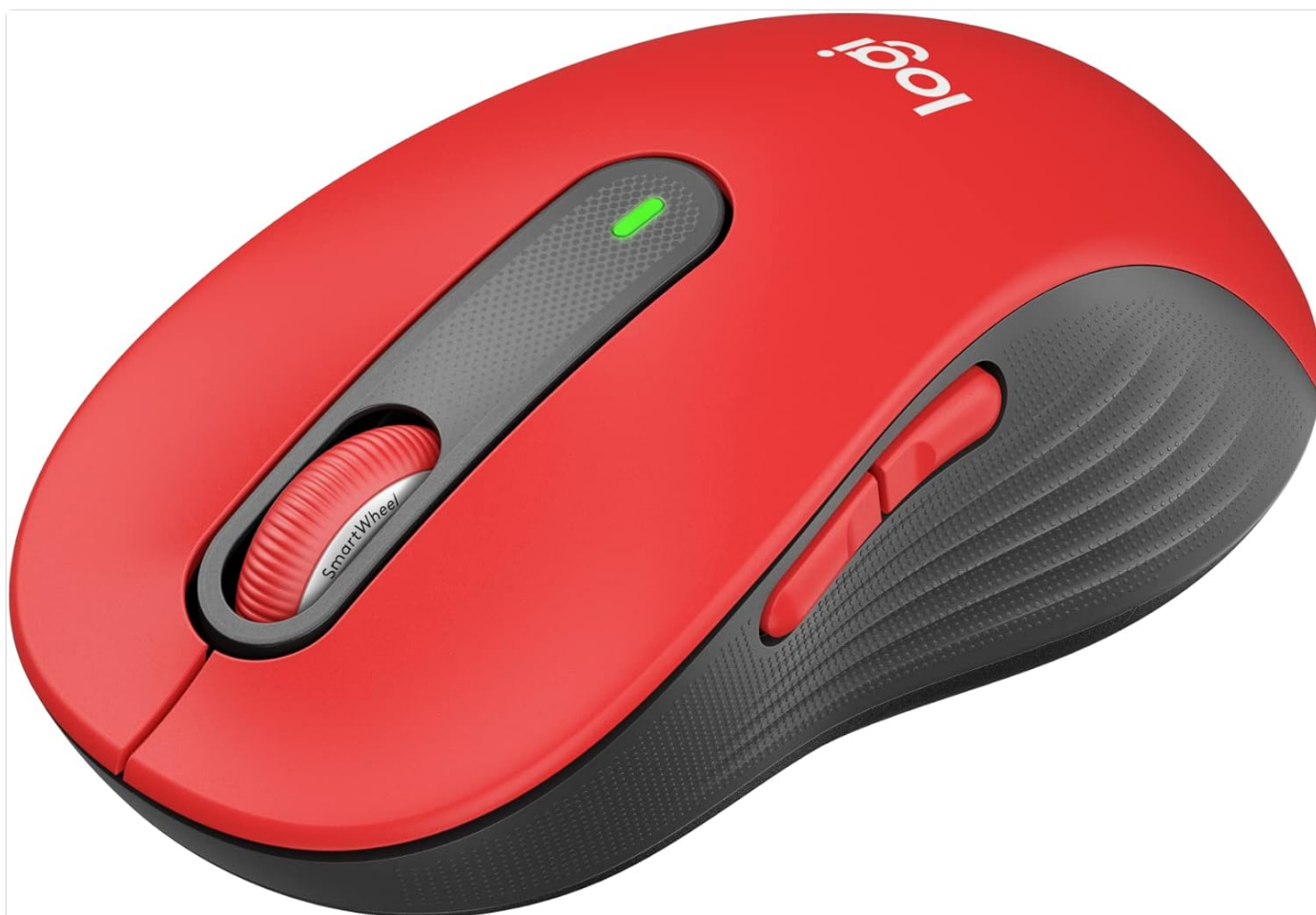
Image: The Logitech Signature M650 L wireless mouse in Classic Red, showcasing its ergonomic design and primary buttons.

The Logitech Signature M650 L is a full-size wireless mouse designed for users with larger hands, offering enhanced comfort and productivity. It features an adaptive SmartWheel for precise and fast scrolling, silent clicks with SilentTouch technology, and customizable side buttons. This mouse provides versatile connectivity options via Bluetooth Low Energy or the Logi Bolt USB receiver, ensuring compatibility with various operating systems including PC, Mac, and Chromebook.