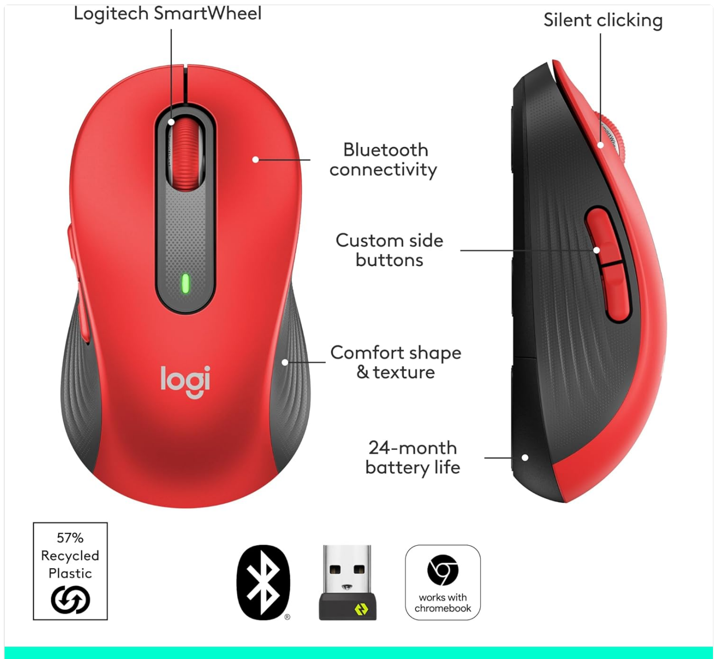
Image: A detailed view of the Logitech Signature M650 L mouse, highlighting its ergonomic shape and textured rubber side grips designed for enhanced comfort and secure handling.