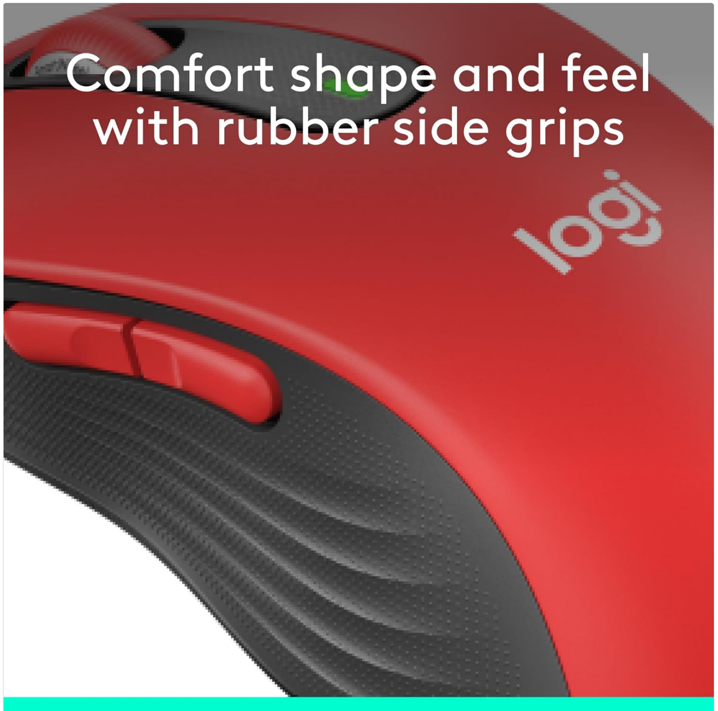
Image: An annotated diagram highlighting key features of the Logitech Signature M650 L mouse, including the SmartWheel, Bluetooth connectivity, custom side buttons, comfort shape, and 24-month battery life.