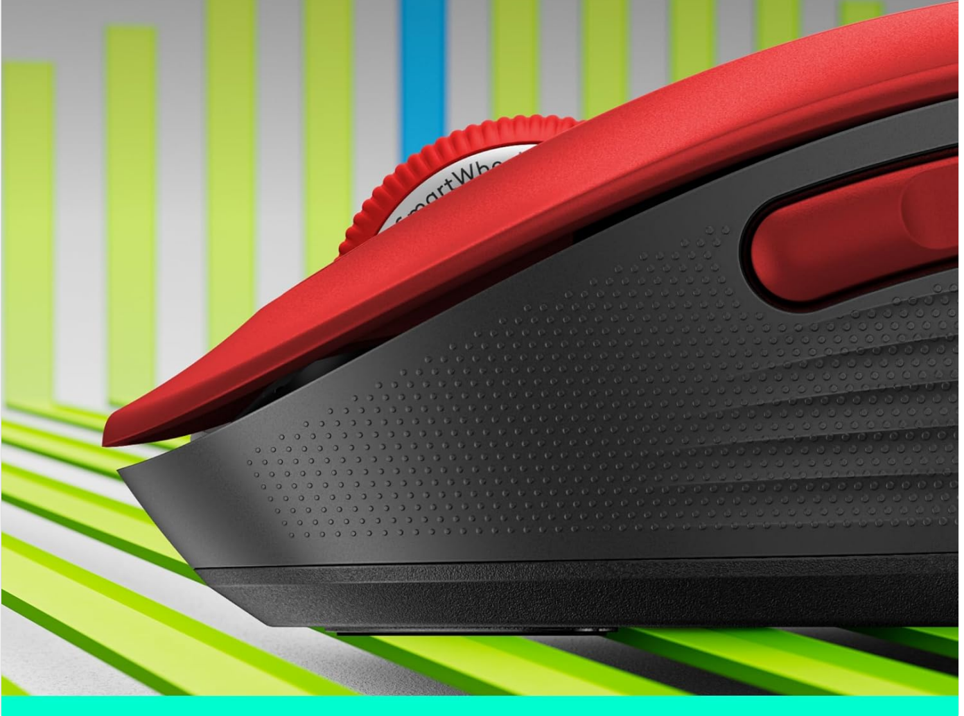
Image: A close-up view of the SmartWheel on the Logitech mouse, illustrating its design for both precise and high-speed scrolling.