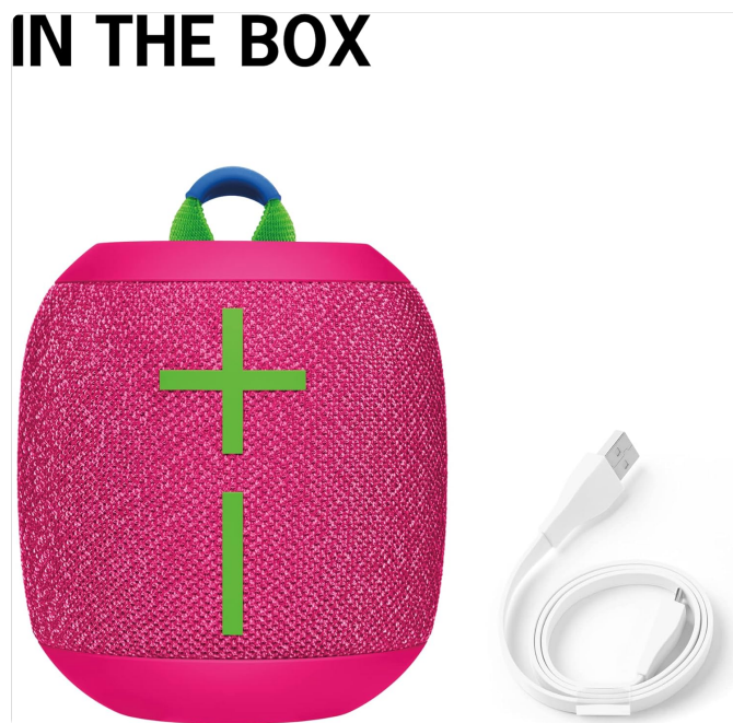
Figure 1.1: Contents of the WONDERBOOM 3 packaging, including the speaker and USB cable.