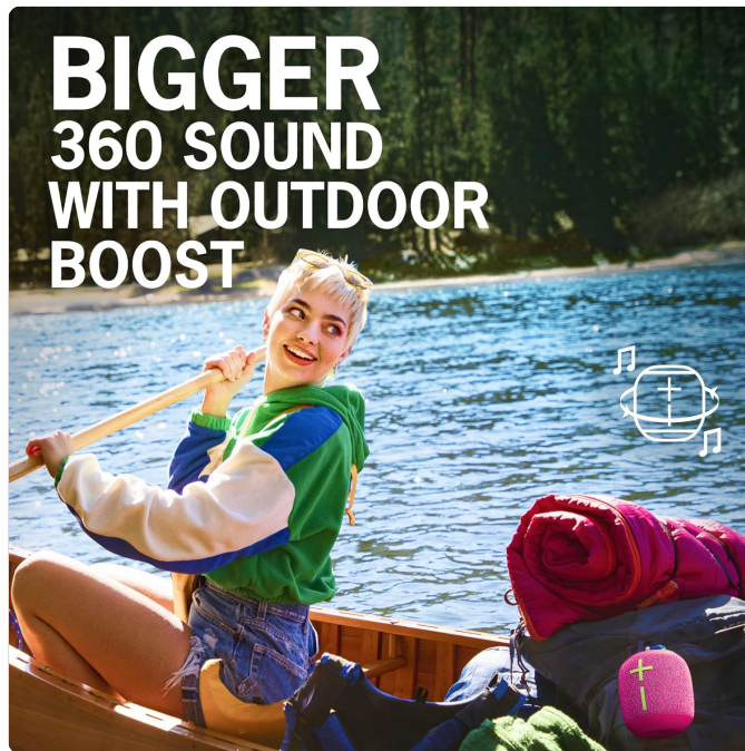
Figure 2.1: Experience bigger 360-degree sound with Outdoor Boost.