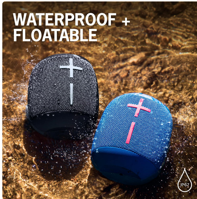
Figure 2.3: WONDERBOOM 3 is waterproof, dustproof, and floatable.