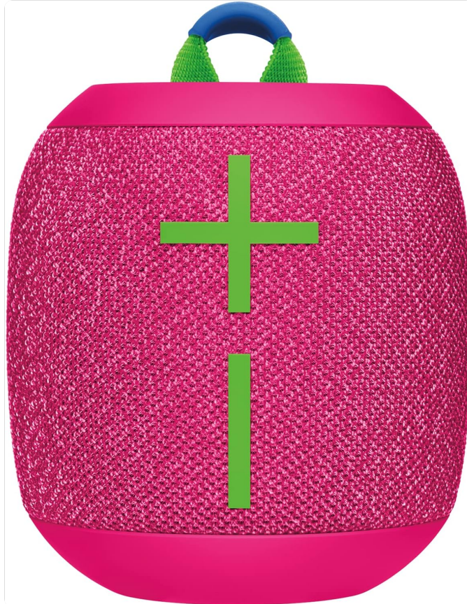
Figure 1.2: The WONDERBOOM 3 speaker, ready for pairing.

Video 1.1: Official guide on how to pair your WONDERBOOM 3 speaker.