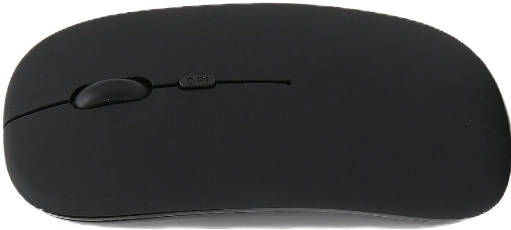
A user operating the Ciciglow Wireless Bluetooth Mouse with a laptop, demonstrating typical usage.