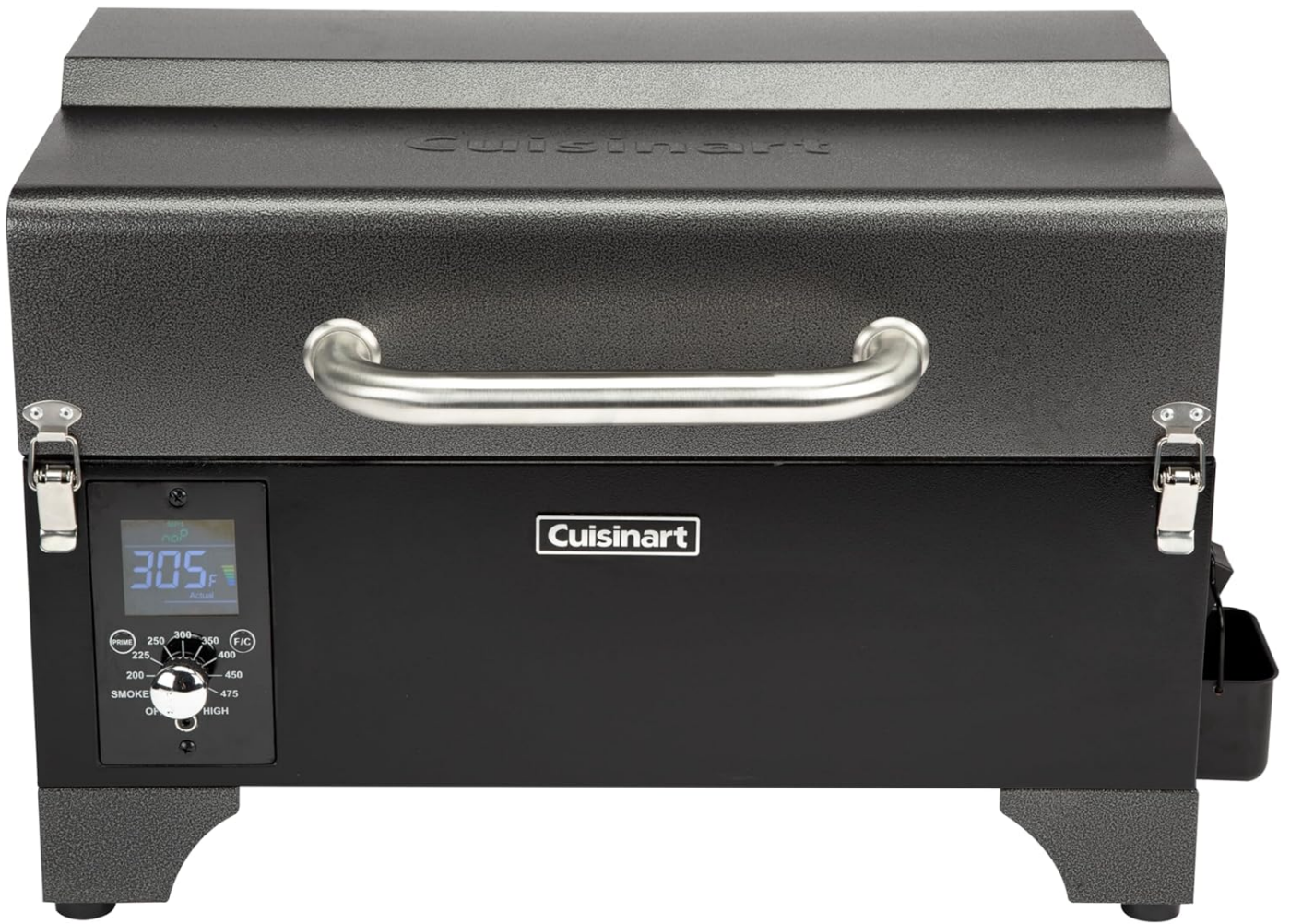
Image: Detailed view of the digital control panel, showing the temperature dial, LED readout, and temperature probe port.