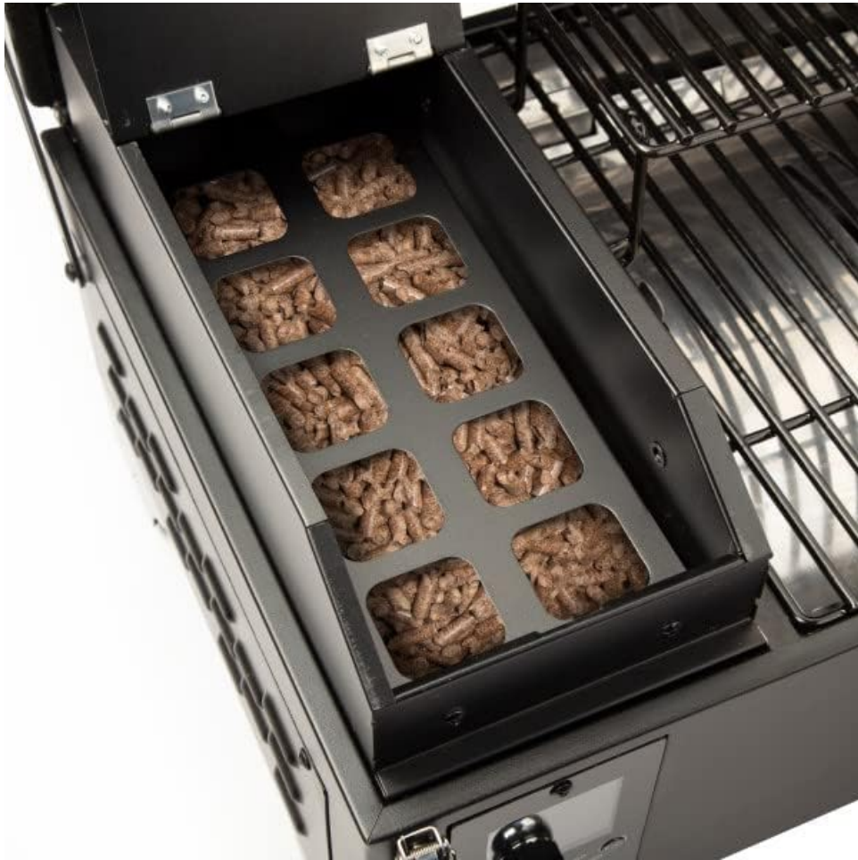
Image: Close-up view of the pellet hopper filled with wood pellets, ready for operation.