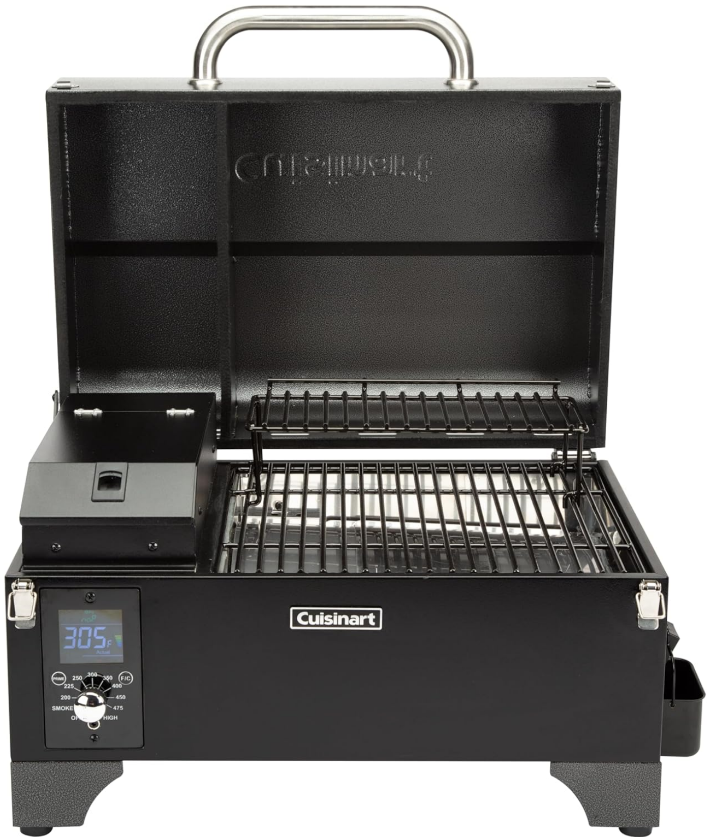
Image: Front view of the Cuisinart Portable Wood Pellet Grill and Smoker, showing the digital control panel and handle.