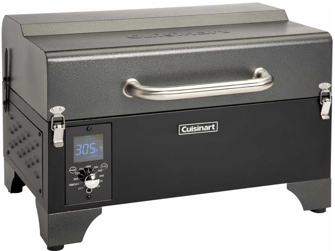
Image: The Cuisinart Portable Wood Pellet Grill and Smoker in its closed position, showcasing its compact design and digital control panel.