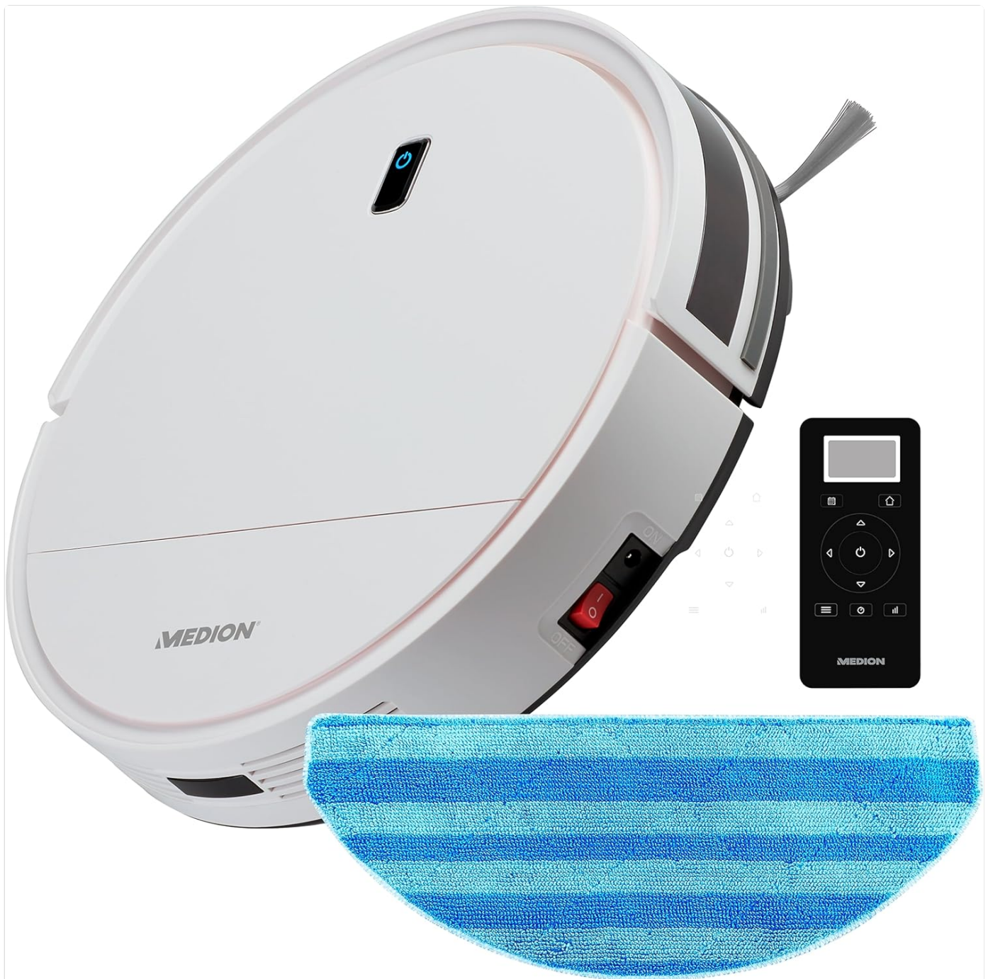
Image: The MEDION P20 SW robot vacuum cleaner and mop, shown with its remote control and a blue mop pad. The robot is white and circular, designed for efficient floor cleaning.