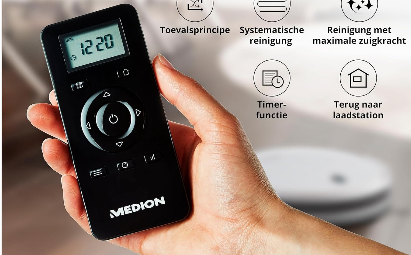
Image: A hand holding the black remote control for the MEDION P20 SW robot vacuum cleaner. The remote displays icons for different cleaning modes, including automatic, spot, edge, systematic, and max suction, along with timer and return-to-base functions.