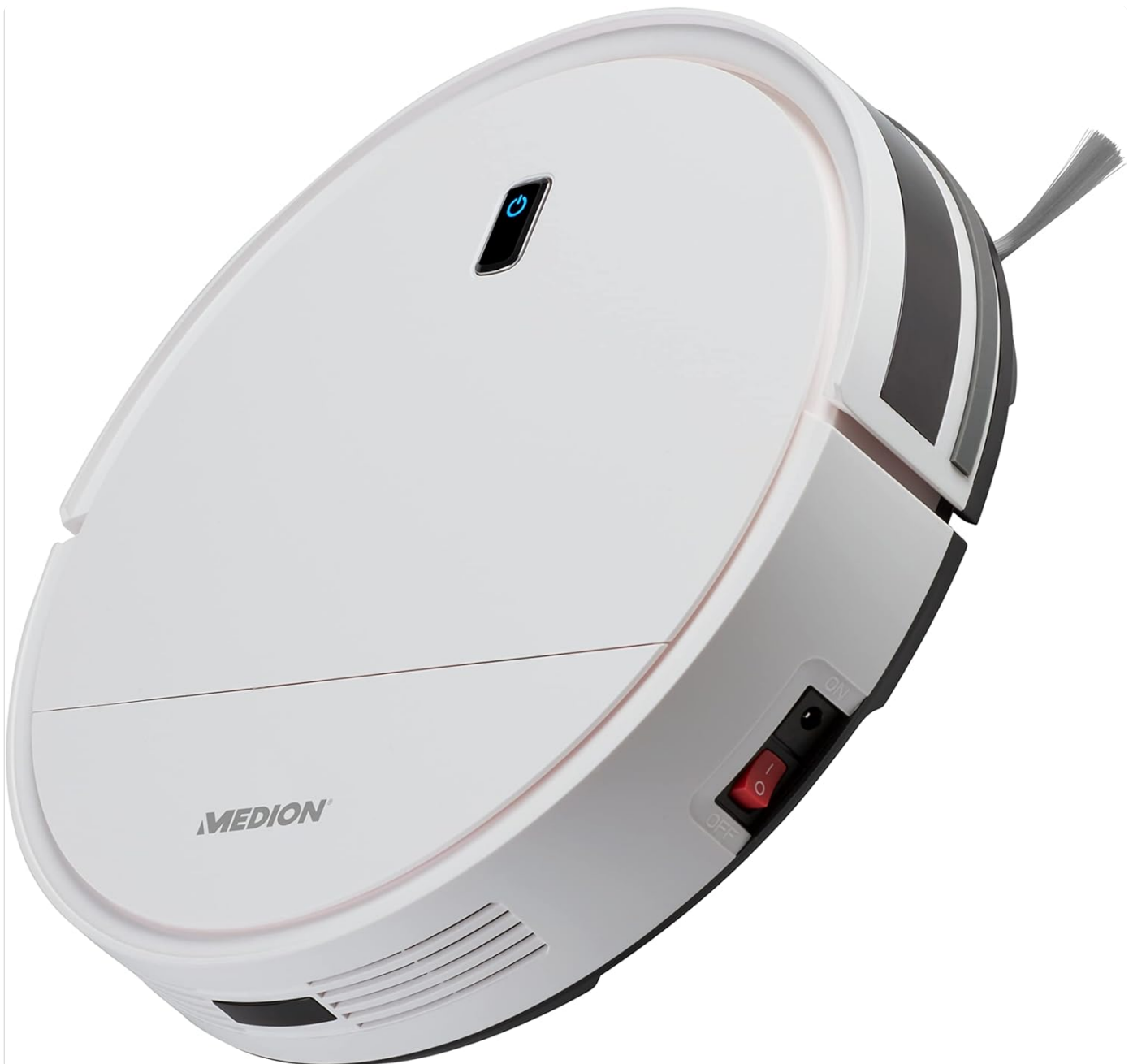
Image: A side view of the MEDION P20 SW robot vacuum cleaner, highlighting the red power switch located on its side. The robot is white with black accents.