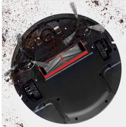
Image: The underside of the MEDION P20 SW robot vacuum cleaner, showing its main roller brush and two rotating side brushes. This view illustrates the cleaning mechanism.

Inspect and clean the main brush and side brushes regularly. Remove any tangled hair or debris using the provided cleaning tool or scissors. Ensure the brushes spin freely after cleaning.