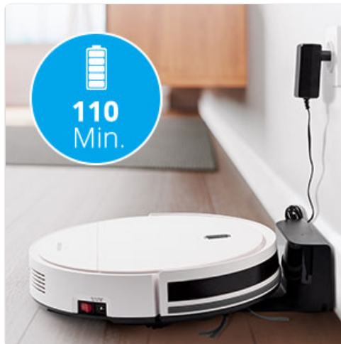
Image: The MEDION P20 SW robot vacuum cleaner docked at its charging station, connected to a wall outlet. The robot is white and circular, indicating it is receiving power.

Before first use, fully charge the robot. Place the charging station against a wall in an open area, ensuring no obstacles are within 1 meter to the sides and 2 meters in front. Connect the power adapter to the charging station and a power outlet. Place the robot onto the charging station, aligning its charging contacts. The indicator light on the robot will show charging status.