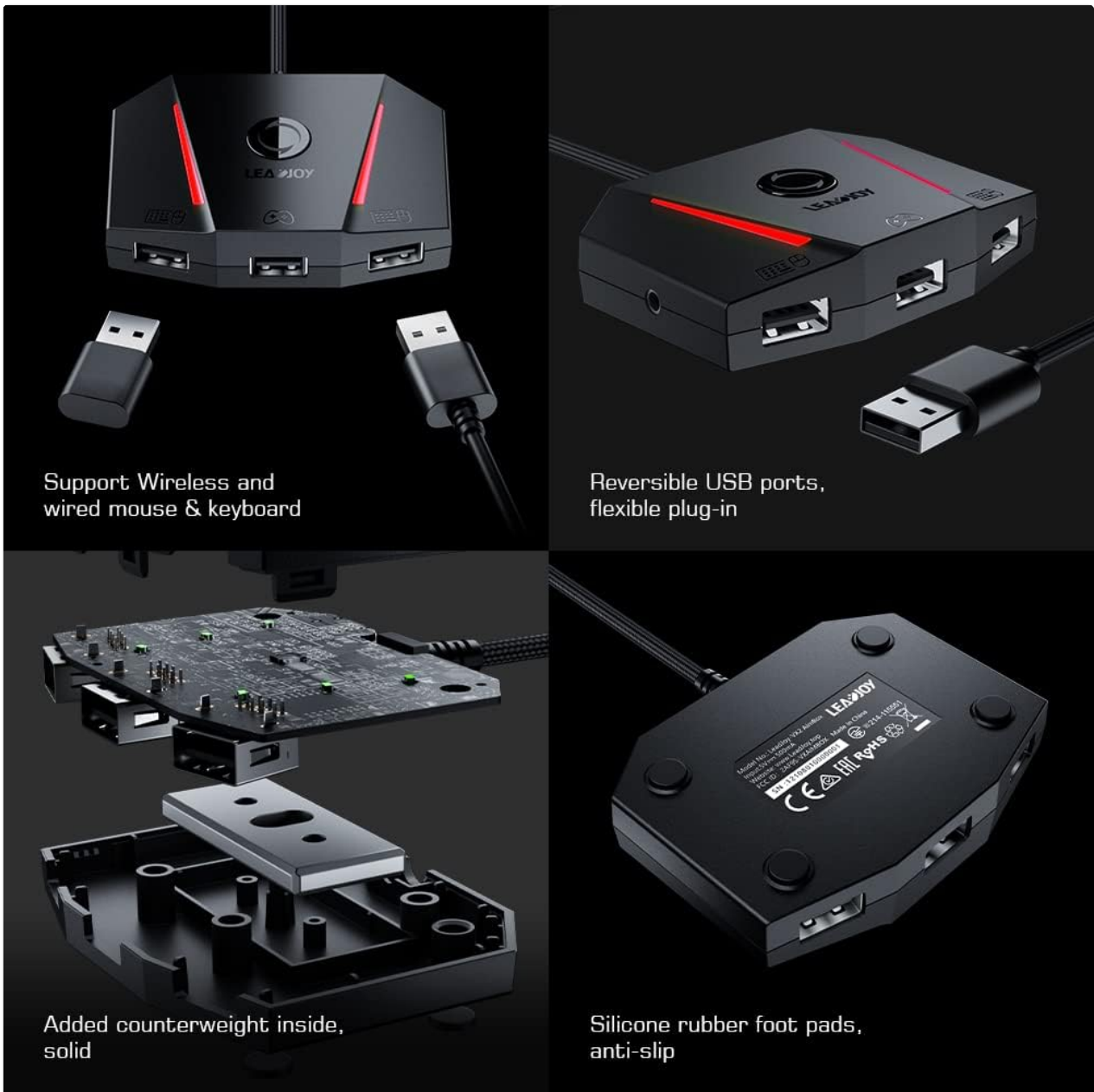
Figure 5.1: Detailed view of the LeadJoy VX2 AimBox, showing its internal structure, reversible USB ports, and anti-slip silicone rubber foot pads.