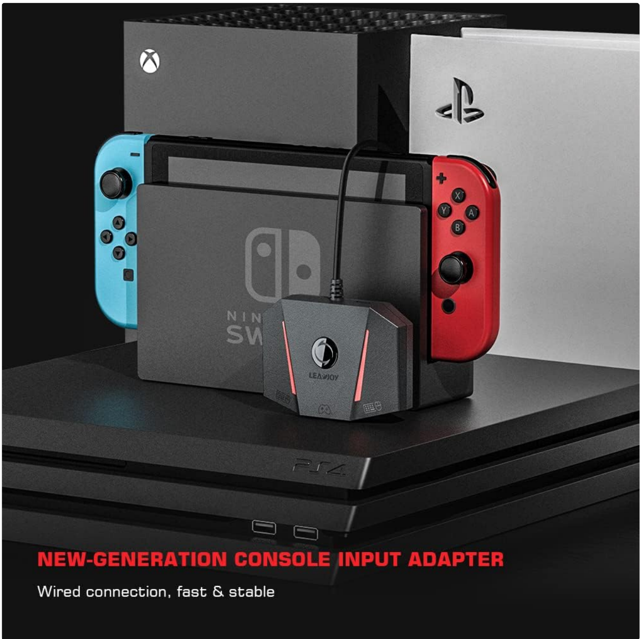
Figure 3.2: The LeadJoy VX2 AimBox demonstrating multi-platform compatibility with Nintendo Switch, Xbox, and PlayStation consoles.