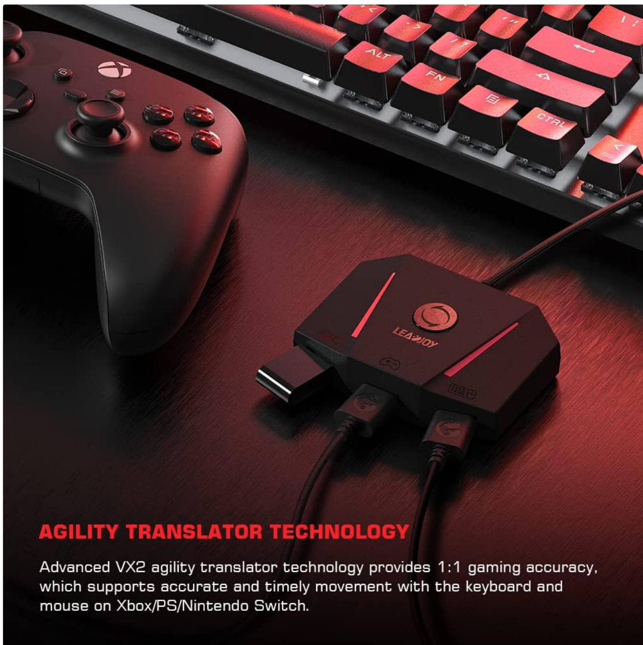
Figure 3.1: The LeadJoy VX2 AimBox connected to an Xbox controller, keyboard, and mouse, demonstrating the wired setup.