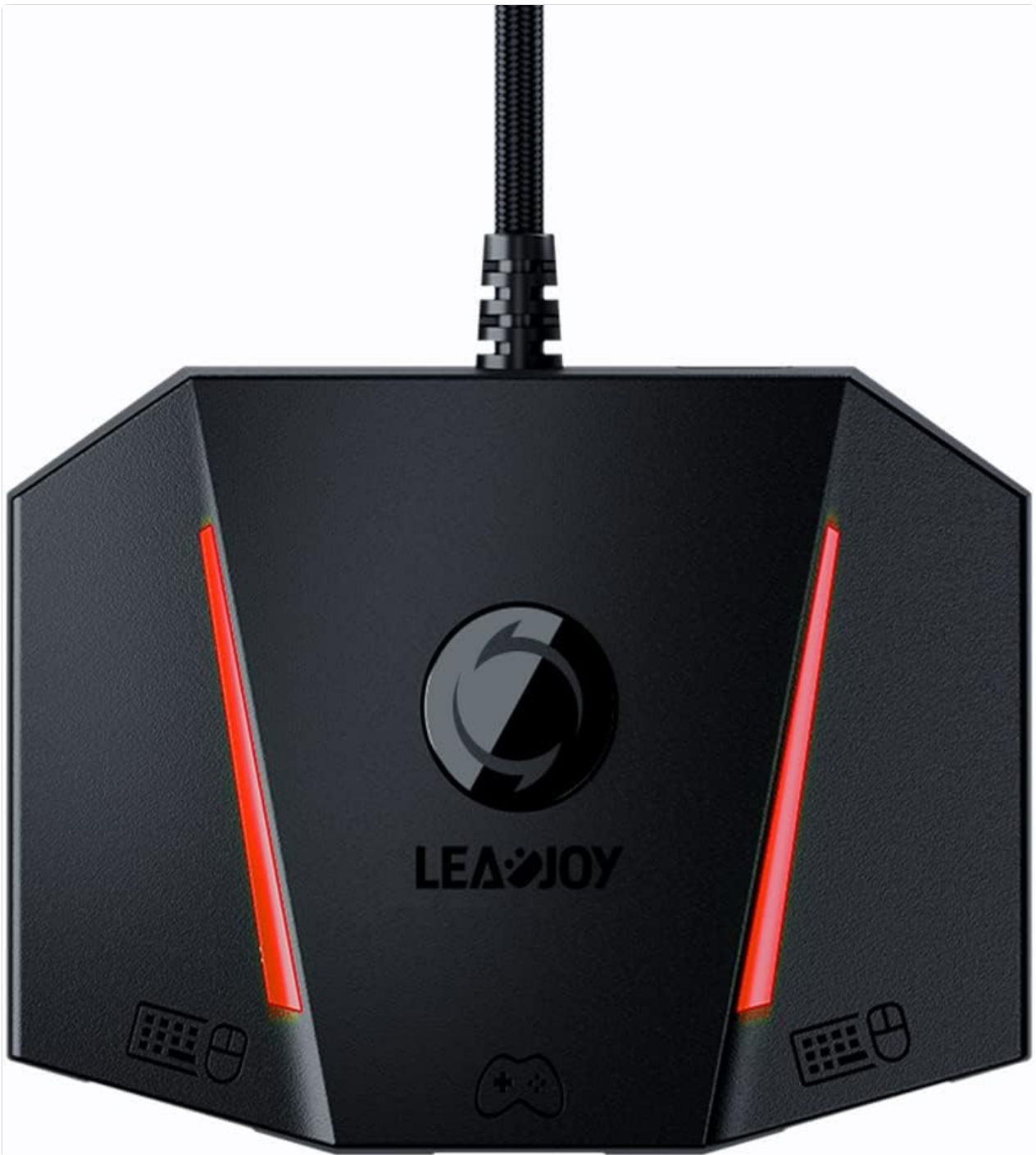
Figure 1.1: Front view of the LeadJoy VX2 AimBox adapter.