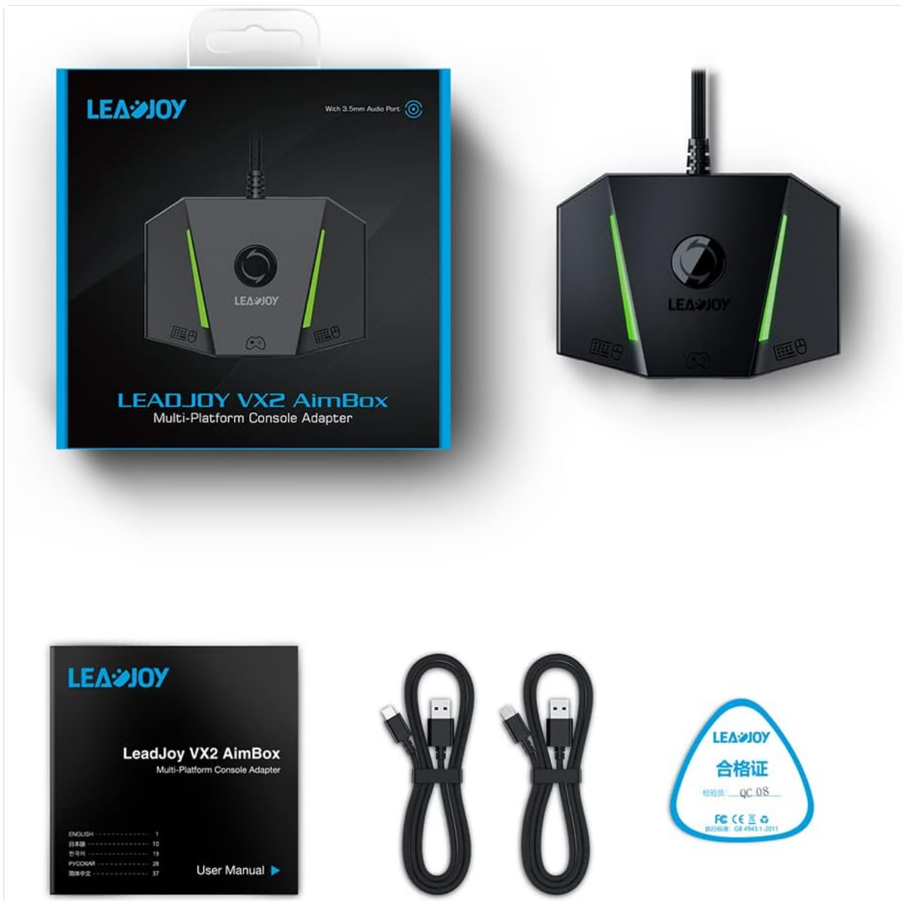
Figure 2.1: Contents included with the LeadJoy VX2 AimBox, showing the adapter, cables, and user manual.