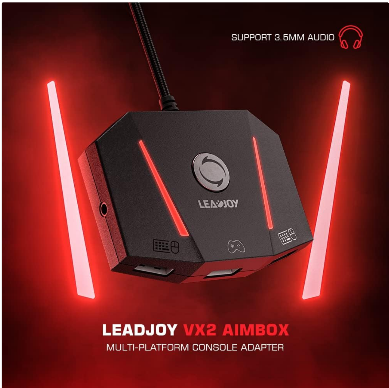
Figure 4.2: The LeadJoy VX2 AimBox highlighting its 3.5mm audio jack for headset support.