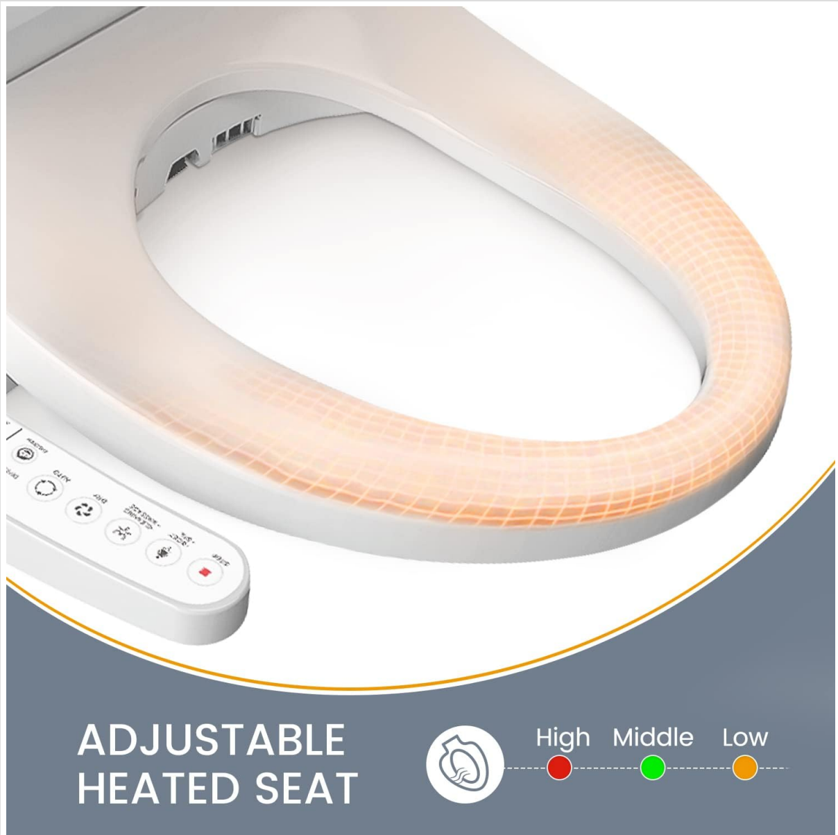
Image: This graphic demonstrates the adjustable heated seat feature, allowing users to select from three temperature levels: High, Middle, and Low, for personalized comfort.