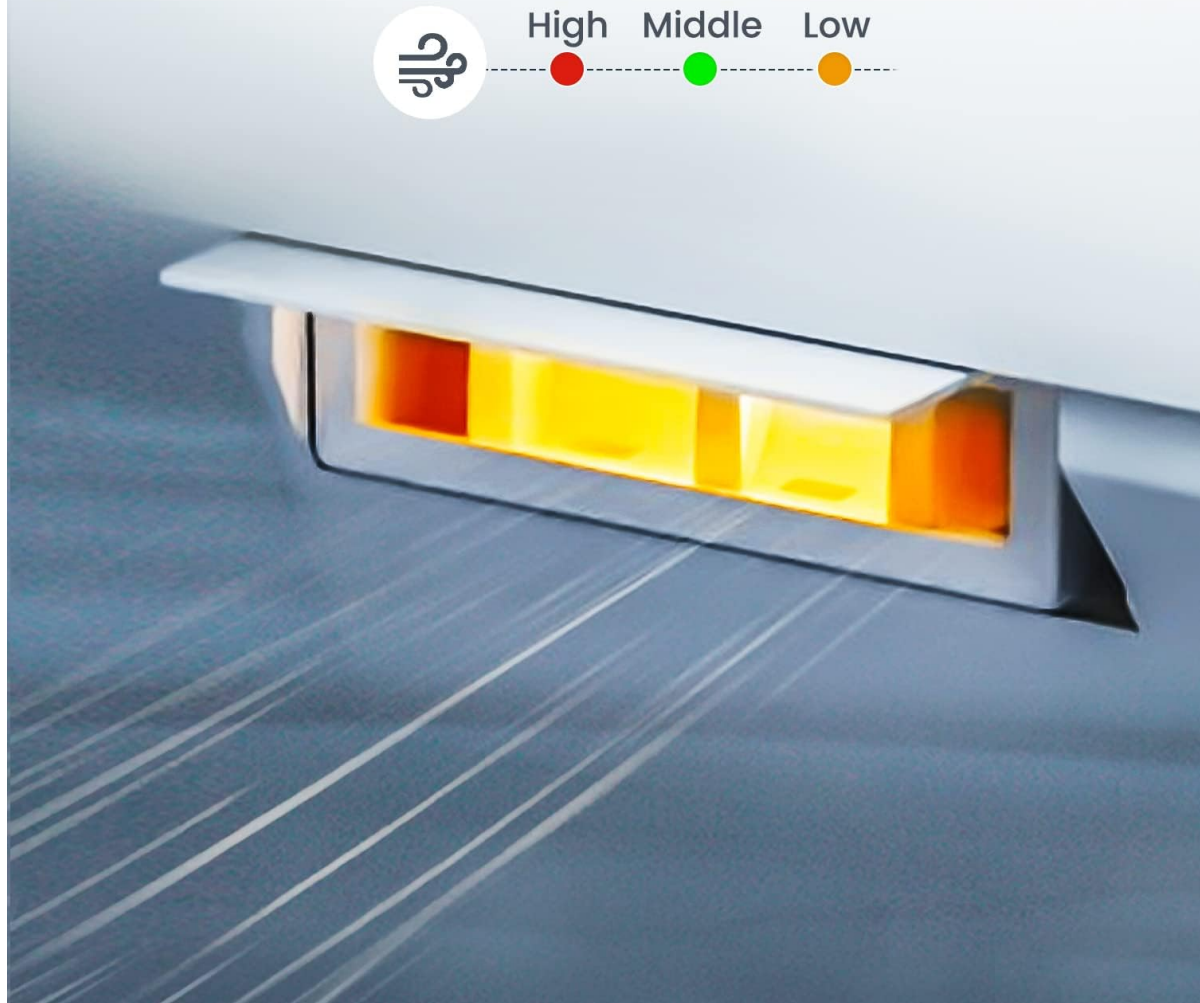
Image: The image displays the warm air dryer vent, which provides adjustable drying with High, Middle, and Low intensity settings after washing, contributing to a complete and comfortable experience.