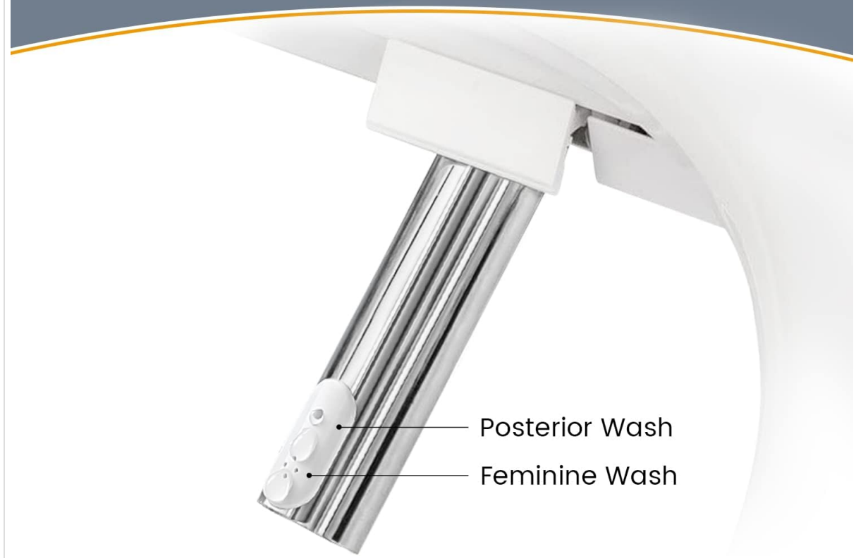
Image: The image highlights the dual-function stainless steel nozzle, indicating options for posterior and feminine wash modes for comprehensive cleaning.