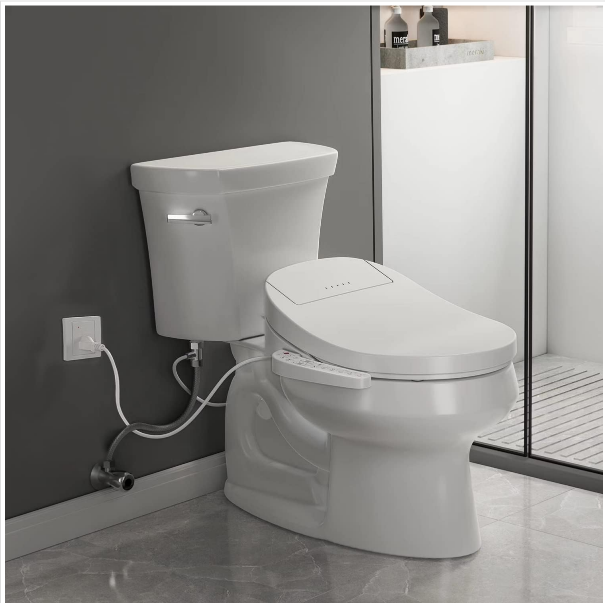
Image: An image of the ZMJH ZMA201 smart toilet seat properly installed on a toilet, demonstrating its appearance in a typical bathroom environment and highlighting the necessary electrical connection to a wall outlet.