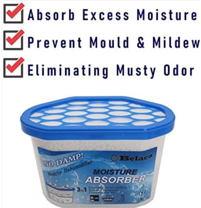
Image: Key benefits of the dehumidifier: moisture absorption, mould prevention, and odor elimination.

Image: The Belaco dehumidifier pack, showing 48 units, a single unit, and the packaging.