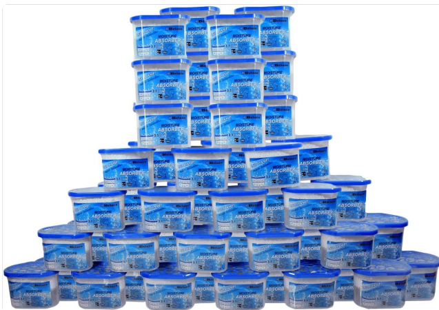
Image: A large quantity of Belaco dehumidifier units, demonstrating the pack size.

The Belaco Dehumidifier is a highly effective solution designed to combat excess moisture in various indoor environments. Each unit contains calcium chloride beads that actively absorb humidity from the air, helping to prevent the growth of mould and mildew, eliminate musty odors, and reduce overall dampness. This product is ideal for use in homes, kitchens, bathrooms, bedrooms, wardrobes, caravans, offices, and basements.