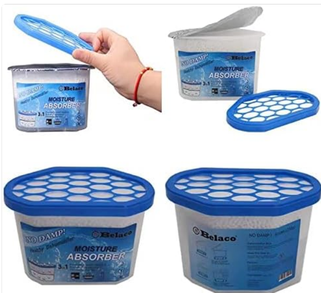
Image: Step-by-step visual guide for opening the dehumidifier.