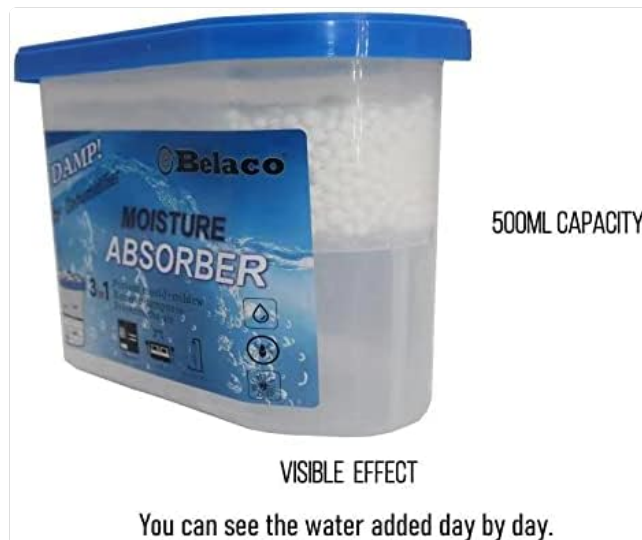
Image: The dehumidifier's 500ml capacity and visible water collection.

Once activated, the calcium chloride beads inside the unit begin to absorb excess moisture from the surrounding air. As moisture is absorbed, the beads will gradually dissolve and collect as liquid water in the bottom reservoir of the container. This process is automatic and continuous.