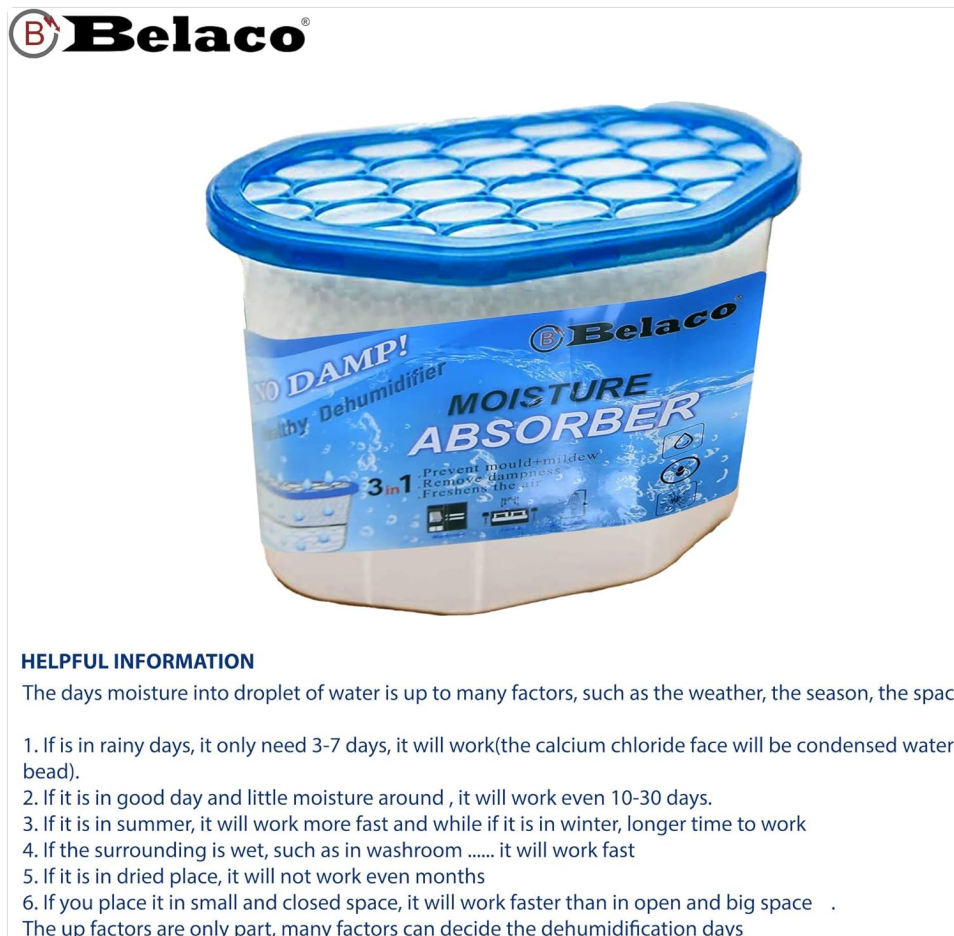
Image: Information on how environmental factors influence the dehumidifier's duration.