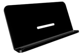
Sheet Music Stand