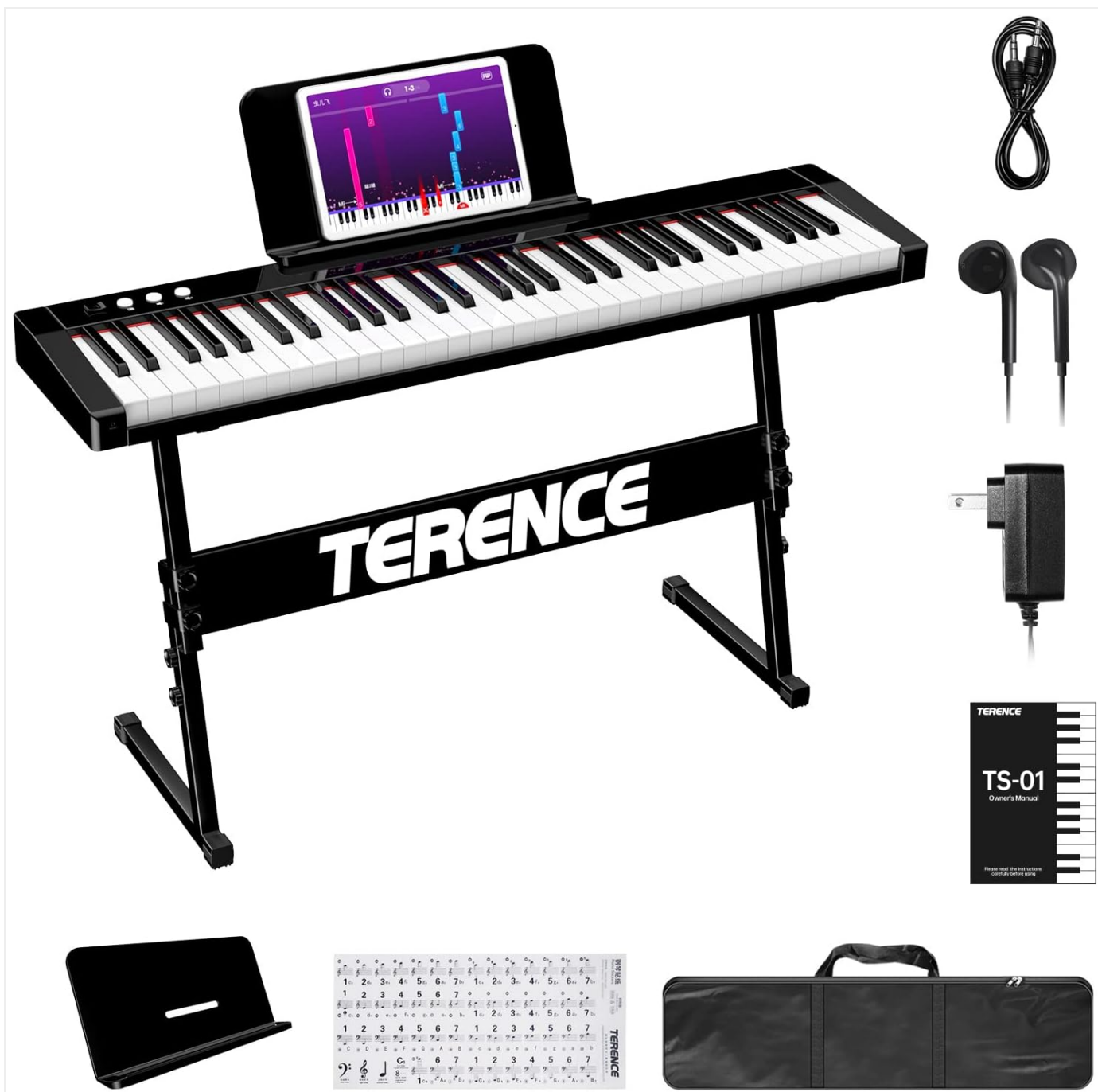
The TERENCE GTS01 keyboard piano, shown with its Z-style stand, sheet music stand, portable carrying bag, power adapter, earphones, AUX 3.5mm audio cable, piano note stickers, and user manual.