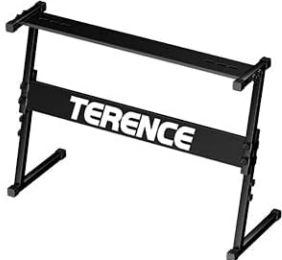
Z-Style Piano Stand