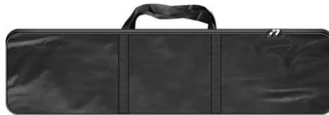
Portable Carrying Bag