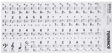
Piano Note Sticker