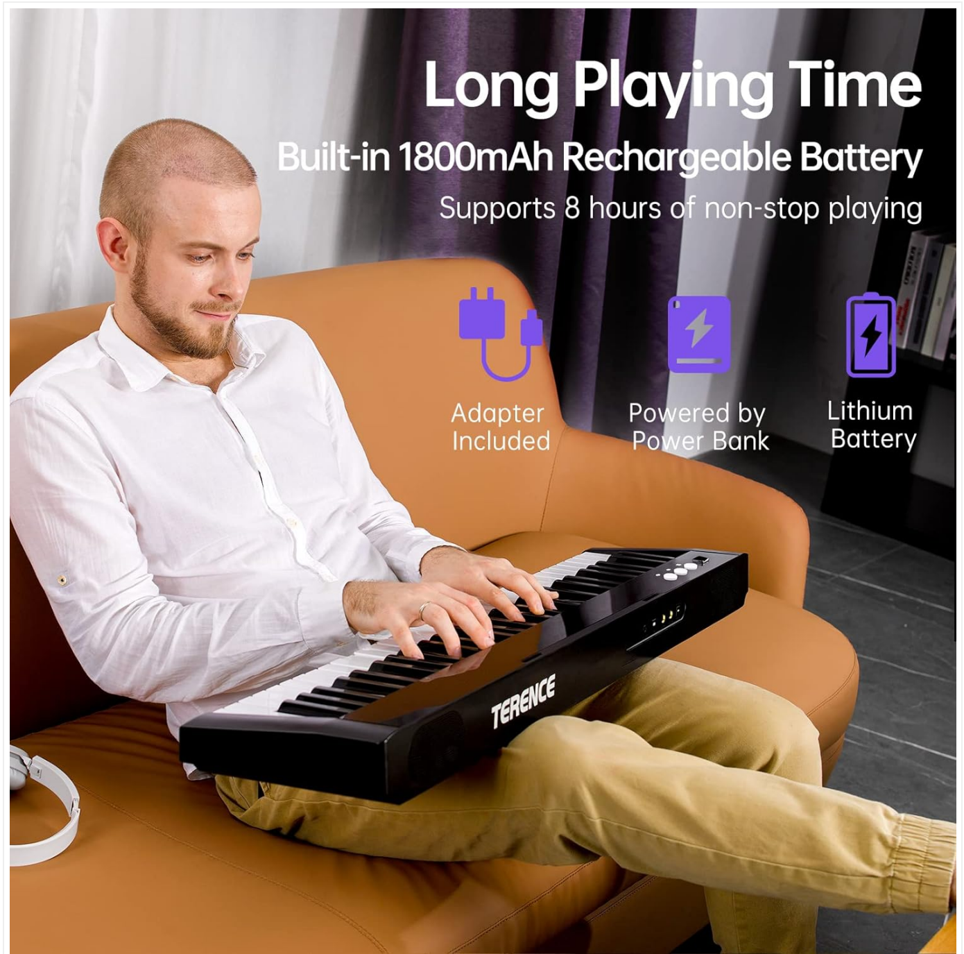
A user playing the TERENCE GTS01 keyboard piano, emphasizing its portability and long playing time thanks to the built-in 1800mAh rechargeable lithium battery, which provides up to 8 hours of use.