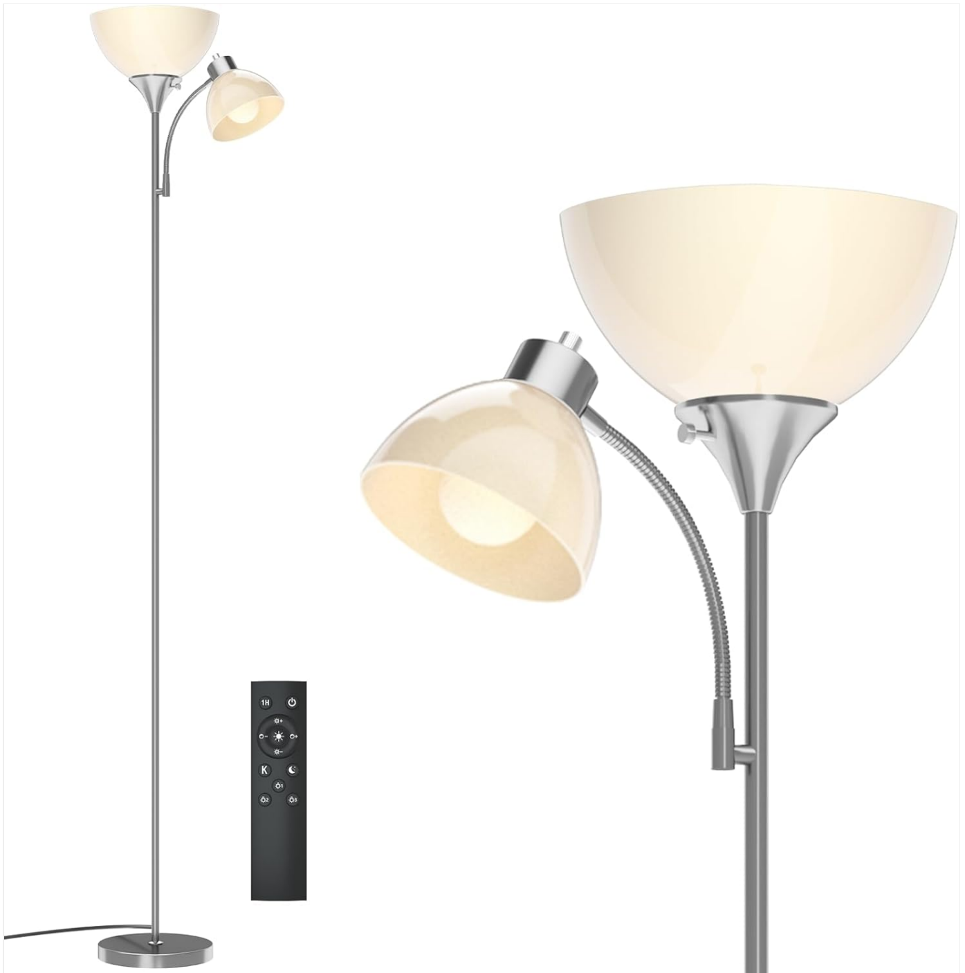
Image: The GERGO Floor Lamp in brushed nickel finish, featuring a main upward-facing light and a flexible gooseneck reading light, with its remote control displayed.