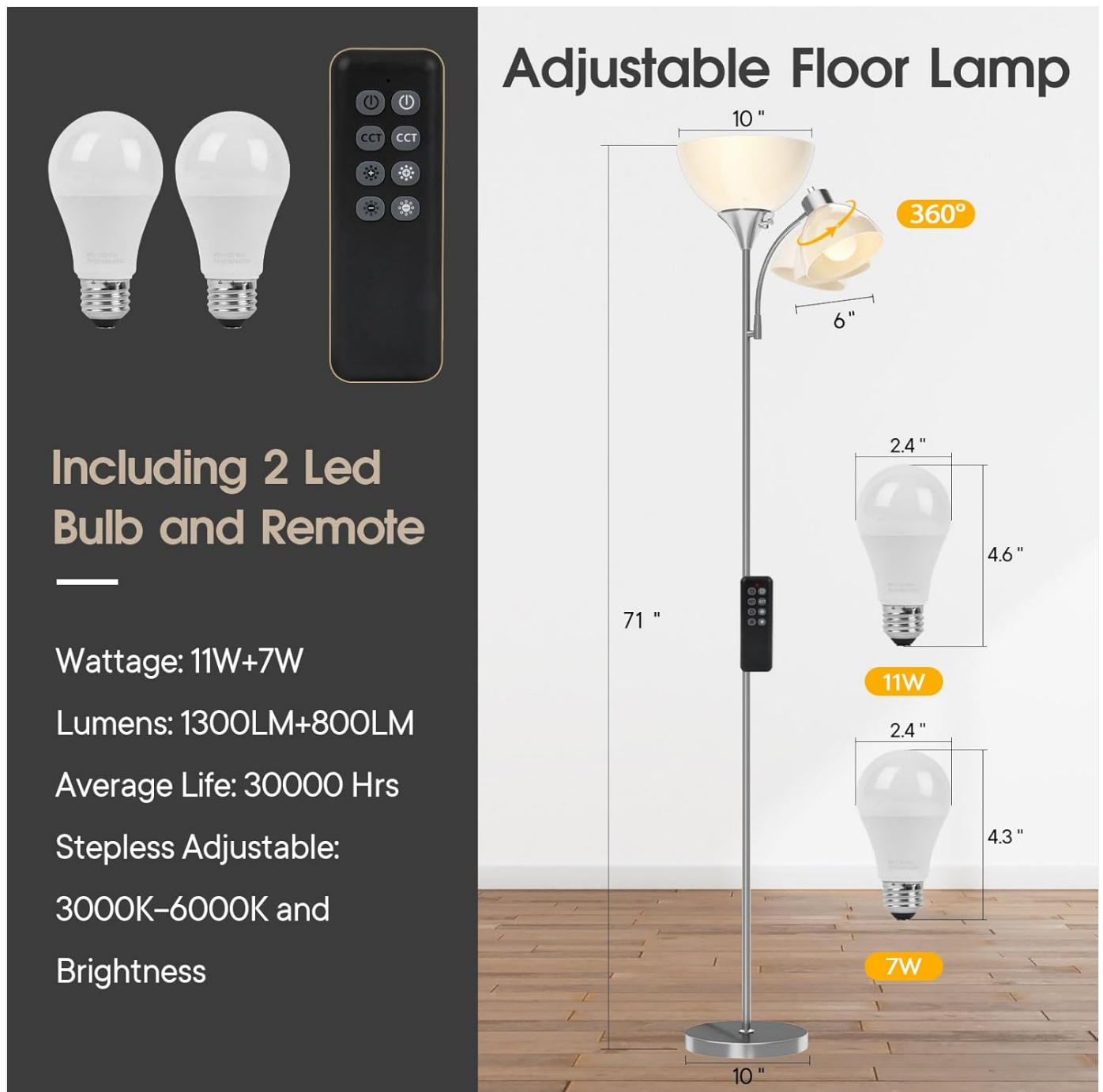
Image: A diagram illustrating the dimensions of the GERGO Floor Lamp and its main components, including the two LED bulbs and the remote control.