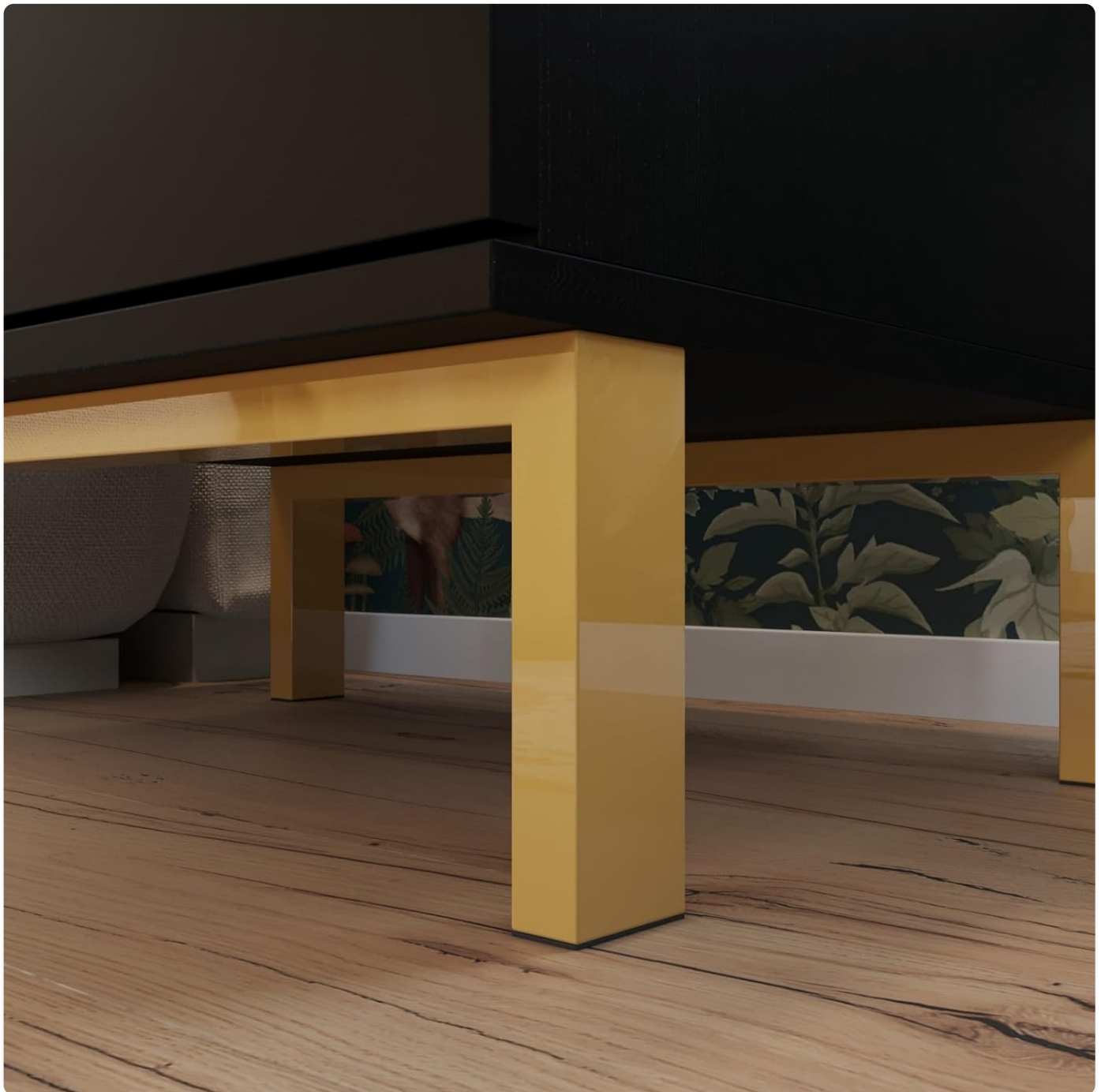
Image 3.2: A detailed view of the sturdy gold metal legs, which provide stable support for the nightstand.