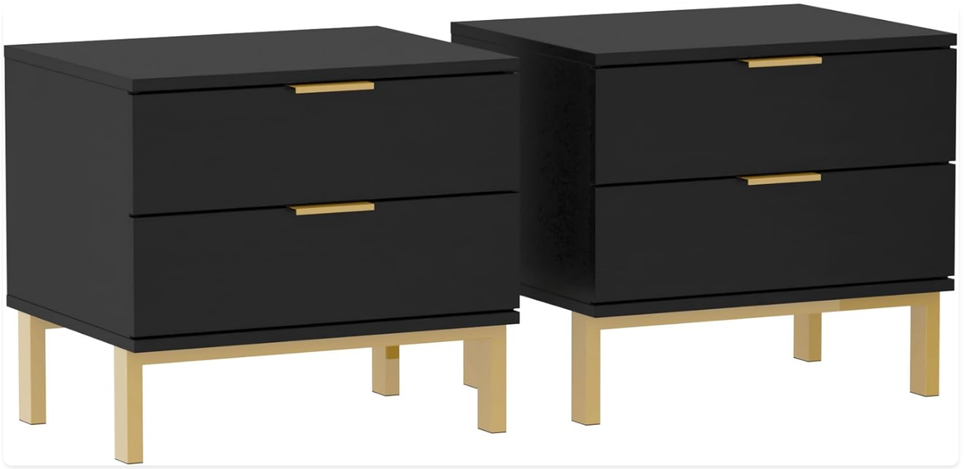
Image 3.1: The FUFU&GAGA Black Nightstand Set of 2, showcasing the completed assembly of both units.