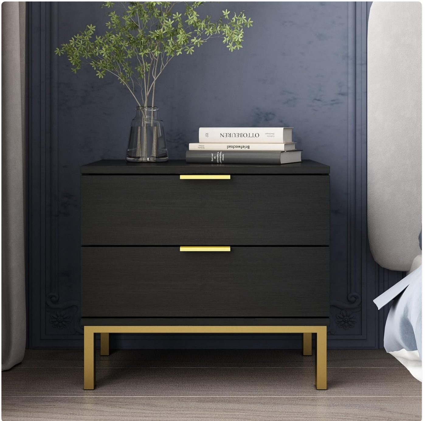
Image 1.1: A single FUFU&GAGA Black Nightstand positioned next to a bed in a modern bedroom setting, showcasing its design and functionality.