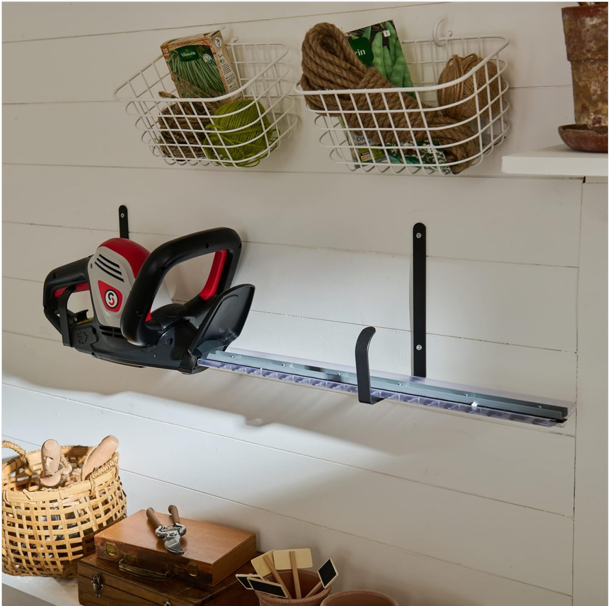
Image 4: The hedge trimmer stored securely on a wall, demonstrating a practical storage solution.