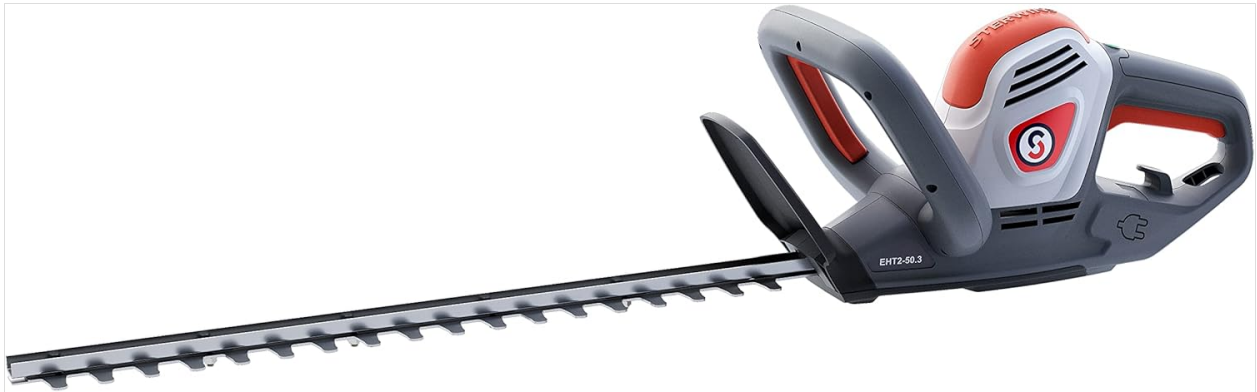
Image 1: The STERWINS 500W Electric Hedge Trimmer, showcasing its overall design and blade.