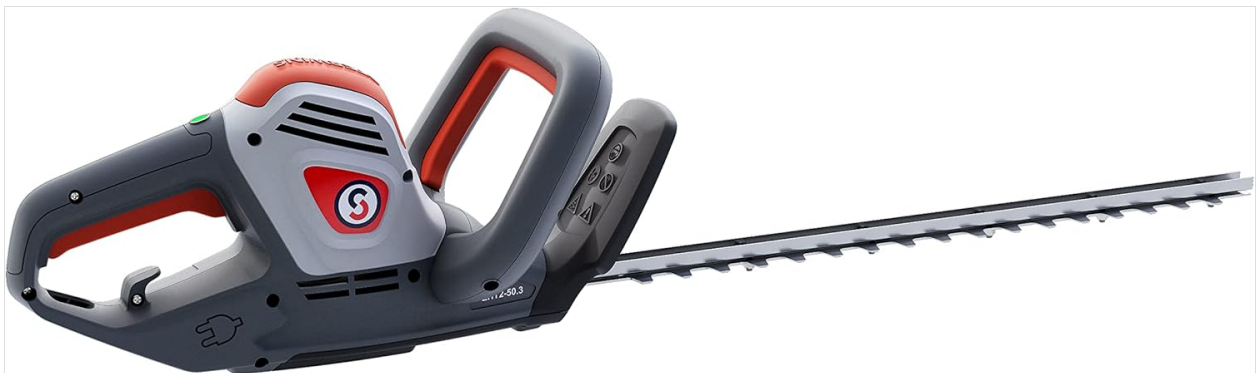
Image 2: Side view of the hedge trimmer, highlighting the ergonomic handle and control layout.