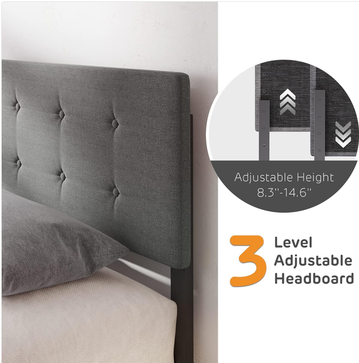
Figure 5.2: Adjustable Headboard Mechanism.