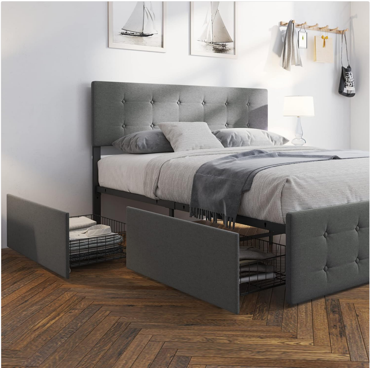
Figure 4.3: Fully Assembled Bed Frame with Storage Drawers.