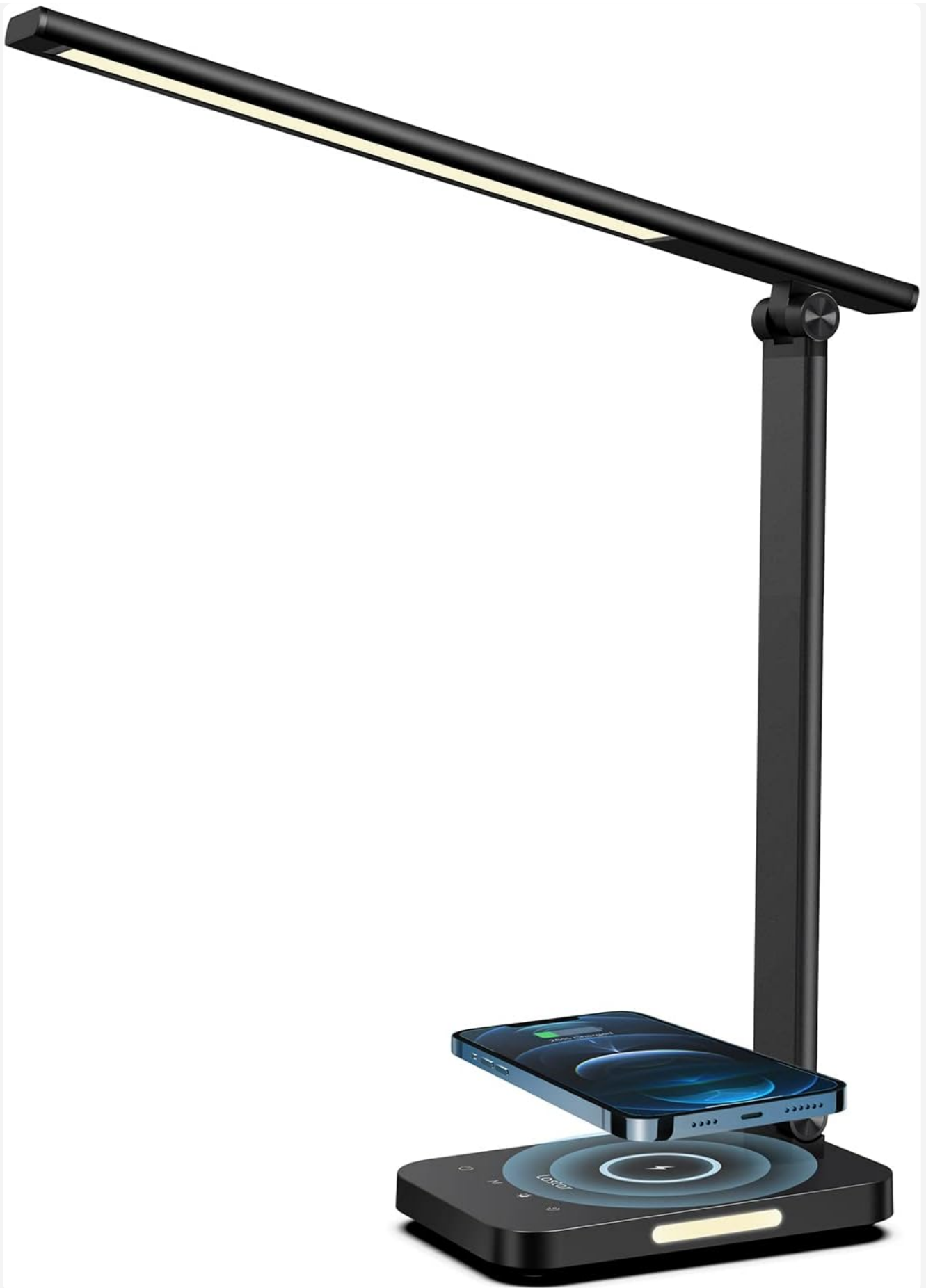
Figure 1: LASTAR LED Desk Lamp with integrated wireless charging pad and USB port.