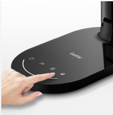
Figure 3: Touch control panel on the lamp base.