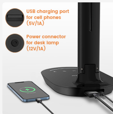
Figure 2: Power connector (12V/1A) and USB charging port (5V/1A) on the lamp base.