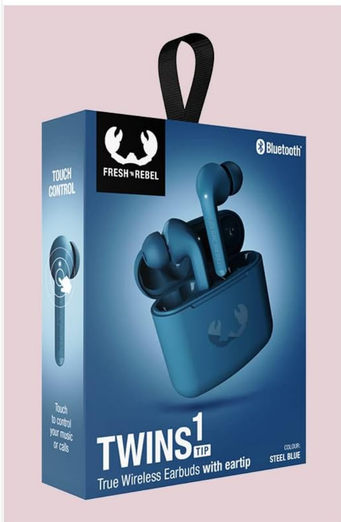
Image: A visual representation of the Fresh 'n Rebel Twins 1 Tip product contents, including the earbuds, charging case, USB-C charging cable, and three pairs of silicone ear tips (S, M, L).