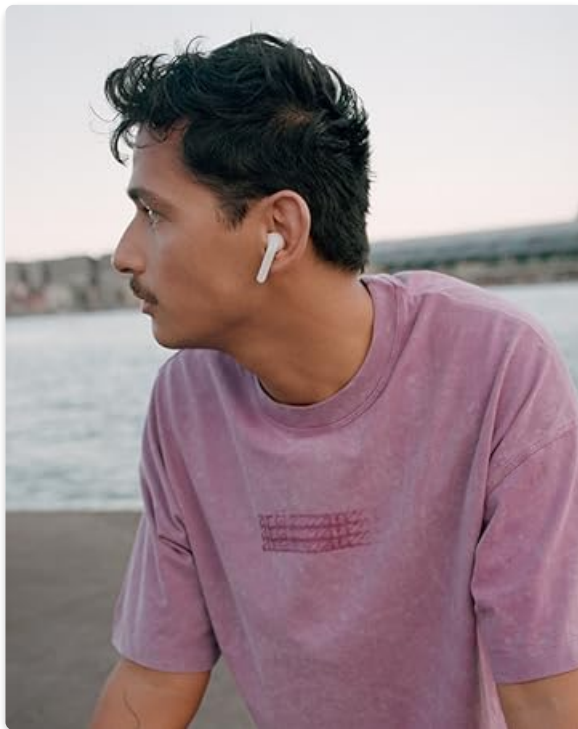
Image: A person wearing the earbuds, with speech bubbles indicating interaction with a voice assistant like Siri or Google Assistant.