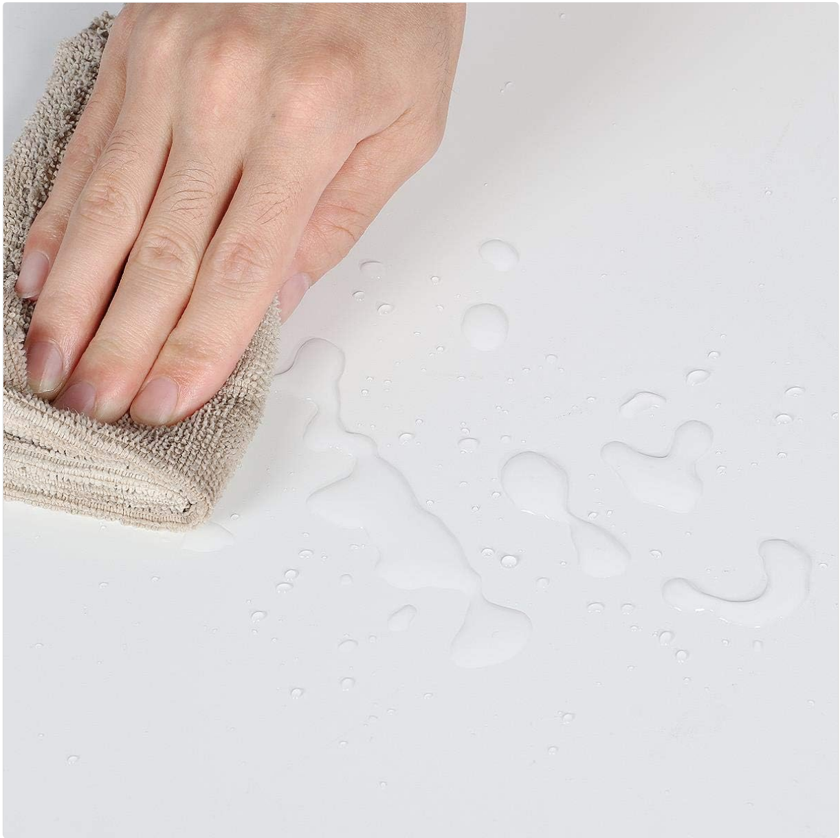
A hand wiping water droplets from the cabinet surface with a cloth, highlighting its water-resistant properties and ease of cleaning.