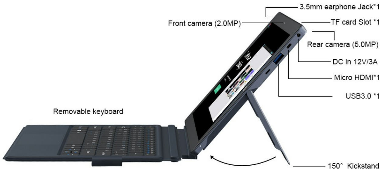
Image: A detailed diagram highlighting the various ports and features of the AWOW AiBook 10, including the kickstand and removable keyboard.