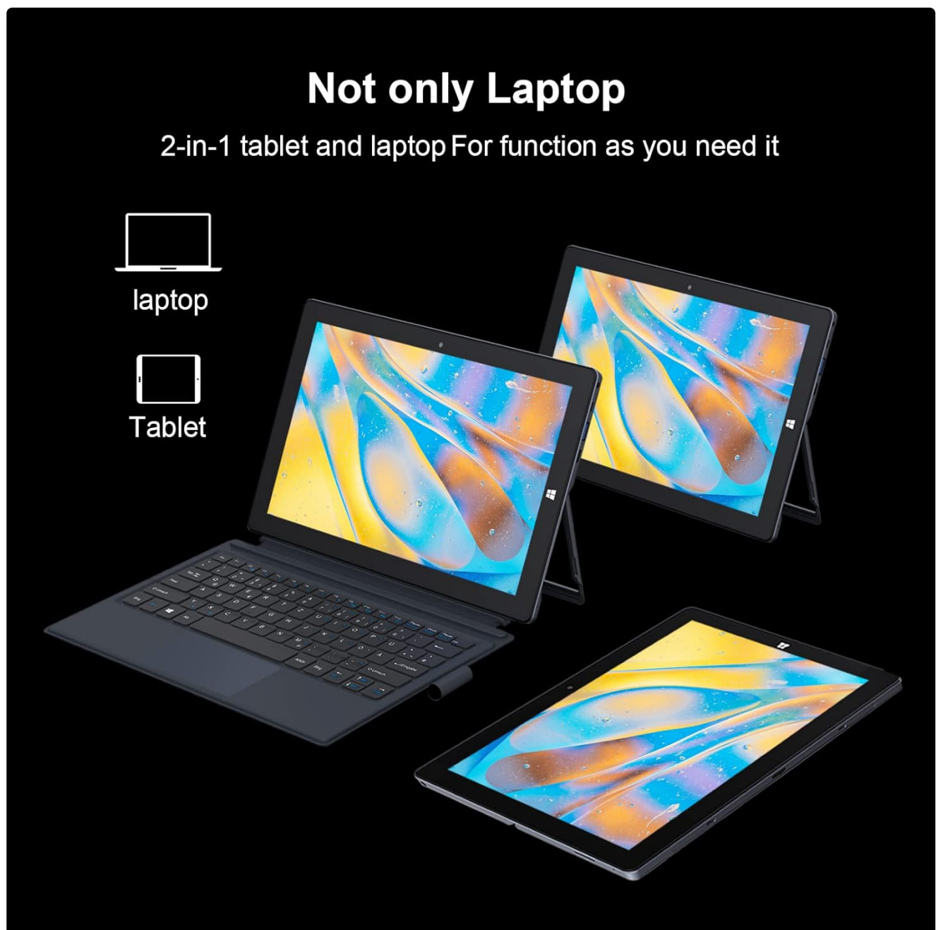
Image: The AWOW AiBook 10 configured in laptop mode, demonstrating its functionality with the keyboard and kickstand.

The AiBook 10 automatically detects when the keyboard is attached or detached and prompts you to switch between tablet and desktop modes in Windows. You can also manually switch via the Action Center (swipe in from the right edge of the screen or click the icon in the taskbar).