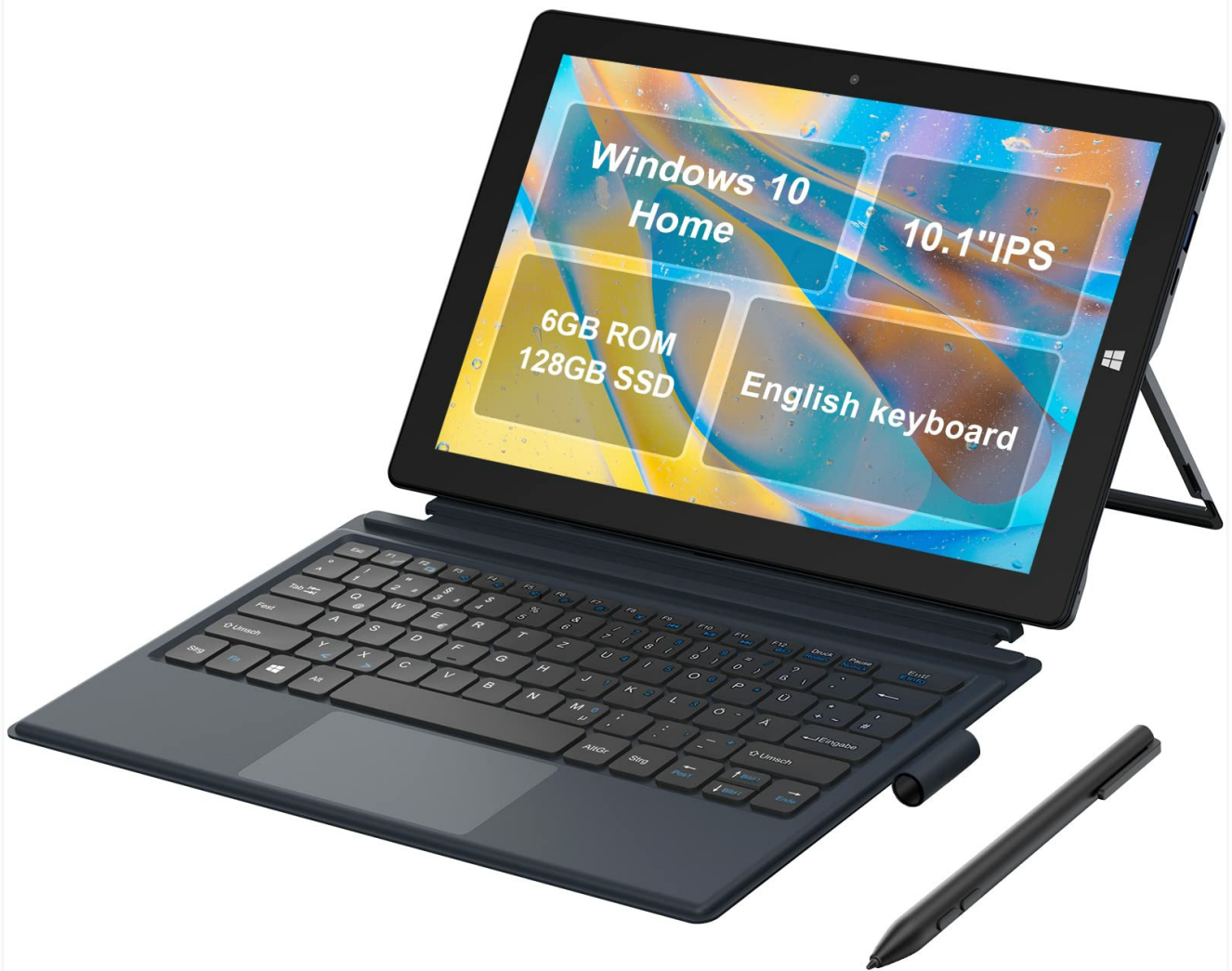
Image: The AWOW AiBook 10 tablet shown with its detachable keyboard, illustrating its 2-in-1 functionality.