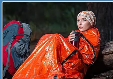
Emergency Sleeping Bag