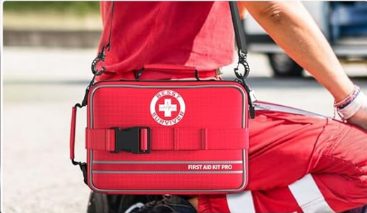
Removable Shoulder Strap

It to be attached to various platforms like cars, bikes, or backpacks, enhancing its portability and accessibility.