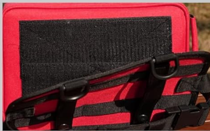
MOLLE Compatible Removable Velcro Panel