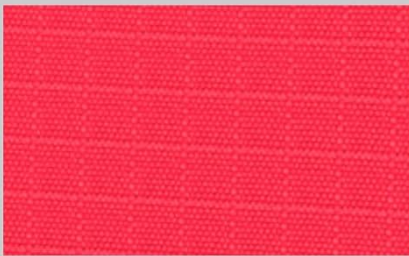
600D Ripstop Polyester