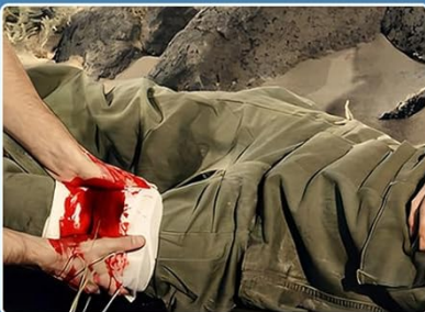
Severe Bleeding: Compressed Gauze