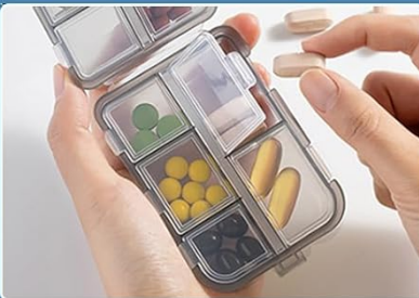
Travel Pills Organizer