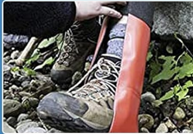
Sprains & Fractures: Splint