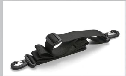
Detachable Shoulder Strap