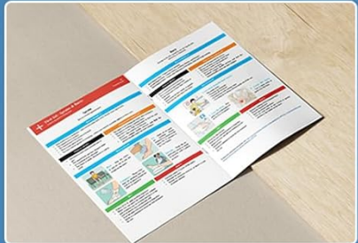
First Aid Guide

Image Description: A visual guide showcasing the application of various first aid items for different emergencies. It includes scenes of applying an Israeli bandage for severe bleeding, using a splint for fractures, eye care, the CPR kit, burn care, organizing pills, deploying an emergency sleeping bag, and consulting the first aid guide.