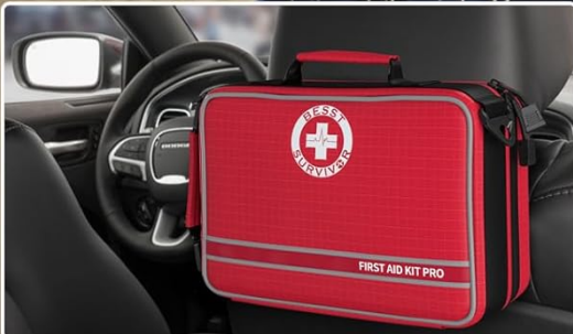
Removable Velcro Back Panel

Image Description: This image illustrates the versatility of the Best Survivor First Aid Kit's carrying and attachment options. It shows the kit being worn with a shoulder strap, secured to a backpack using its MOLLE system, and attached to the back of a car seat via its removable velcro panel.