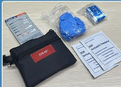
CPR Kit: Instructions Attached To Kit