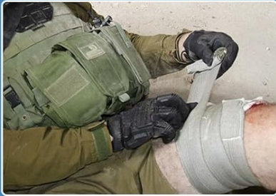
Severe Bleeding: Israeli Bandage

A comprehensive set of professional-grade medical supplies covering various emergency needs, ensuring you're well-prepared.