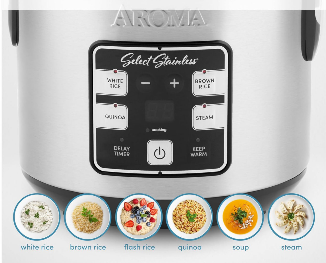
The digital control panel with various cooking functions.

Cook any grain perfectly, steam a variety of foods and much more with six versatile functions!