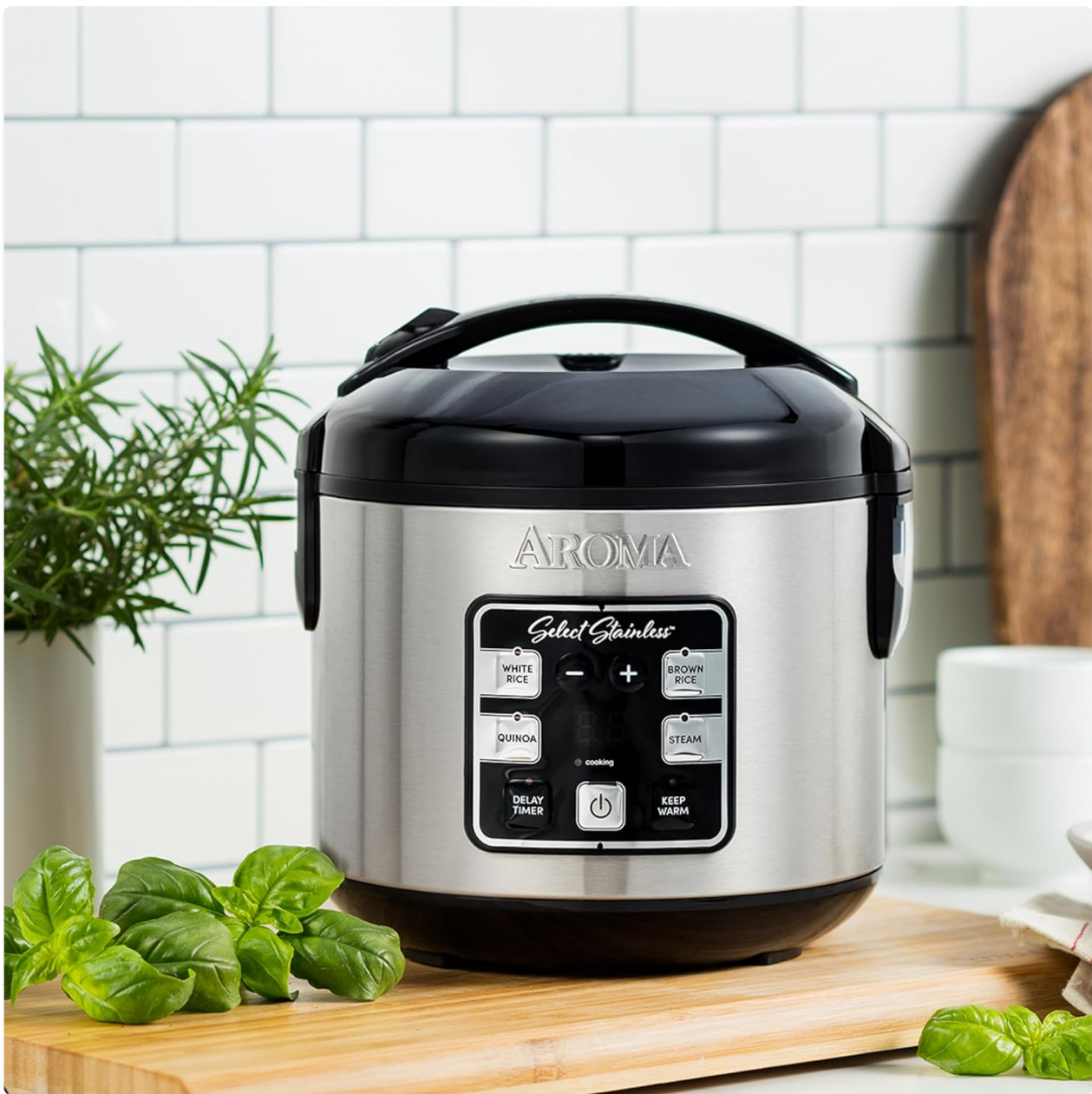
The Aroma Housewares Select Stainless Digital Rice & Grain Multicooker (ARC-914SBDS).