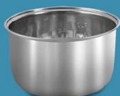
Stainless Steel Inner Pot