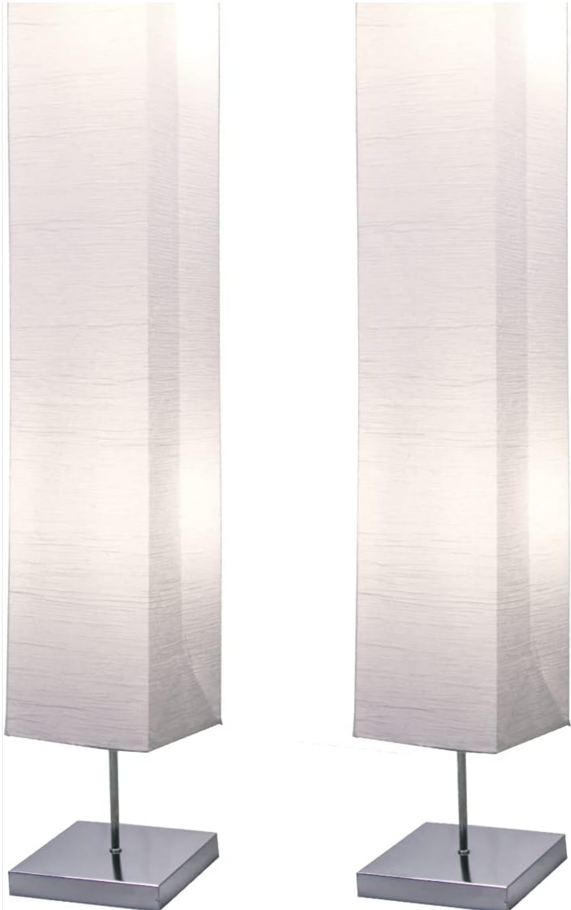
Image 1.1: The LIGHTACCENTS Honors Paper Floor Lamps (2 Pack Set).