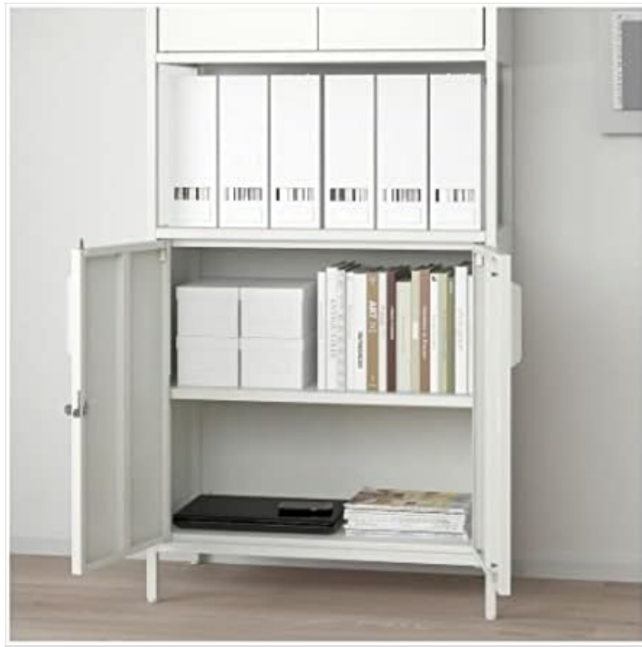
Image: Interior view of the IKEA TROTEN Cabinet, demonstrating the adjustable shelves and ample storage space for files and books.