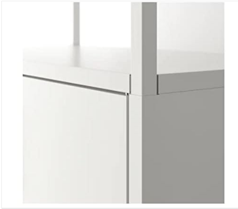
Image: Detailed view of the corner joint and construction of the IKEA TROTTEEN Cabinet, highlighting the precise fit of components.