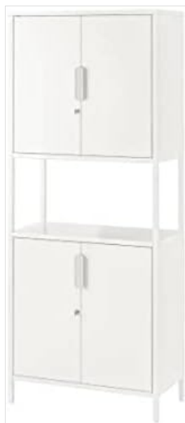
Image: Fully assembled IKEA TROTTEN Cabinet with Doors, showing its two-tier design and white finish.