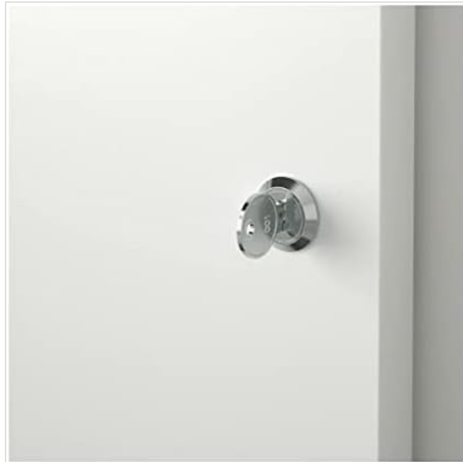
Image: Close-up of the key lock mechanism on the IKEA TROTTEEN Cabinet door, providing secure storage.