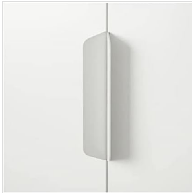
Image: Close-up of the sleek, integrated handle design on the IKEA TROTEN Cabinet door.