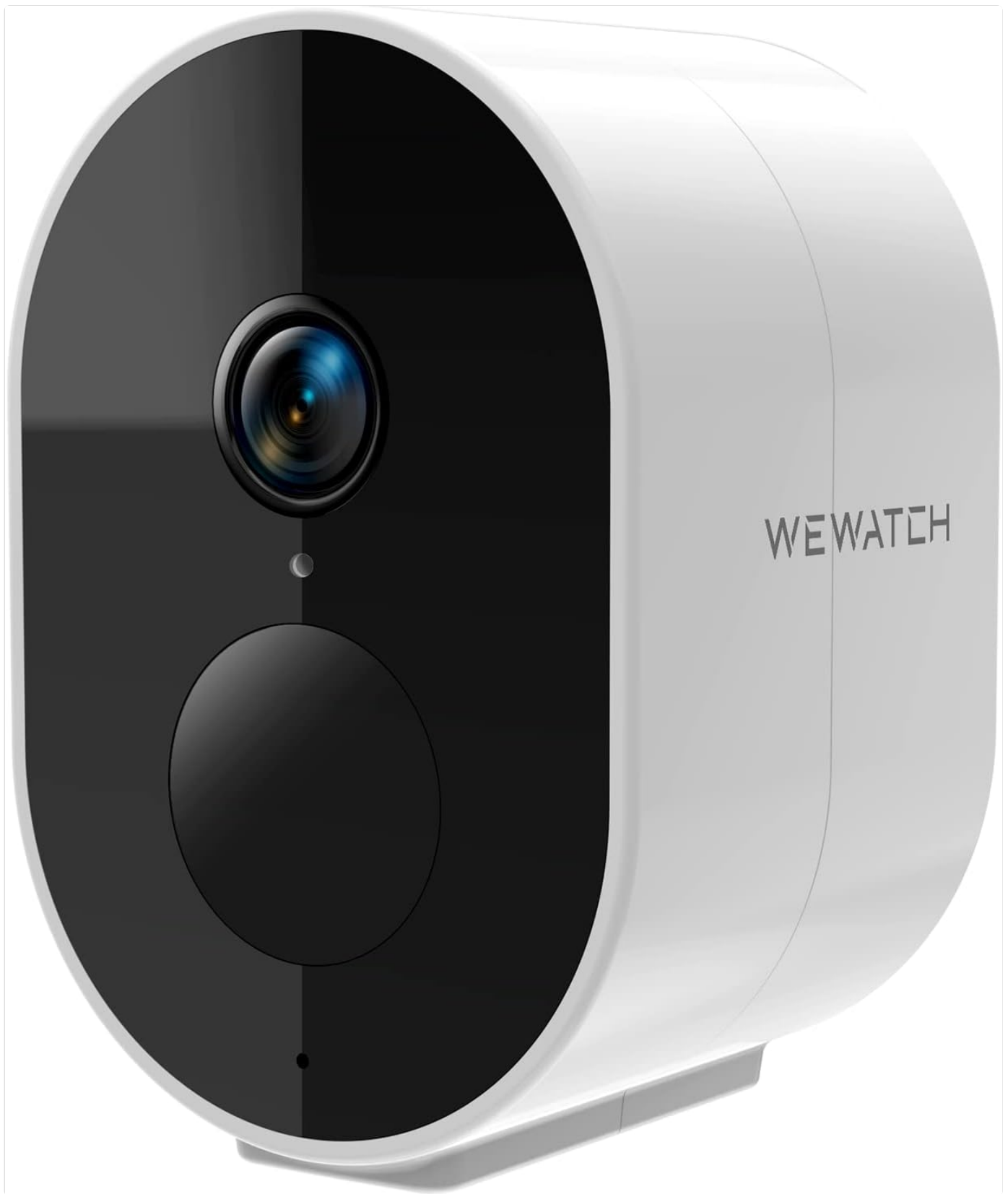
Image 1.1: Front view of the WEWATCH IPF1 Security Wireless Camera, showcasing its compact design and lens.