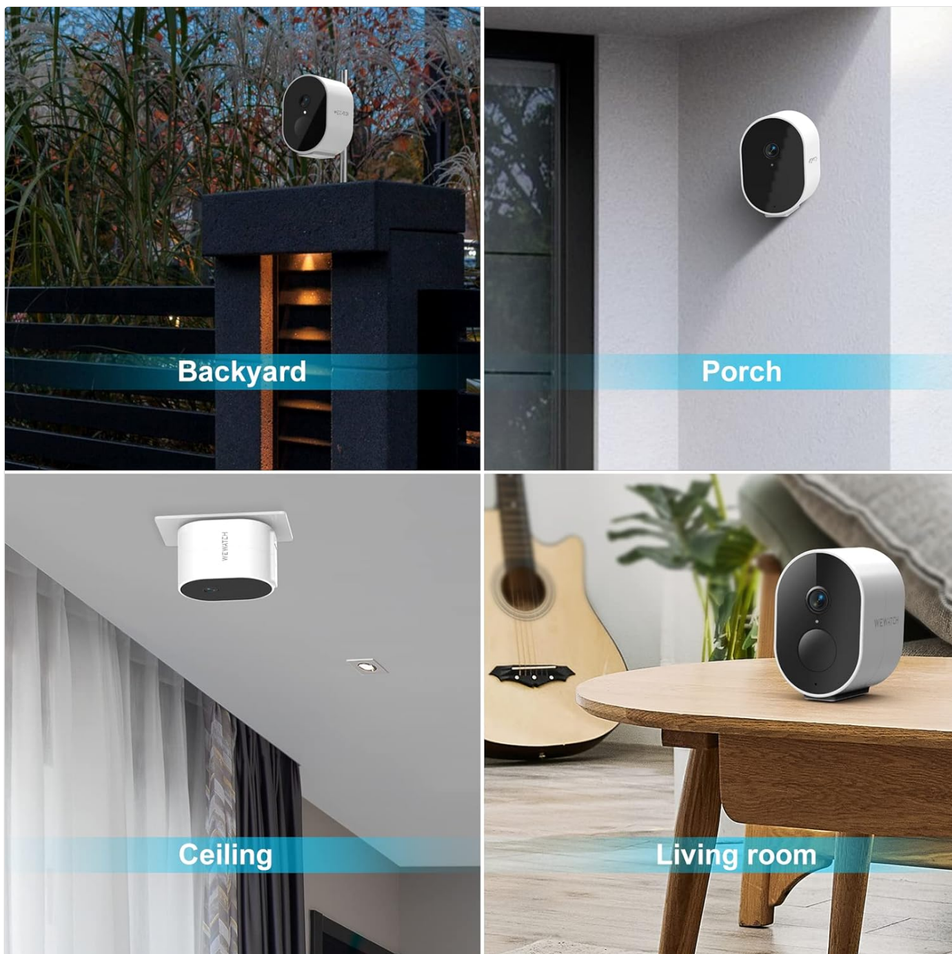
Image 3.6: Examples of camera placement in a backyard, on a porch, mounted on a ceiling, and on a table in a living room.