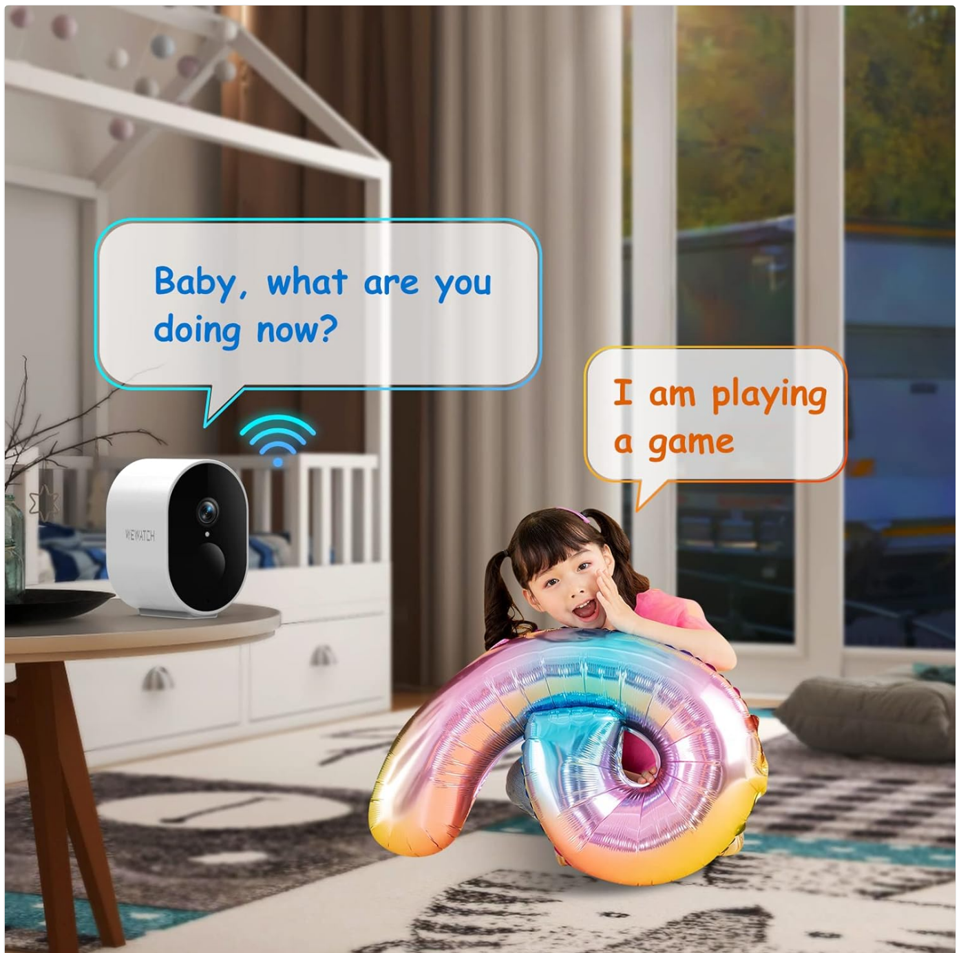
Image 3.4: A child interacting with the camera, demonstrating the two-way audio function.