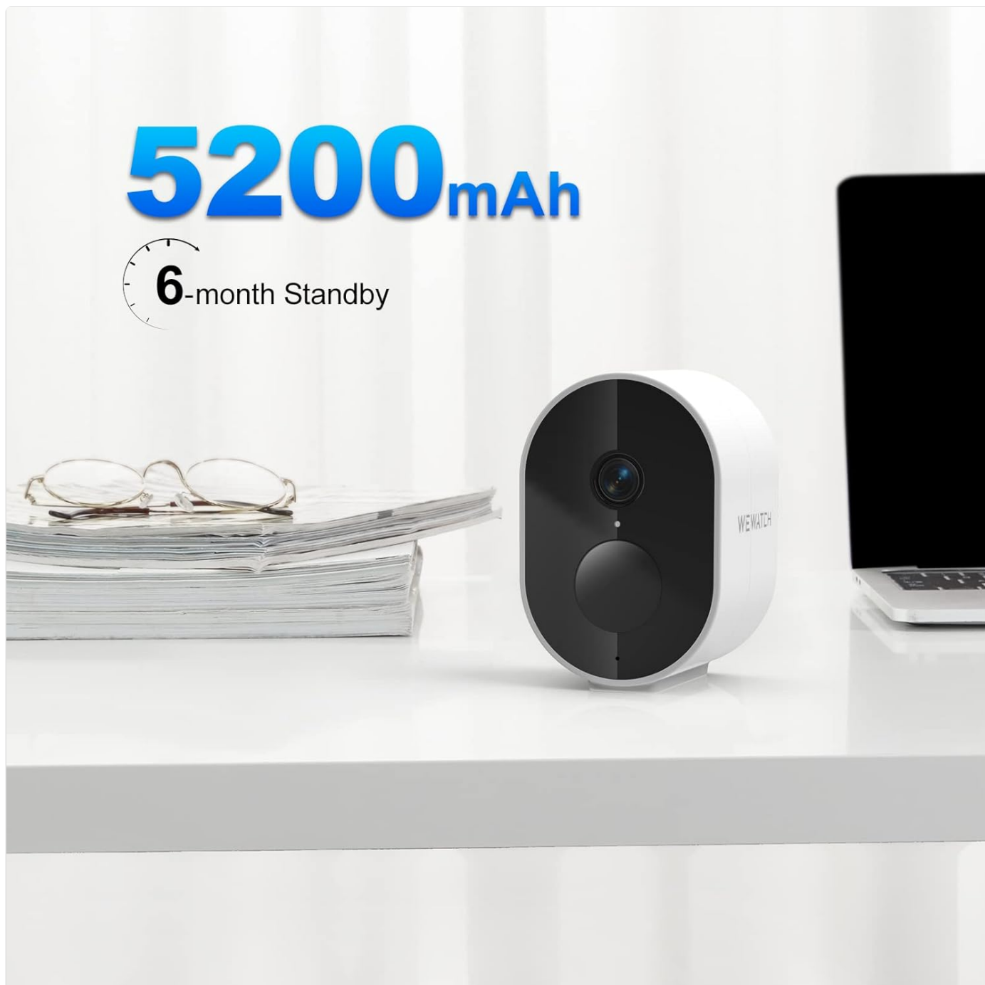
Image 3.3: The camera on a desk, illustrating its long-lasting 5200mAh battery and 6-month standby capability.