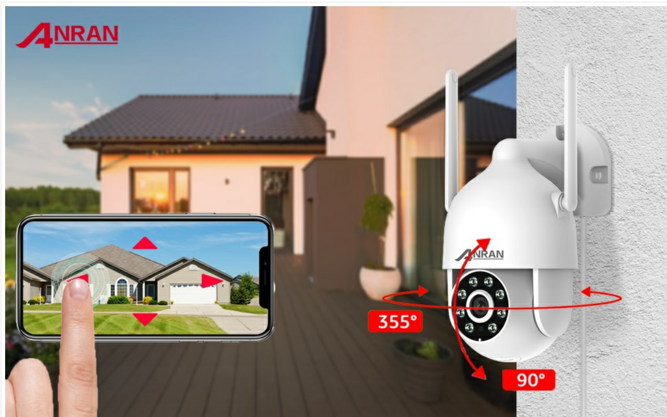
Image 4.1: Camera mounted on a wall, illustrating 355° pan and 90° tilt capabilities.