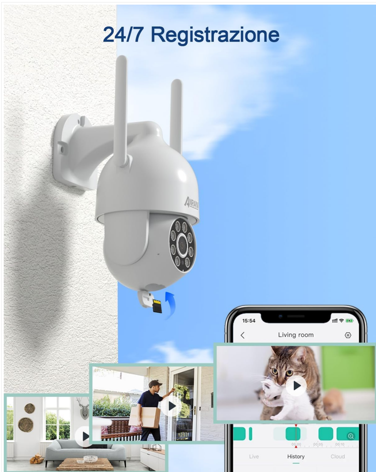
Image 5.1: Remote control of camera pan and tilt via the mobile application.