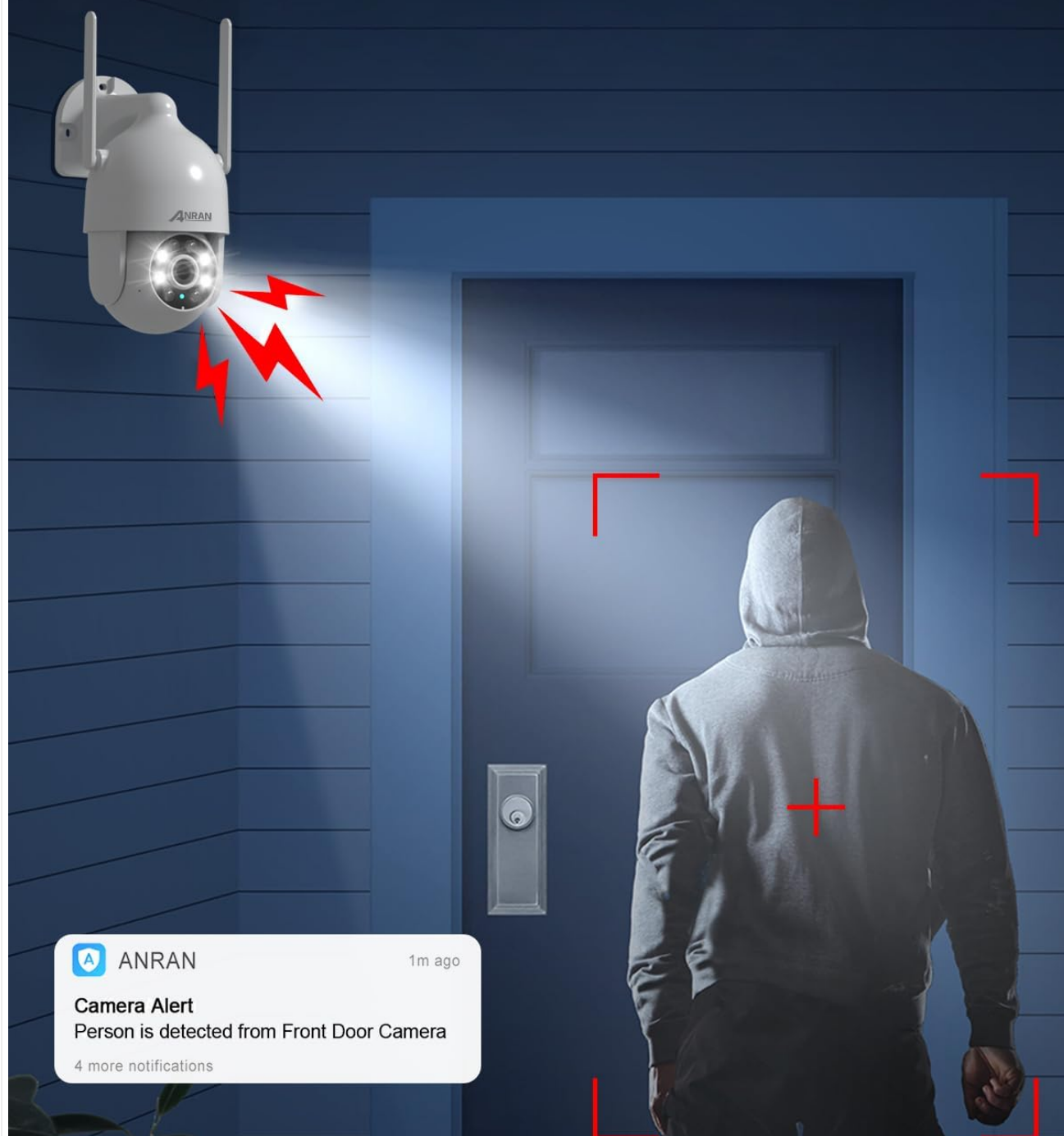
Image 5.2: Spotlight alarm and mobile notification triggered by motion detection.