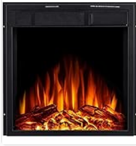
Figure 6: A close-up view of the realistic LED flame effect and glowing log set, showcasing the visual appeal of the R.W.FLAME electric fireplace.