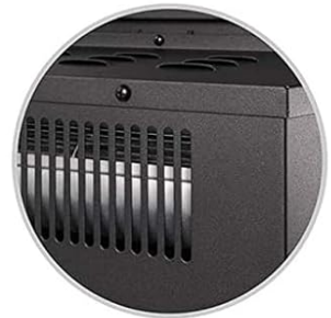
Back air vent