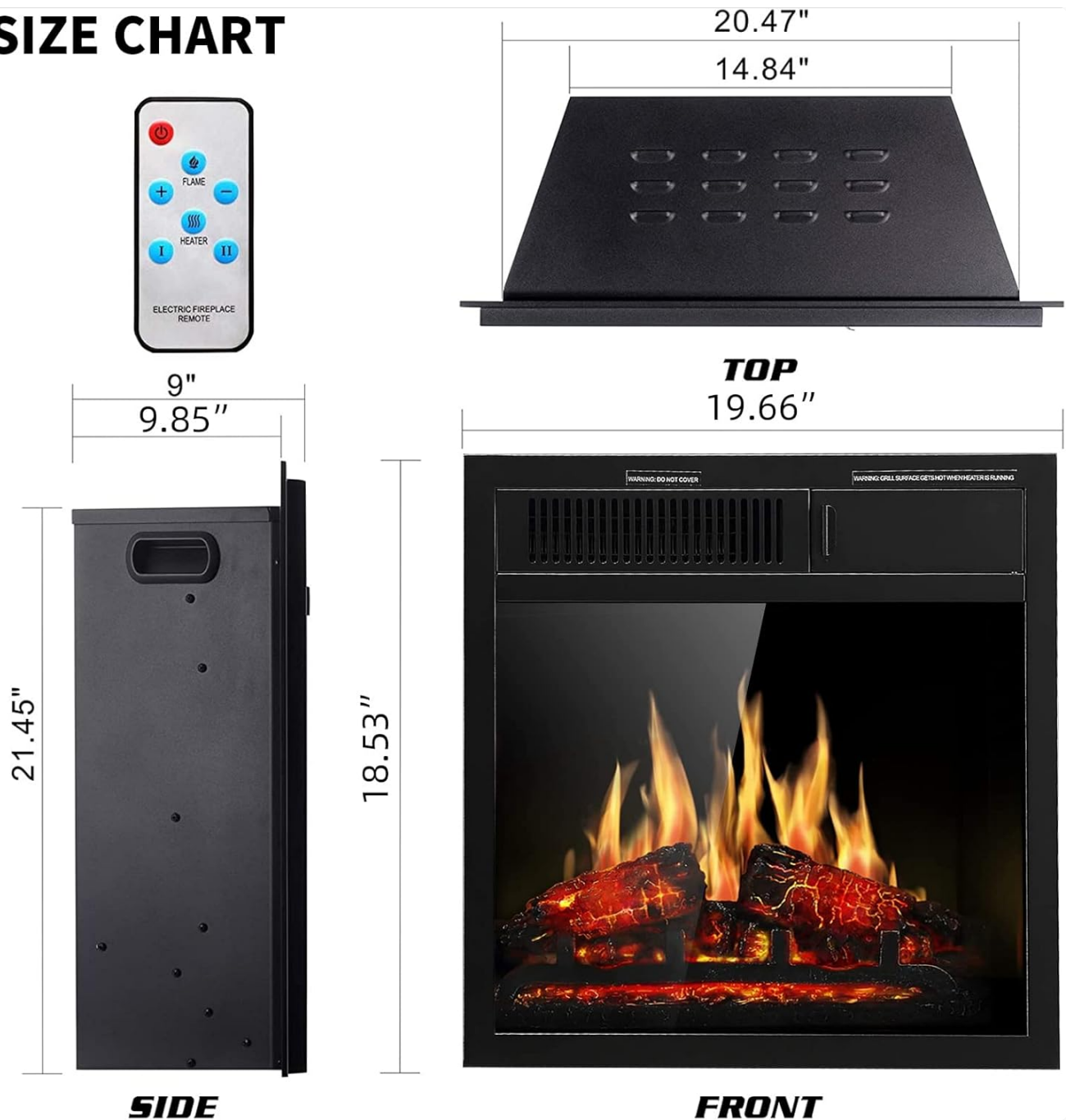
Figure 3: Detailed size chart for the R.W.FLAME 20-inch electric fireplace, providing precise front, side, and top dimensions in inches to assist with installation planning.

Refer to the detailed size chart for exact measurements to ensure a proper fit for recessed applications.