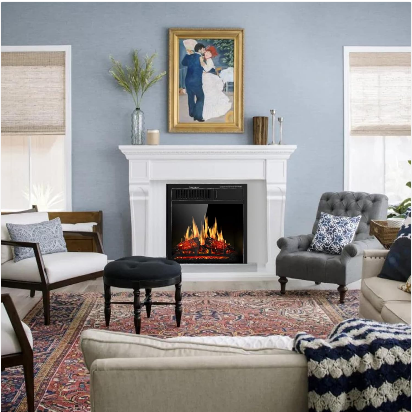
Figure 1: R.W.FLAME 20-inch electric fireplace in a living room setting, free-standing under a mantel. This image shows the fireplace as a focal point in a decorated room.