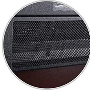
Hot Air Outlet