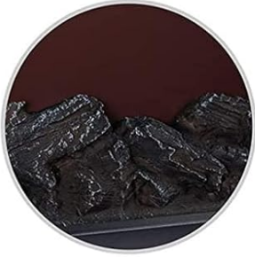
Realistic Log Insert