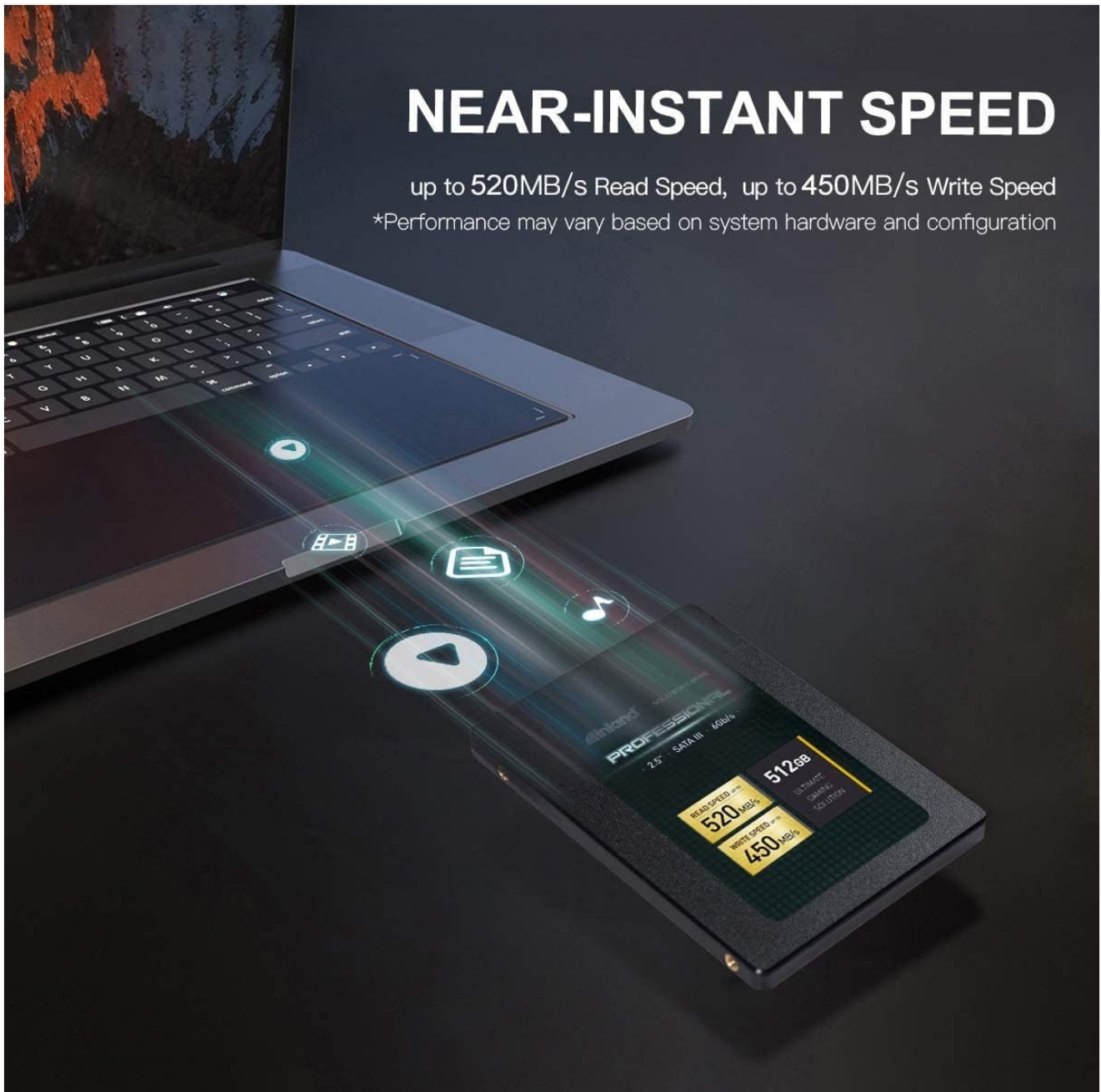
Image: An INLAND SSD connected to a laptop, illustrating its role in enhancing system speed and data handling.