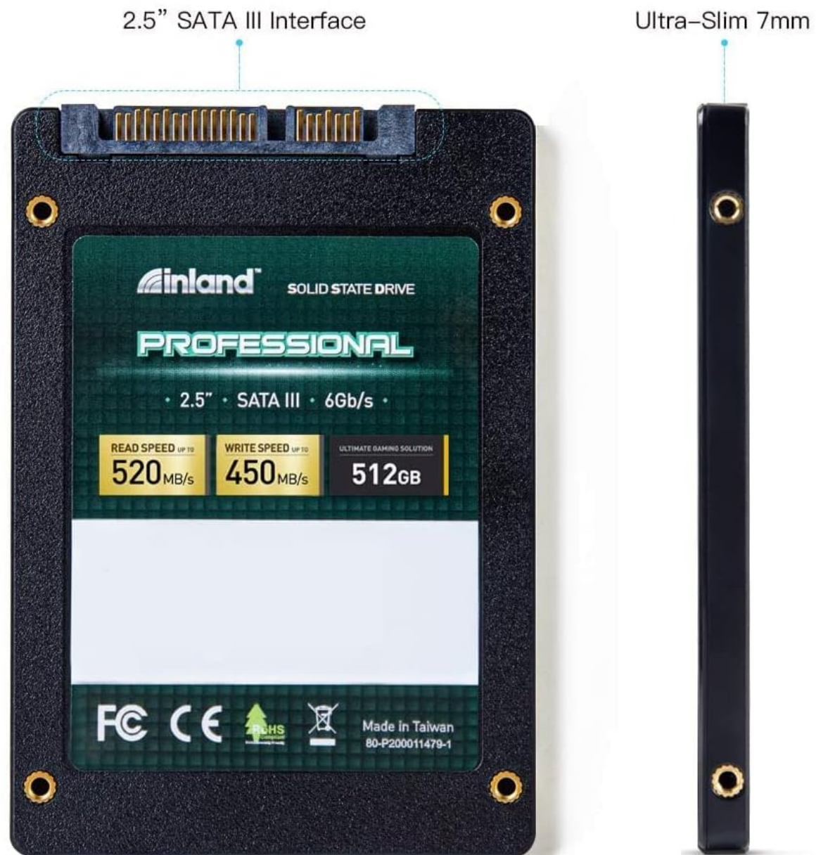
Image: Front view of the INLAND Professional 512GB SSD, showing the SATA III interface and performance specifications.