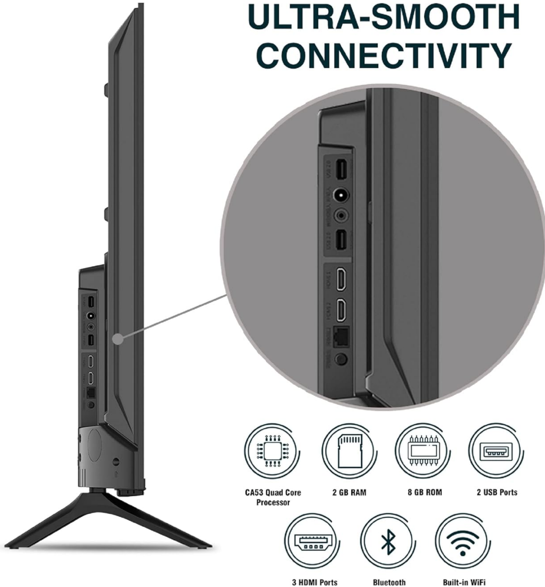
Image: Detailed view of the TV's connectivity ports.