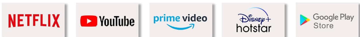
Image: Android TV home screen showing available applications.