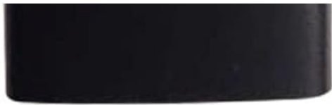
Image: Sansui Smart Remote Control with voice control and app hotkeys.