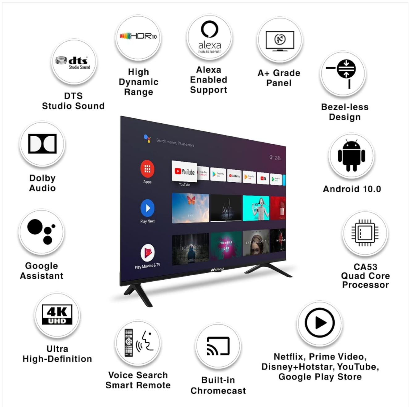
Image: Visual representation of the TV's main features and capabilities.