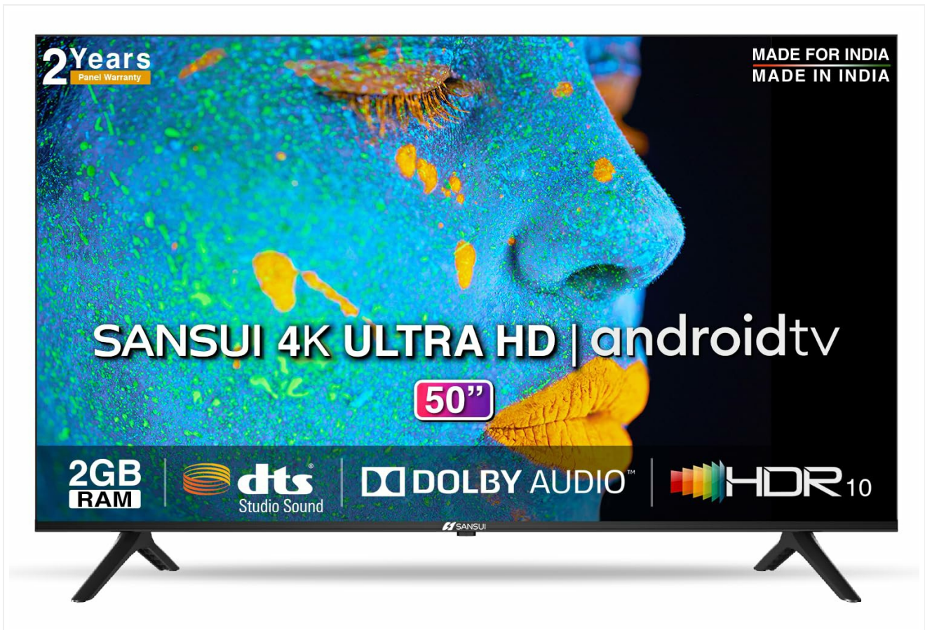
Image: Sansui 50-inch 4K Ultra HD Android LED TV with its table stand.