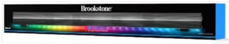
Figure 3.1: Front view of the Brookstone HD LED Soundbar.