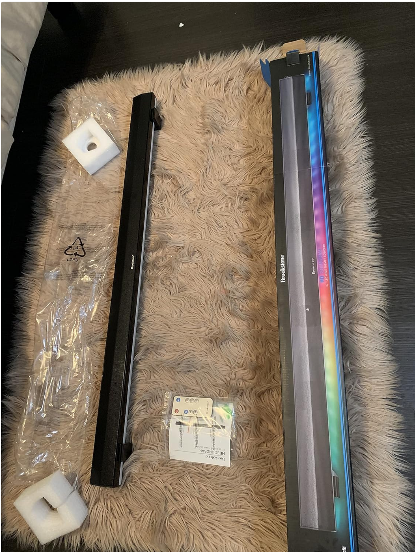
Figure 2.1: Unboxed contents of the soundbar package.