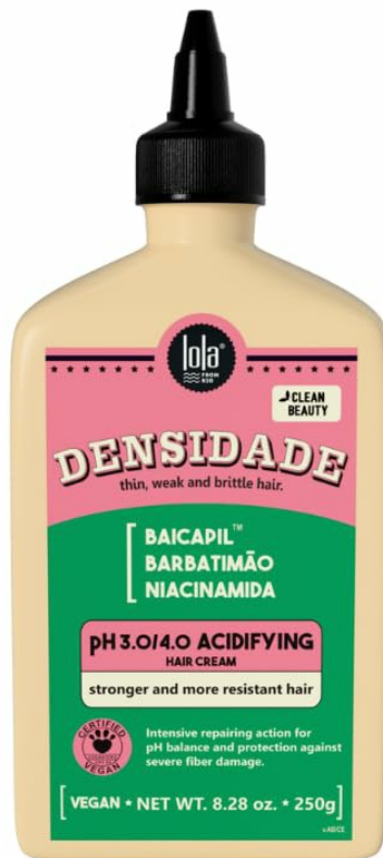
Image: Lola From Rio Densidade Acidifying Hair Cream in its bottle packaging.