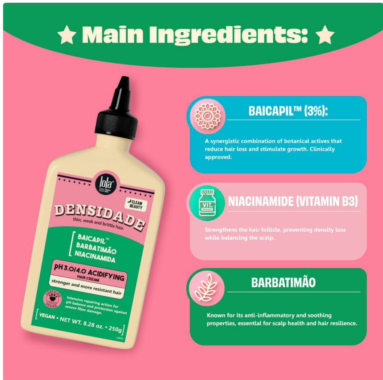
Image: Detailed breakdown of the primary active ingredients and their benefits.