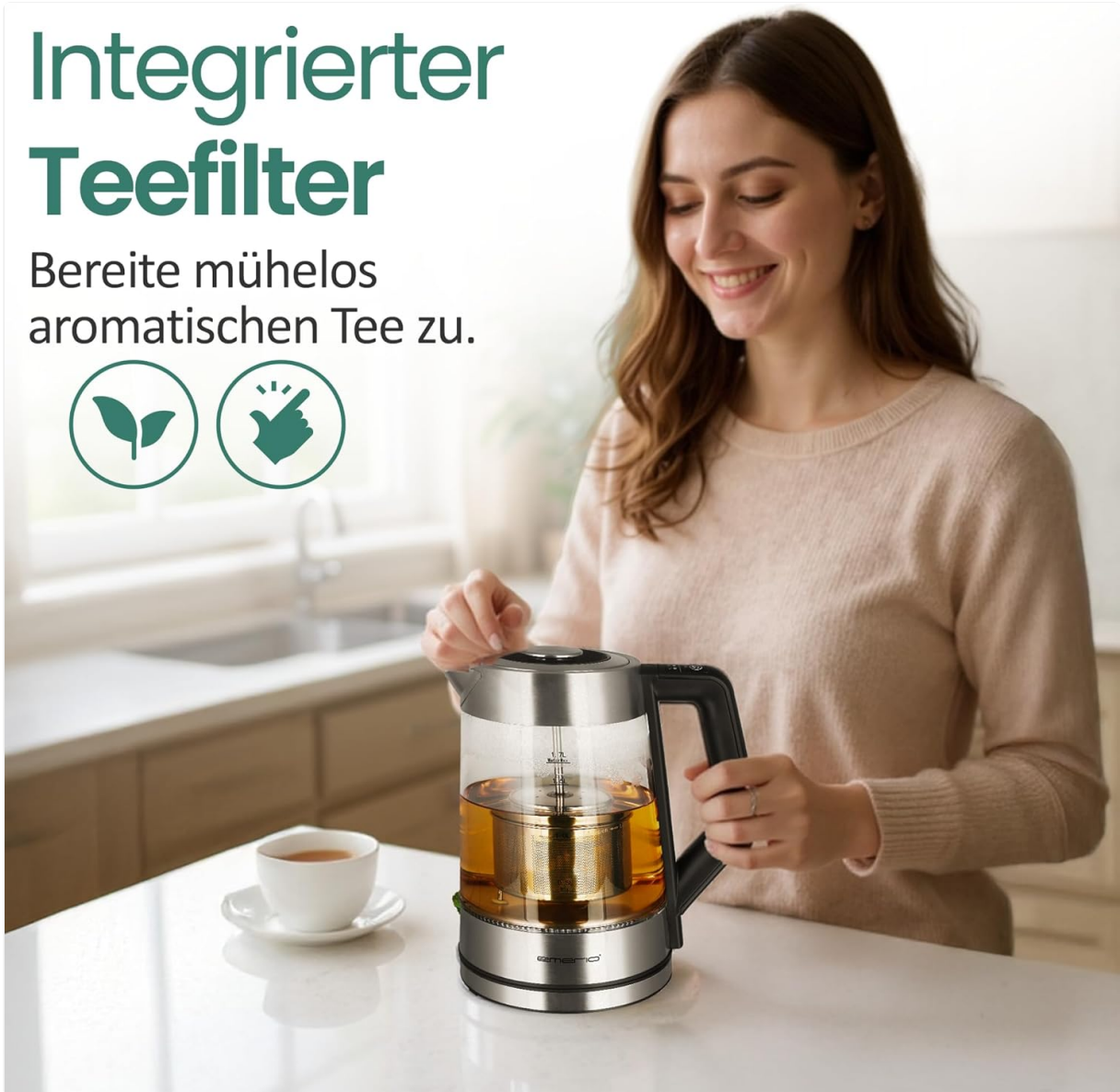
Image: A person demonstrating the placement of the tea infuser into the Emerio WK-122730 glass kettle.