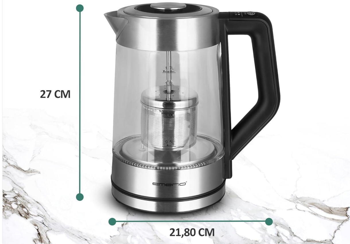
Image: The Emerio WK-122730 glass kettle displaying its approximate height (27 cm) and base width (21.80 cm).