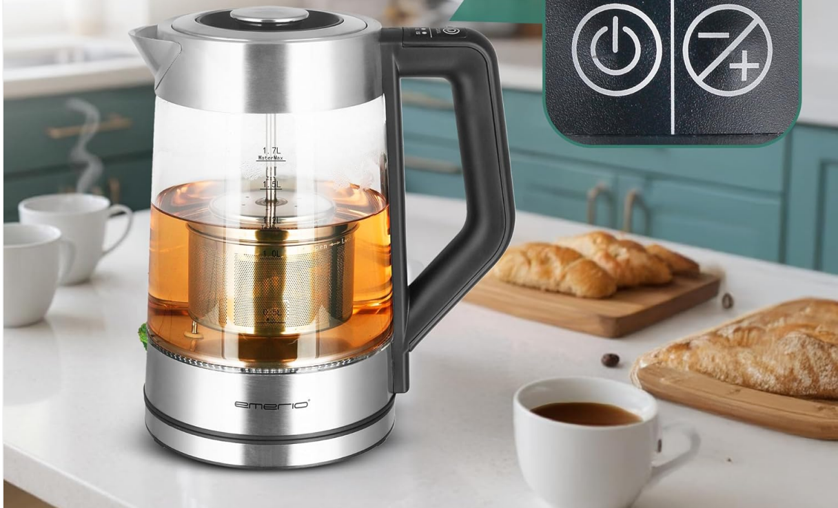
Image: A close-up of the control panel on the Emerico WK-122730 kettle, showing temperature selection buttons and power button.