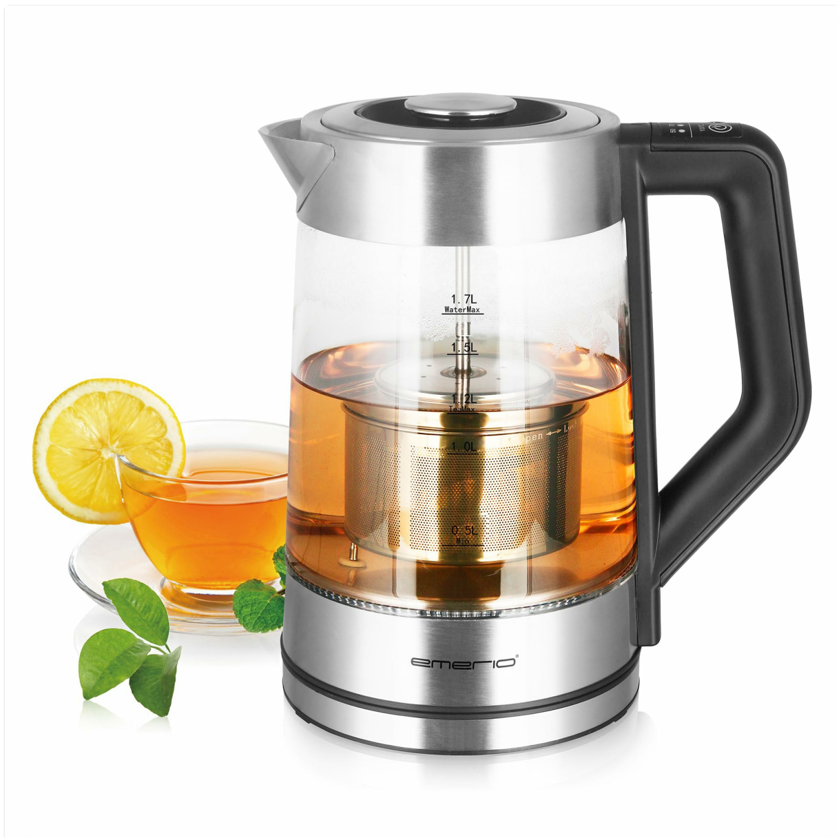
Image: The Emerio WK-122730 glass kettle with its integrated tea infuser, filled with tea, on a wooden surface.