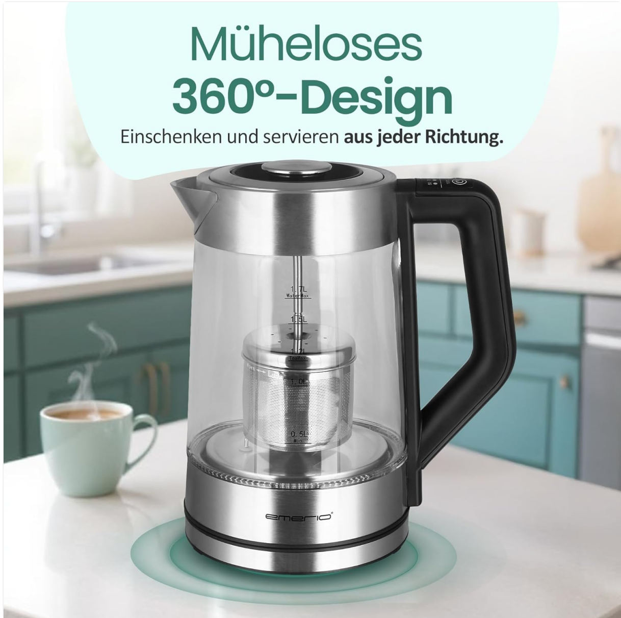
Image: The Emerio WK-122730 glass kettle resting on its 360-degree rotating power base, illustrating ease of placement.