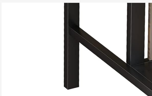
Stable & Non-slip Foot