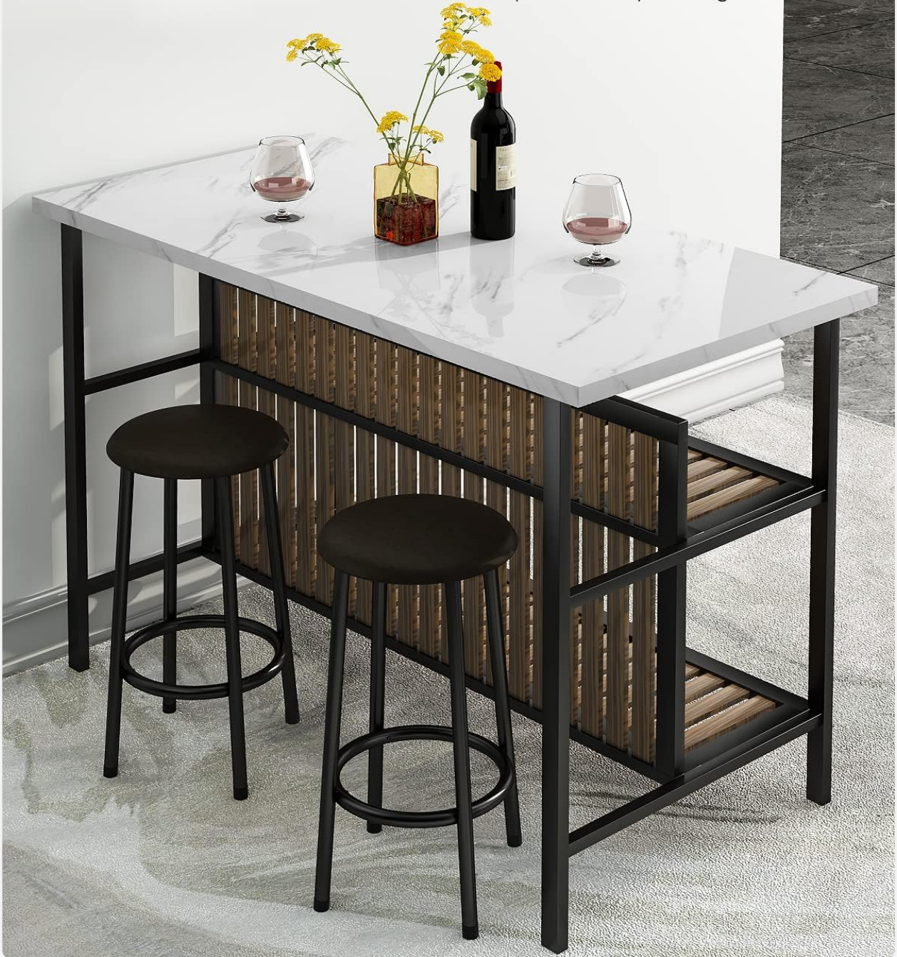
Image: The AWQM Kitchen Island Bar Table Set with two stools tucked underneath, demonstrating its space-saving design in a modern kitchen setting.

Dining table set includes 2 Stool that fit perfectly underneath the table to save space in any setting