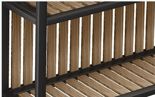
Large Storage Spaces