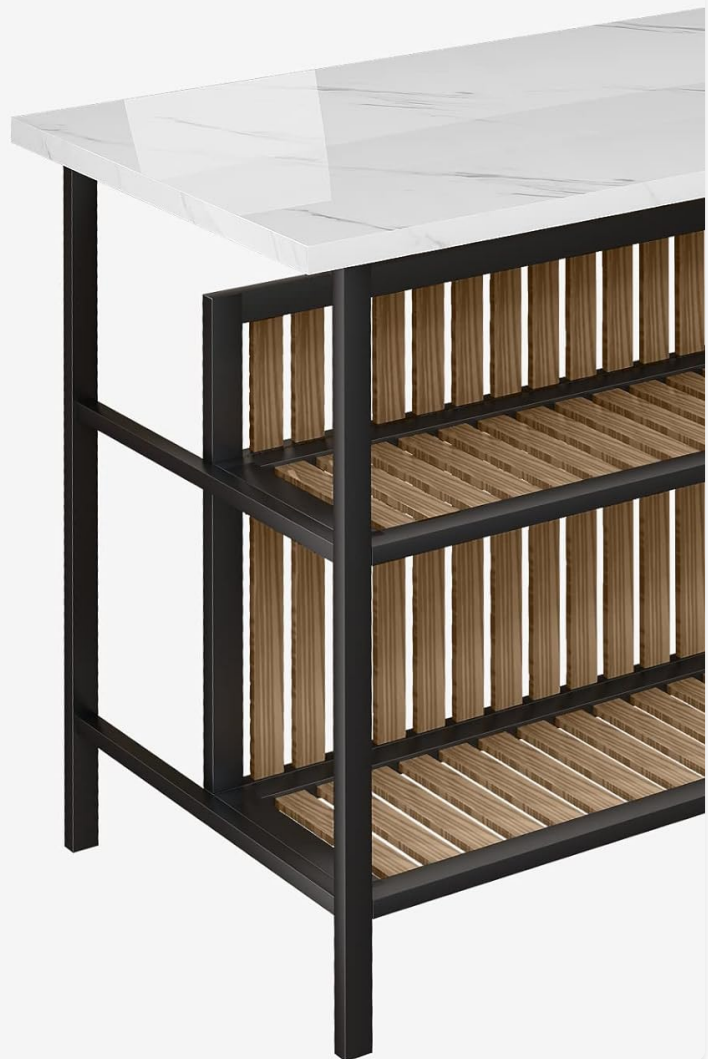
Image: Detailed features of the table, highlighting its easy-to-clean, waterproof surface, ample storage, and stable, non-slip feet.