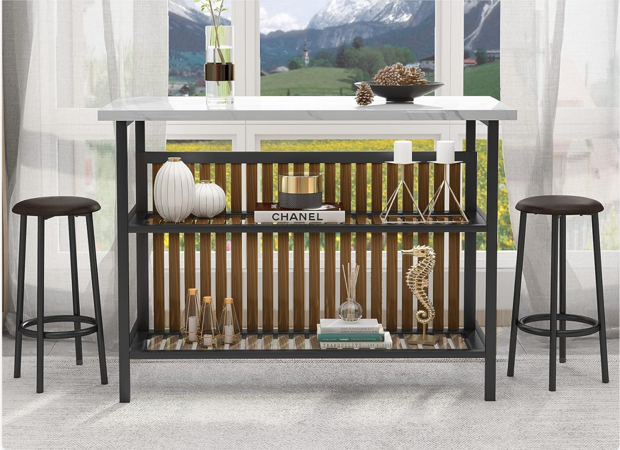
Image: A visual summary of the product's key features, including stable structure, comfortable seating, elegant appearance, versatile uses, and ease of assembly.