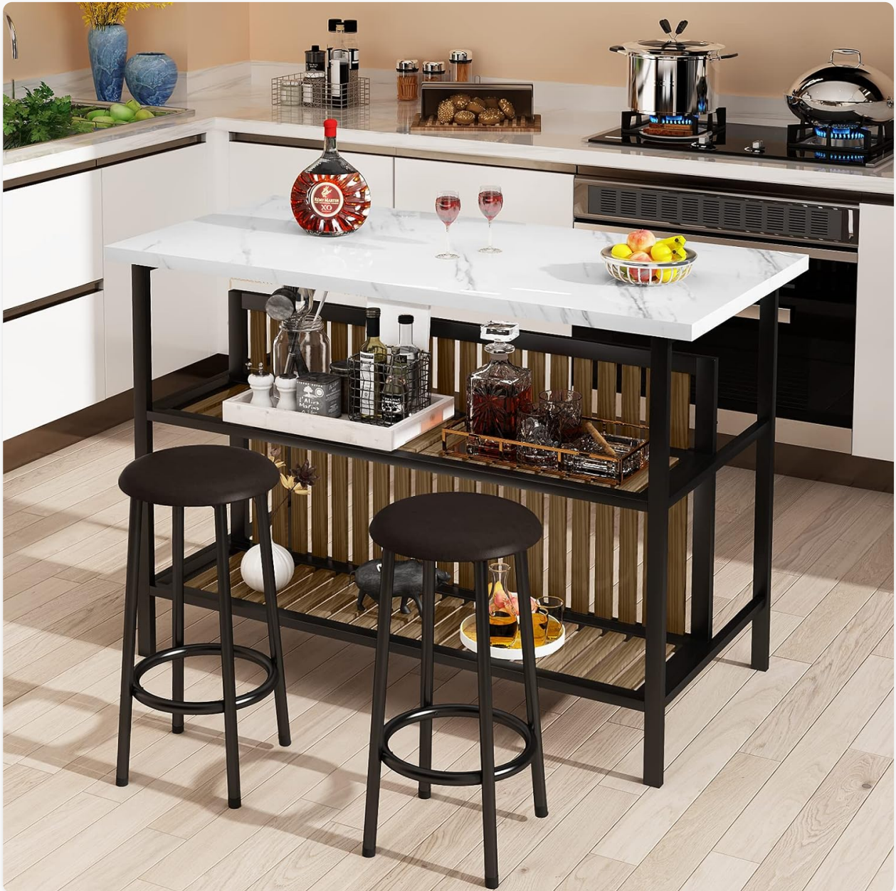
Image: The kitchen island table in a kitchen environment, demonstrating its use with items placed on the storage shelves.

Your browser does not support the video tag.