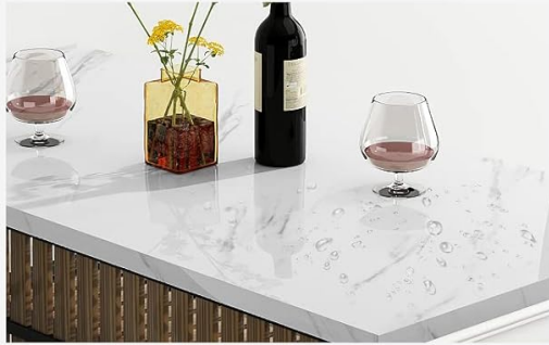
Easy to Clean & Waterproof