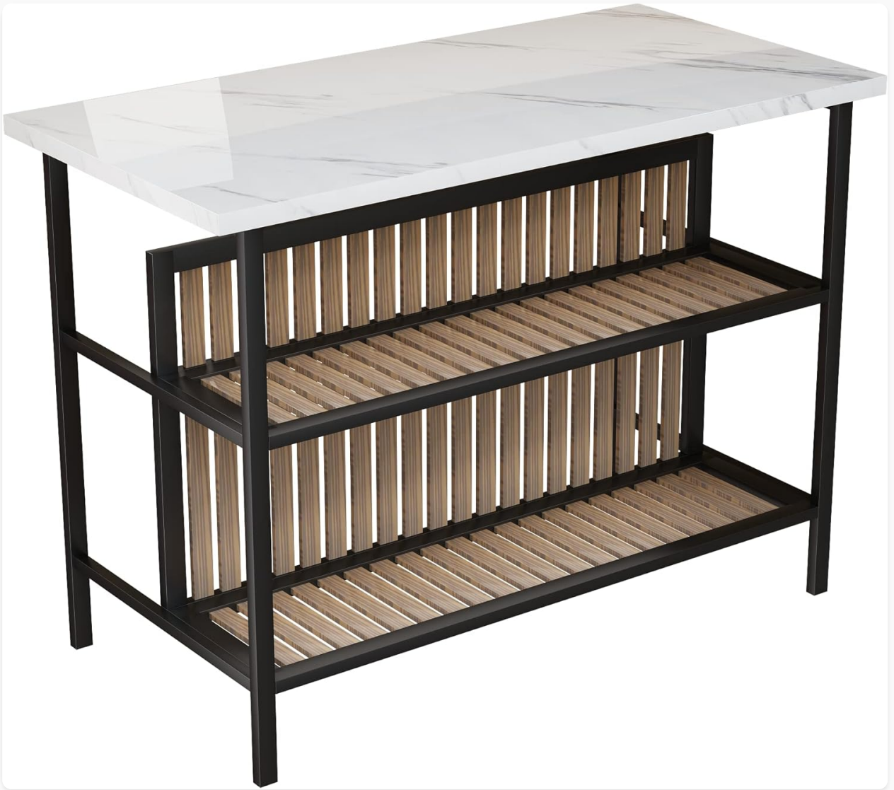
Image: A side view of the kitchen island table, illustrating the two integrated storage shelves.