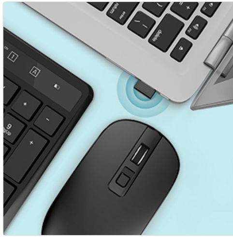
Image: A USB receiver plugged into the side of a laptop, with the wireless mouse positioned nearby, indicating wireless connectivity.