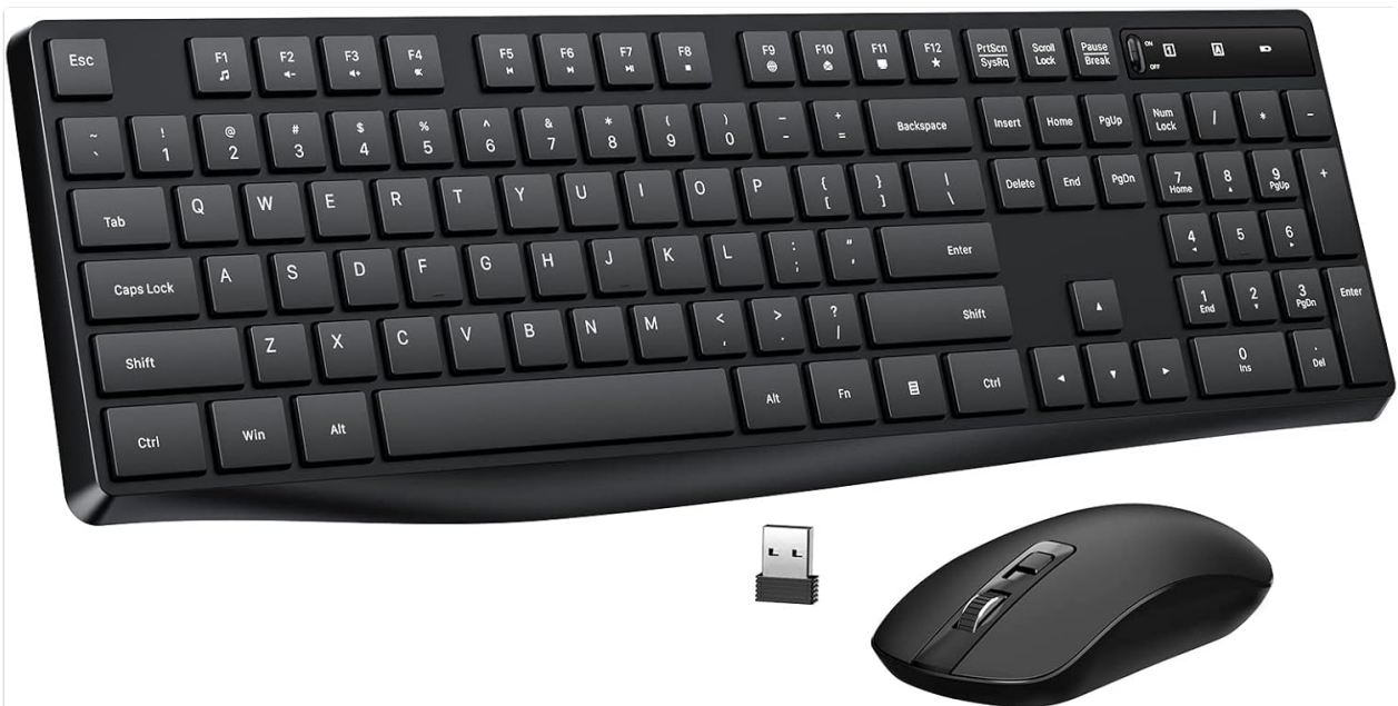
Image: The Lovaky 2.4G Full-Sized Ergonomic Wireless Keyboard and Mouse Combo, featuring a black full-sized keyboard, a black wireless mouse, and a small USB receiver.

Thank you for choosing the Lovaky 2.4G Full-Sized Ergonomic Wireless Keyboard and Mouse Combo. This product is designed to provide a comfortable and efficient computing experience with its wireless connectivity and ergonomic features. This manual will guide you through the setup, operation, and maintenance of your new device.