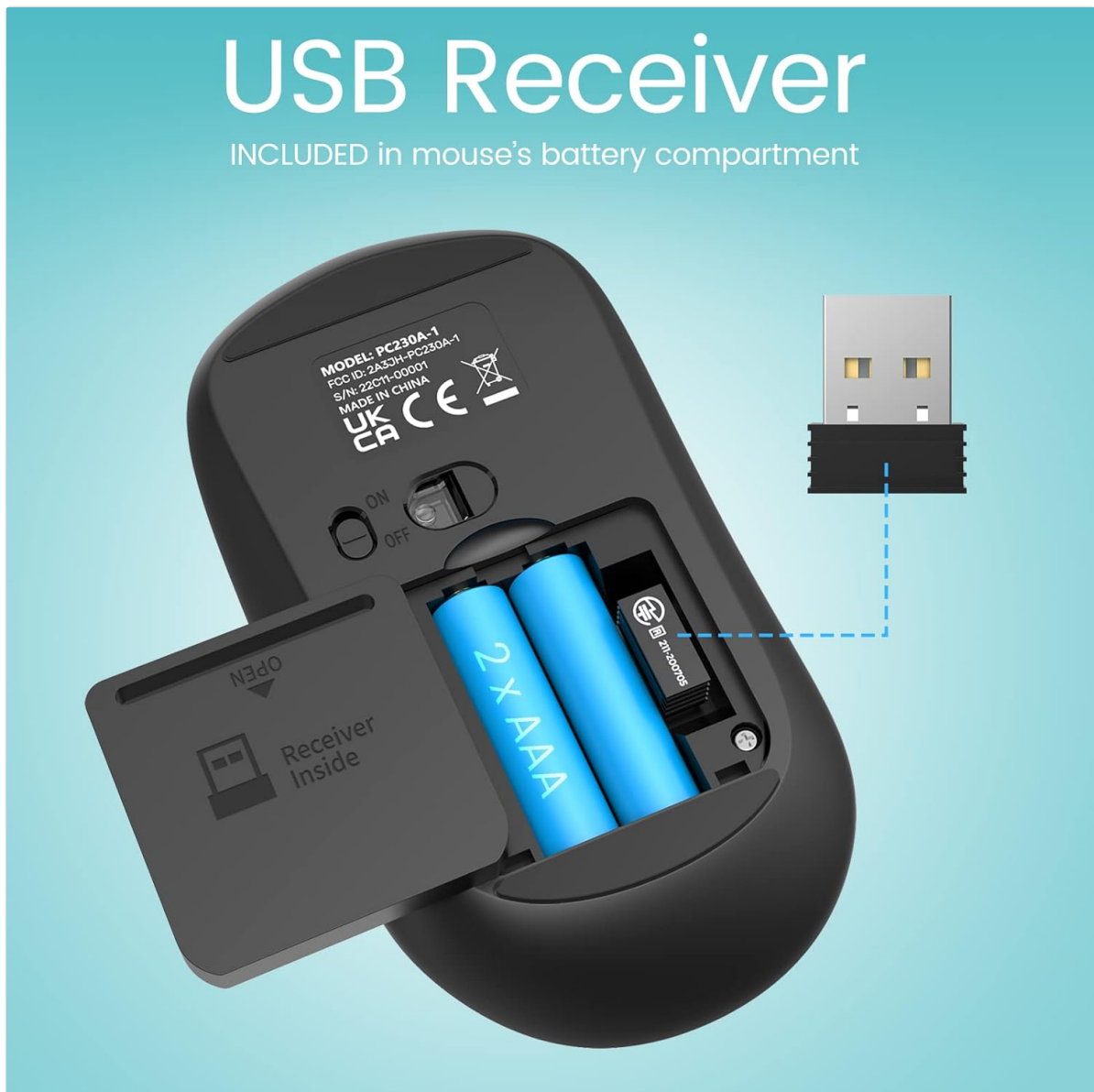
Image: Close-up view of the wireless mouse with its battery cover open, revealing two AAA batteries and the USB receiver stored within the compartment.