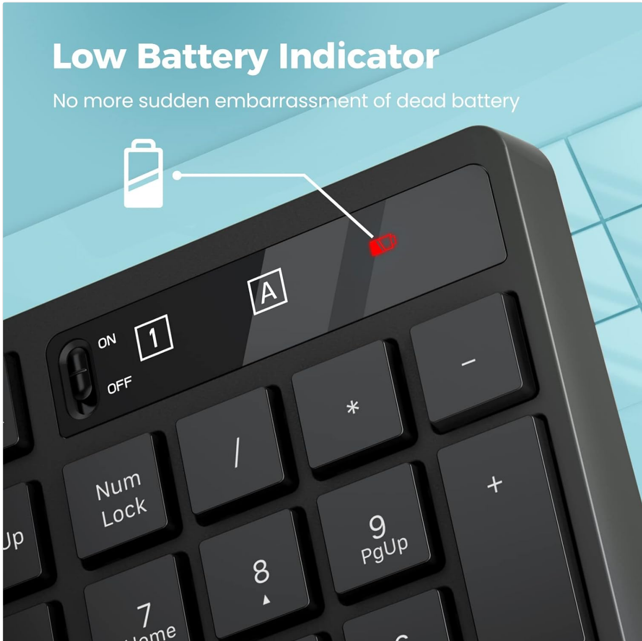
Image: A close-up of the keyboard's upper right section, showing the power switch and a red LED light indicating a low battery status.

When new batteries are inserted and the devices connect normally, the red power light will flash for 5-8 seconds and then turn off. If the computer is not connected, the light may stay on for a moment before turning off. In low battery mode, pressing any key will cause the red power light to flash.