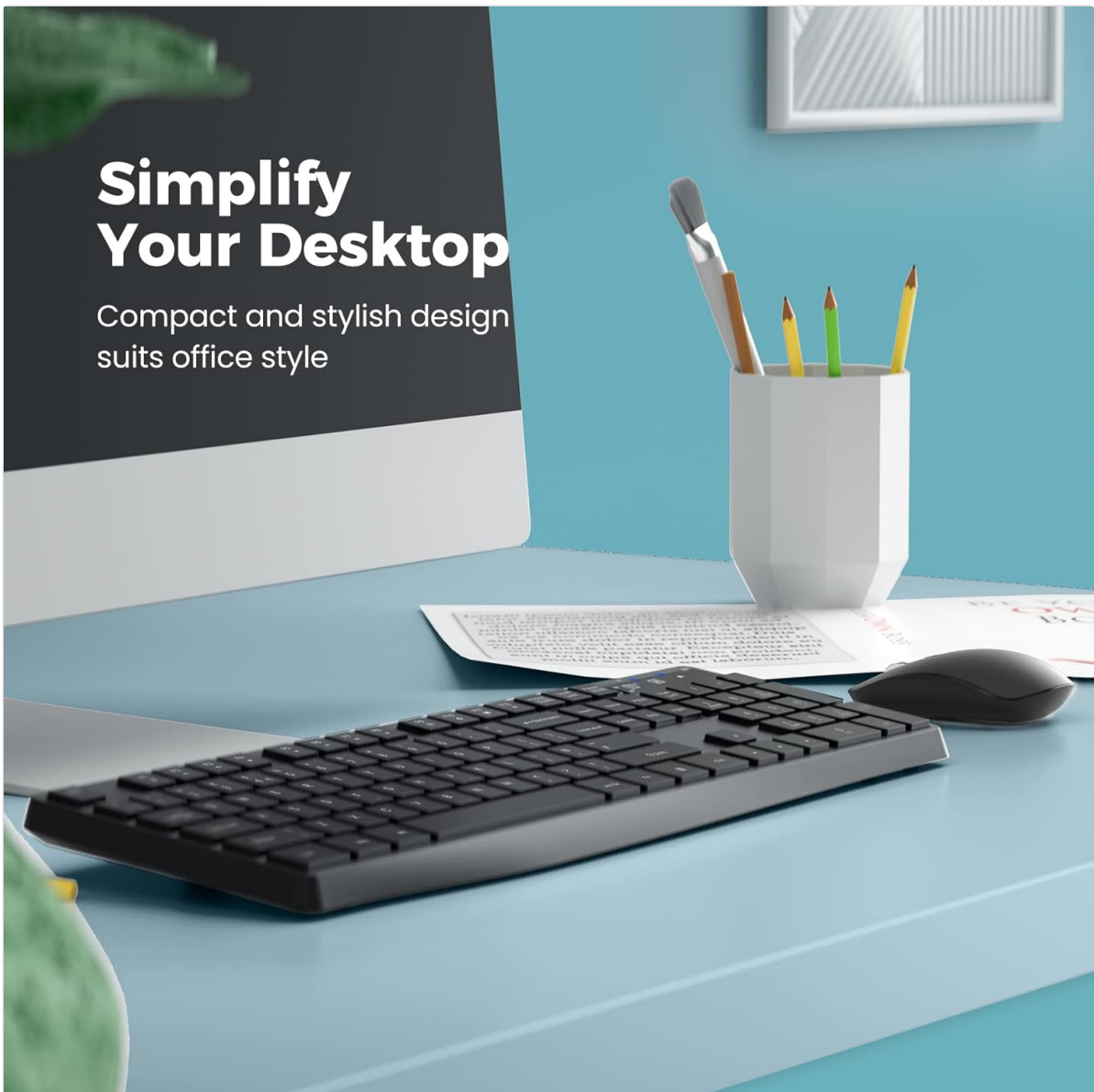
Image: A clean desktop setup featuring the Lovaky wireless keyboard and mouse next to a monitor, illustrating a simplified and organized workspace.

The wireless connection operates on a 2.4G frequency, providing a reliable connection up to 10 meters (33