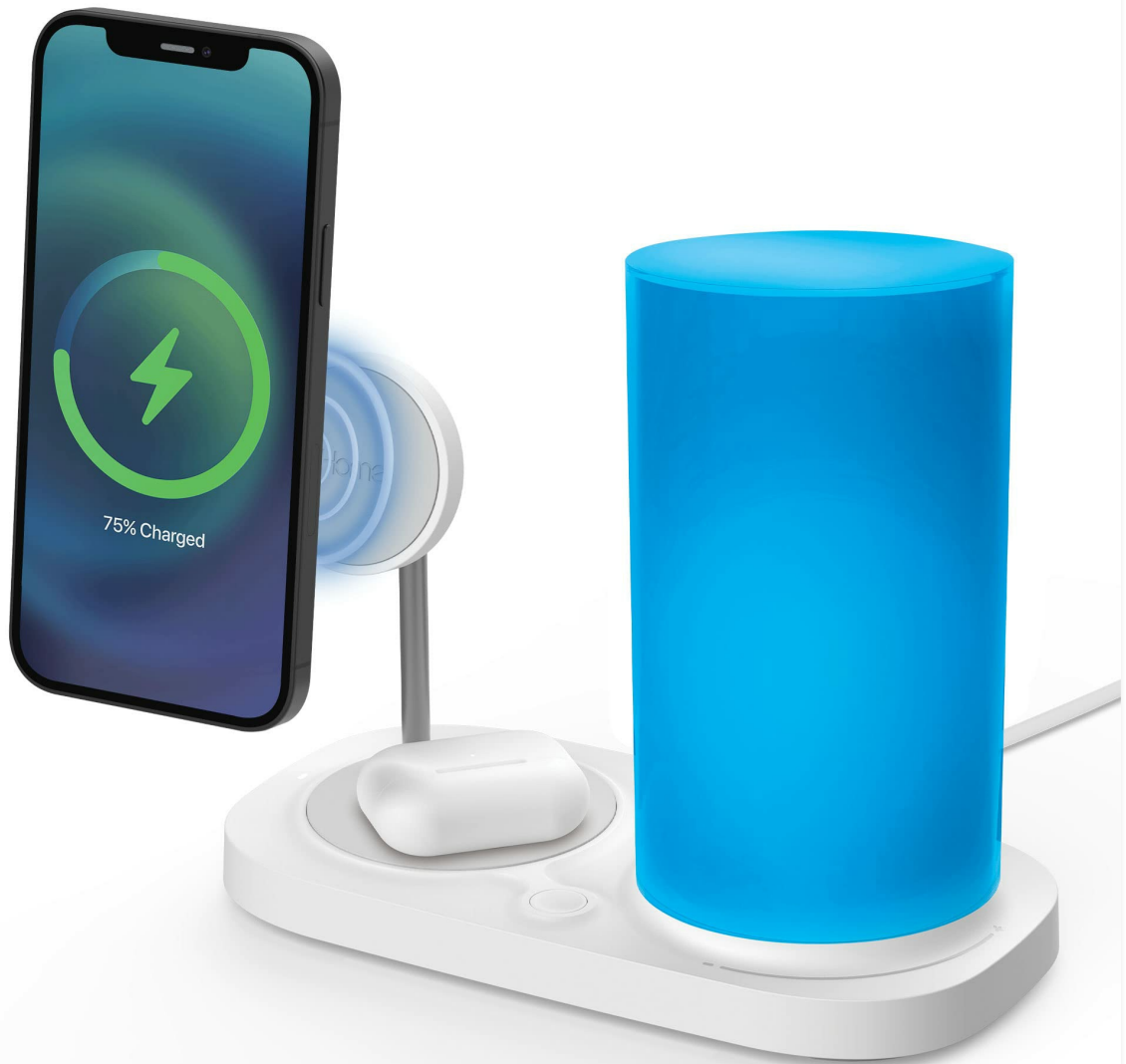
Image: The iHome Magnetic Power Station, a compact device designed to charge multiple Apple devices simultaneously. It features a magnetic stand for an iPhone, a flat charging pad for AirPods, and a color-changing LED lamp.