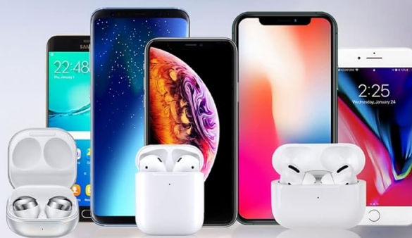
Image: A visual representation of compatible devices, showing various iPhone 12 and 13 models for the magnetic charger, and a selection of Qi-enabled phones and AirPods for the wireless charging pad.