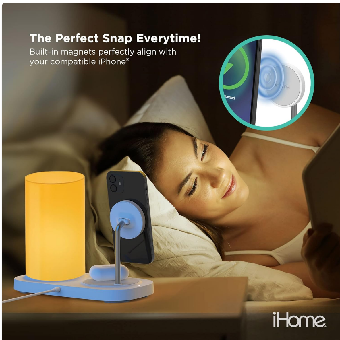
Image: An iPhone is shown magnetically attached to the charging stand, illustrating the "Perfect Snap" feature for secure and efficient charging.