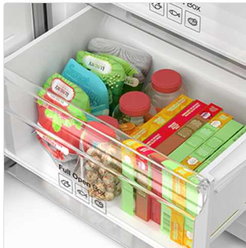
Image: A clear view of the Full Open Box freezer drawer, demonstrating its capacity and ease of access for frozen goods.

The refrigerator is equipped with tempered glass shelves and multiple drawers, including a Full Open Box in the freezer, designed for optimal organization and easy access to your food items. Adjust shelves as needed to accommodate different heights of containers. The door shelves provide convenient storage for bottles and smaller items.