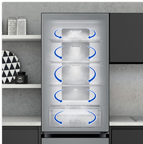
Image: Visual representation of the All Around Cooling system, depicting air circulation paths within the refrigerator compartment.

The All Around Cooling system ensures that every item on every shelf and in every drawer is cooled evenly. It constantly monitors the temperature and circulates cool air through strategically placed vents. This maintains a consistent temperature throughout the cabinet, helping food stay fresher for longer.