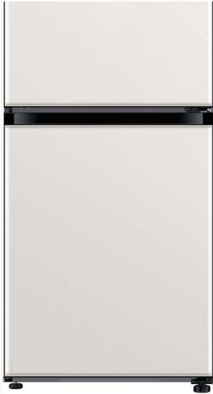
Image: Front view of the Samsung Bespoke Refrigerator, showcasing its sleek design and the 20-year warranty badge on the upper door.