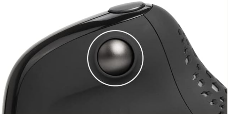
Image 3.2: Detail showing the normal scroll wheel for vertical navigation and the thumb wheel for horizontal navigation.