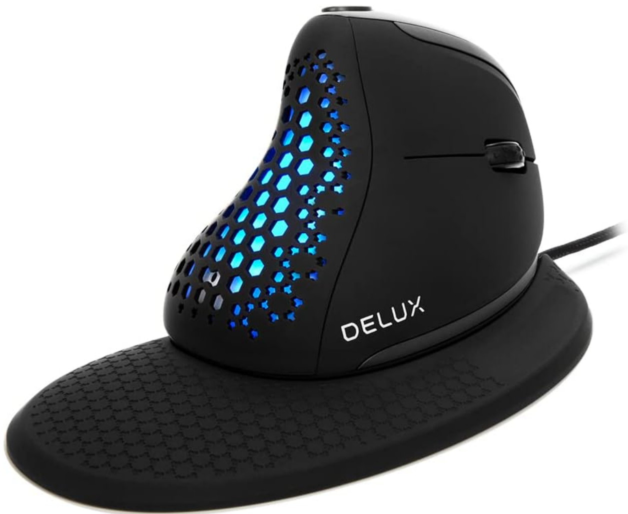
Image 3.1: Front-side view of the DeLUX Seeker M618XSU mouse with its ergonomic vertical design and RGB lighting.

Familiarize yourself with the various parts of your DeLUX Seeker M618XSU mouse.