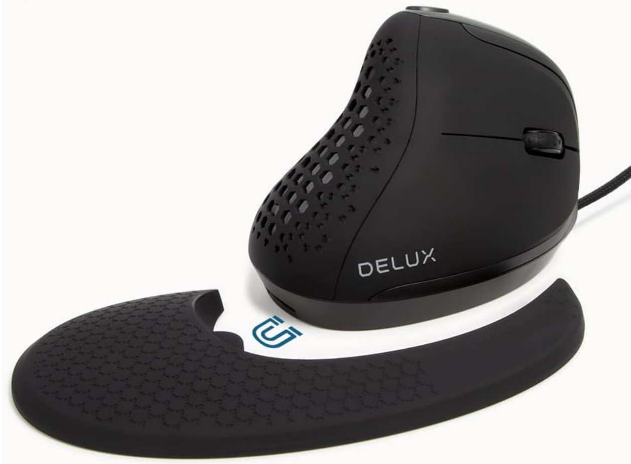
Image 4.1: The DeLUX Seeker M618XSU mouse with its magnetic detachable wrist rest, designed to support the forearm and wrist.