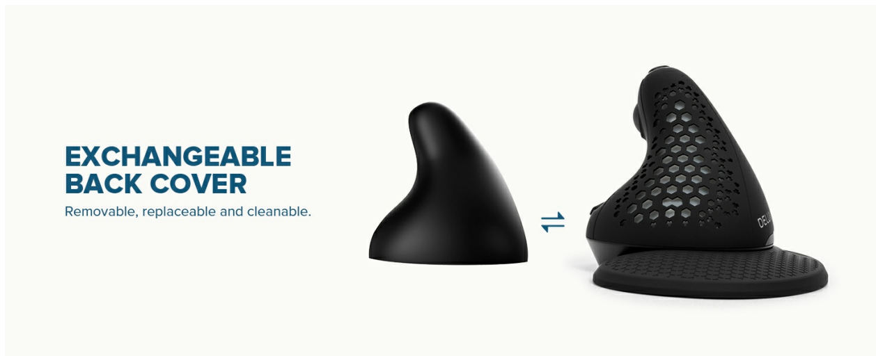
Image 8.1: The DeLUX Seeker M618XSU mouse demonstrating its exchangeable back cover, which includes the wrist rest component, allowing for easy removal and cleaning.

The magnetic wrist rest is removable, replaceable, and cleanable. You can detach it for easier cleaning or replacement if needed.