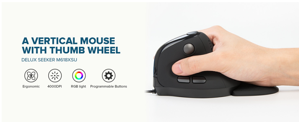
Image 1.1: The DeLUX Seeker M618XSU vertical mouse, highlighting its ergonomic design and thumb wheel feature.

The DeLUX Seeker M618XSU is a wired ergonomic vertical mouse designed to provide a comfortable and natural hand position, reducing wrist strain often associated with traditional mice. This manual provides detailed instructions for setting up, operating, maintaining, and troubleshooting your new mouse. Key features include a unique vertical design, a thumb wheel for horizontal scrolling, adjustable DPI settings, RGB backlighting, and a magnetic detachable wrist rest.