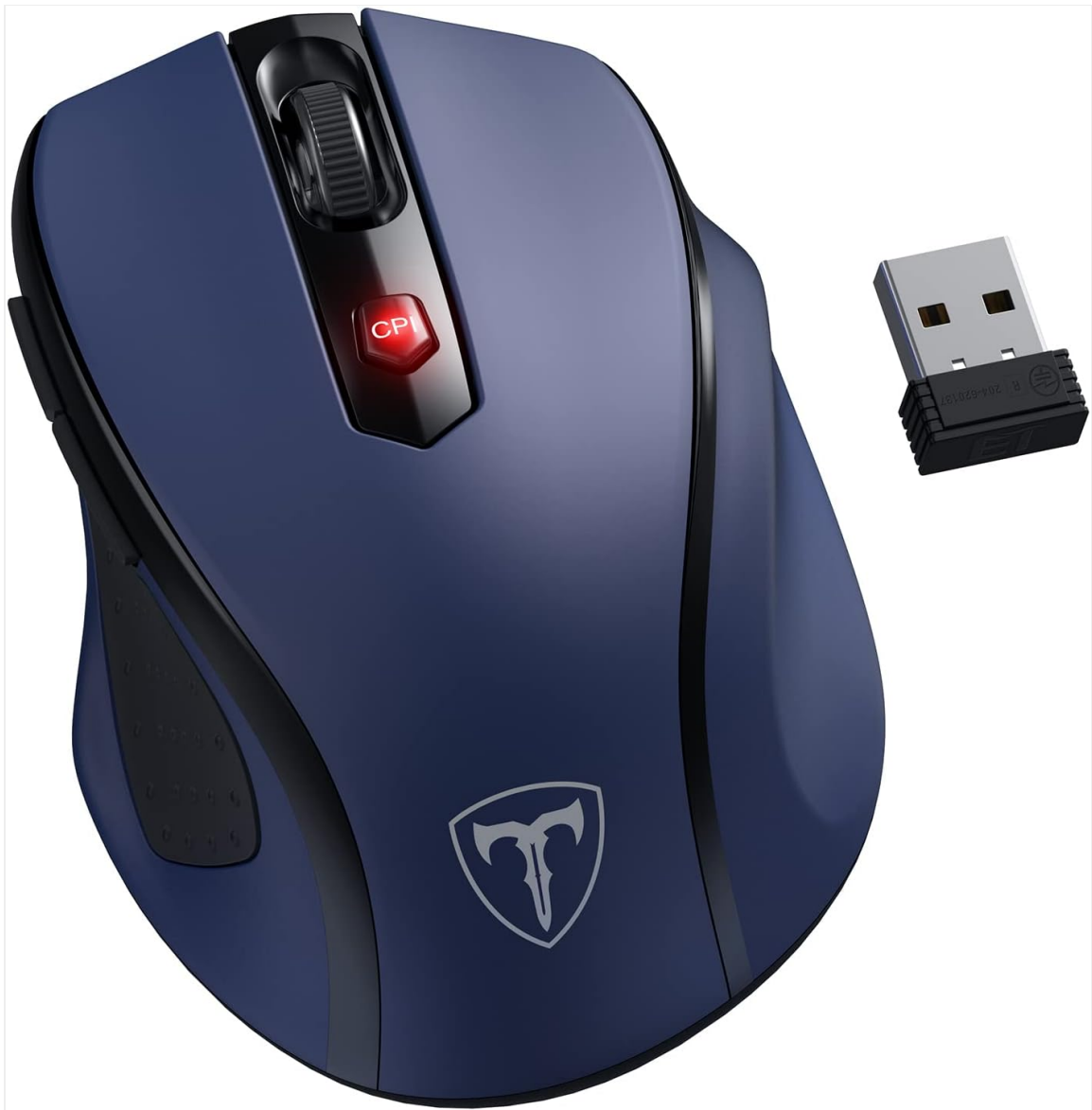
Image: The D-09 Wireless Mouse in Sapphire Blue, shown alongside its compact USB receiver.