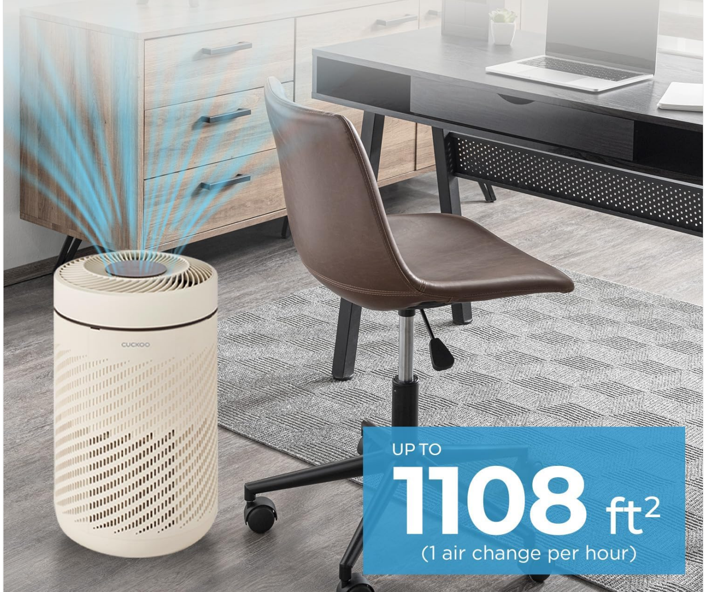
Figure 5: Ideal Placement in a Home Office

Up to 231 ft 2 of AHAM Verified Coverage