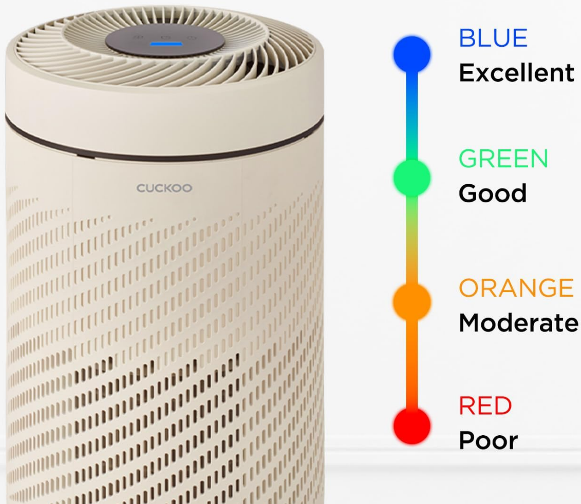
Figure 7: LED Air Quality Display

Monitors air quality throughout the day, automatically adjusting purification to the required level.