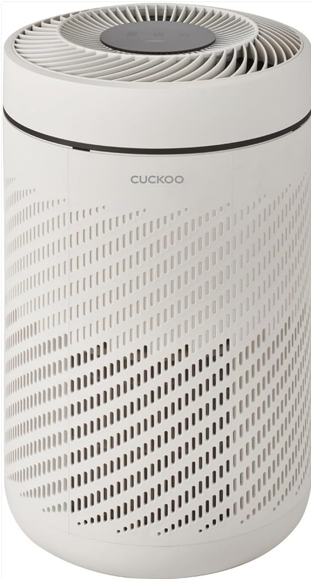
Figure 1: CUCKOO True HEPA Air Purifier (Model CAC-AB0610FI)