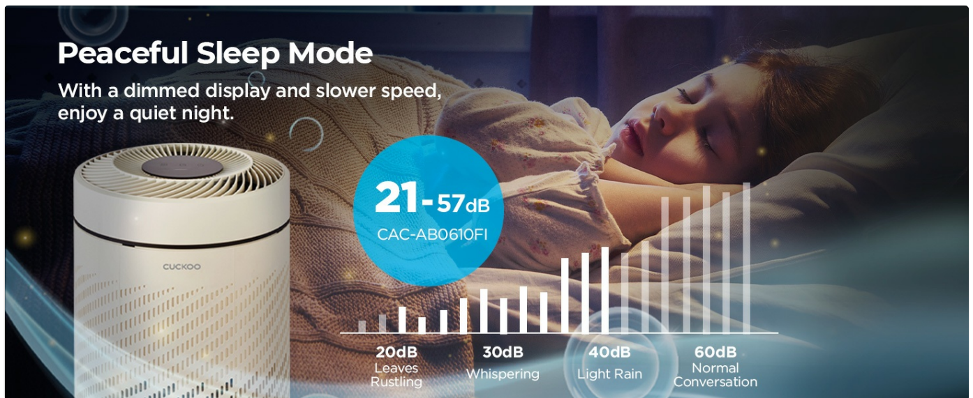
Figure 6: Peaceful Sleep Mode