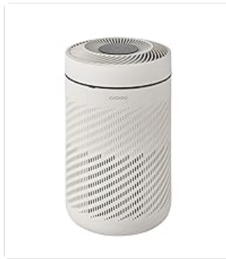
Figure 4: H13 True HEPA Filter