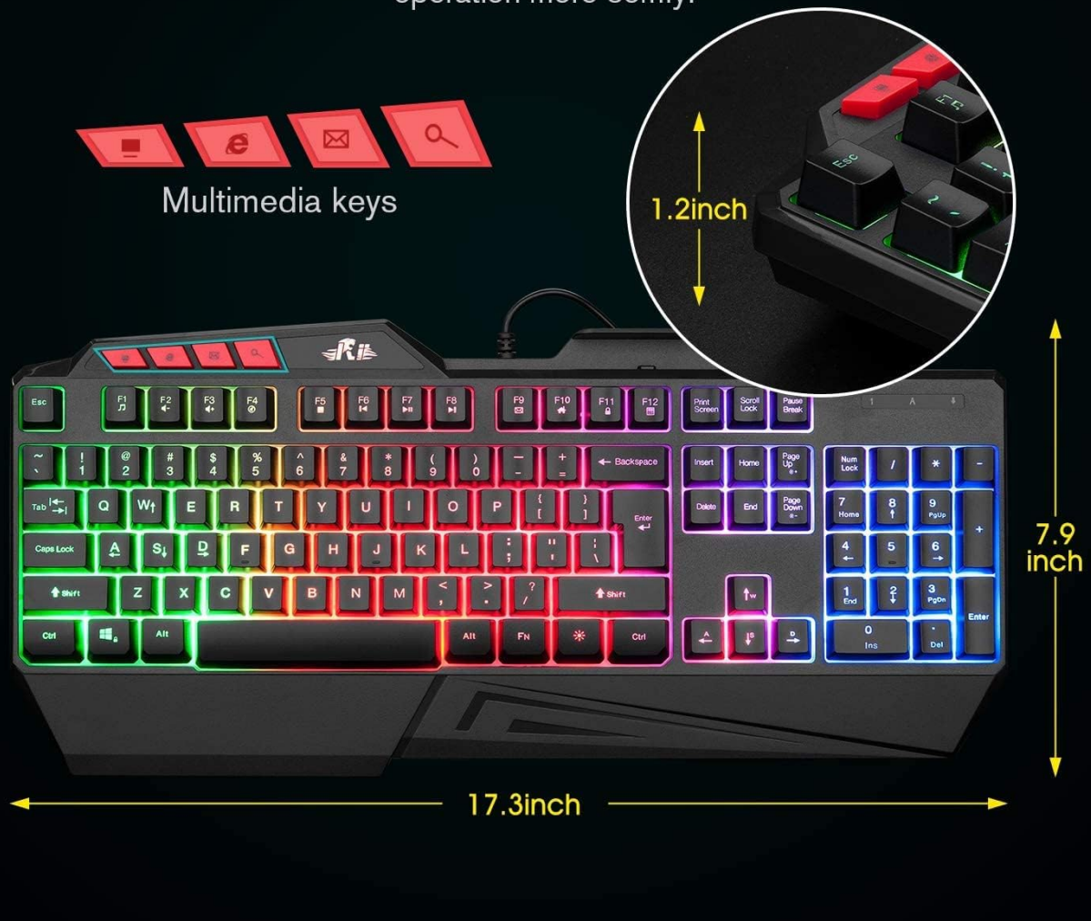
Figure 6: Detailed dimensions of the Rii RK202 keyboard, illustrating its compact yet full-sized design.

Anti-fingerprint matte surface with texture, making key operation more comfy.