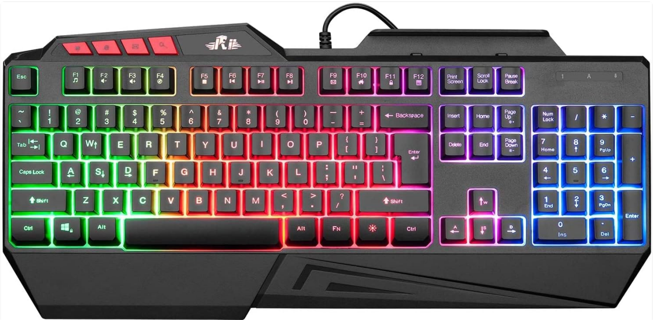
Figure 1: The Rii RK202 RGB Gaming Keyboard, showcasing its full layout and vibrant backlighting, ready for connection.