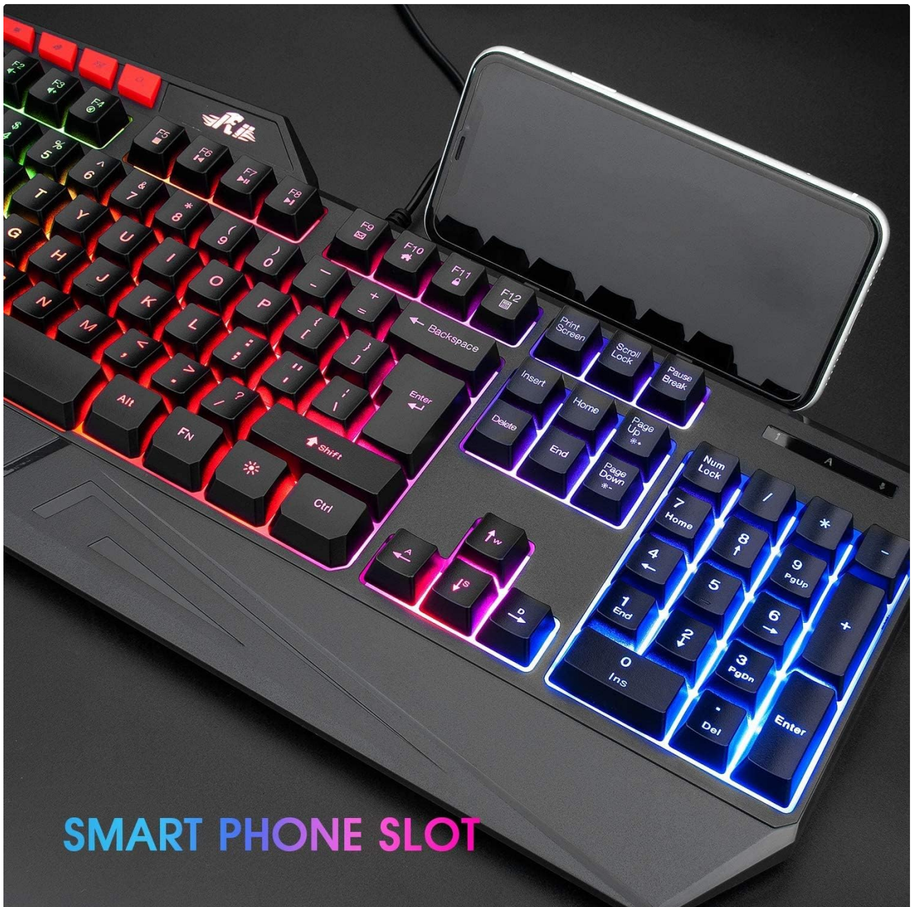
Figure 5: The integrated smart phone slot, providing a convenient place to rest your device while using the keyboard.