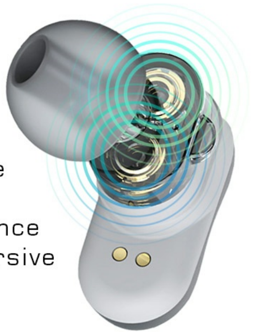
Image: An exploded diagram of an earbud highlighting the two 6mm professional speakers, illustrating the dual-driver technology.

With two 6mm professional speakers in each earbud, the Dual Driver delivers incredible heavy bass, clear mids/highs, and prestige treble performance to achieve a beautifully immersive listening experience.