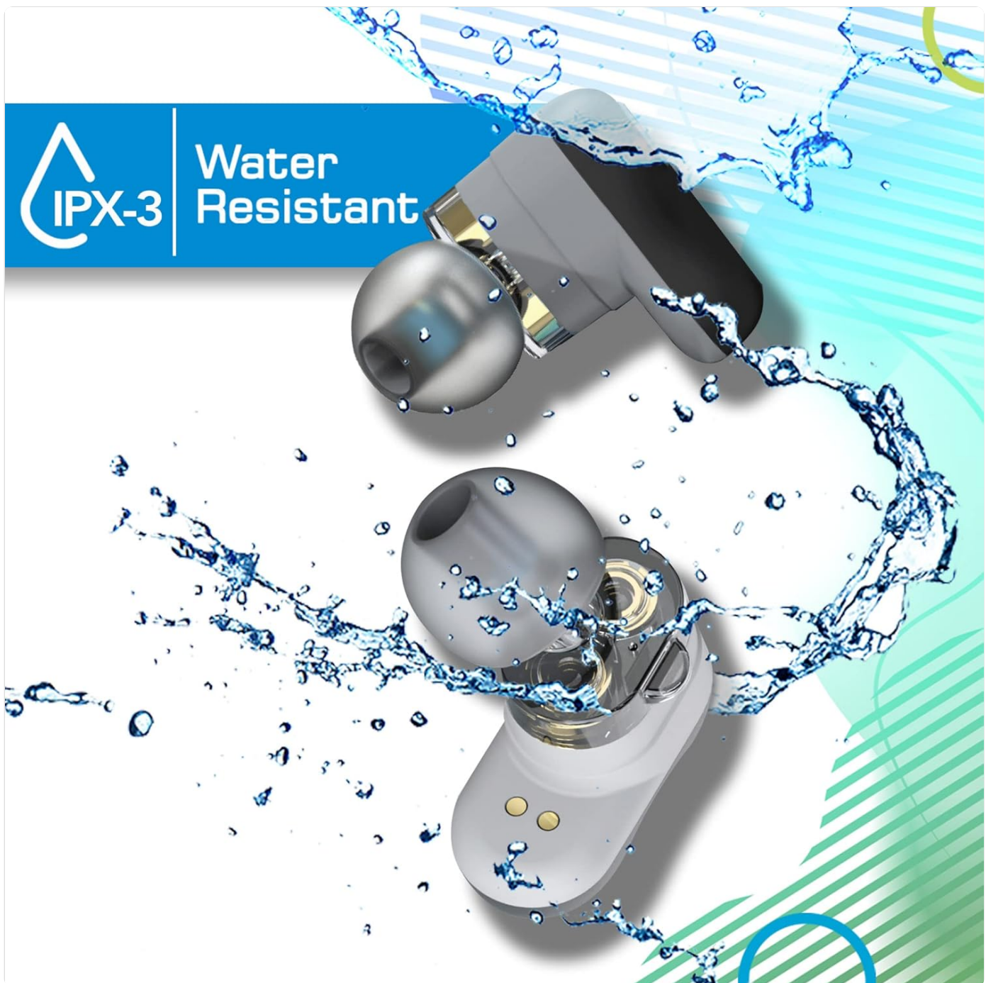
Image: Earbuds shown with water droplets, illustrating their IPX3 water-resistant capability.