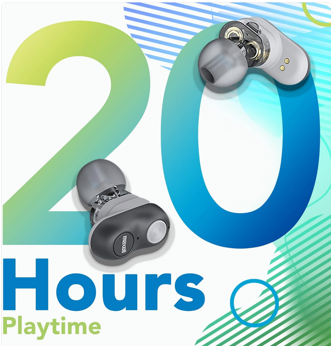
Image: A visual representation indicating "20 Hours Playtime" with the earbuds and charging case.