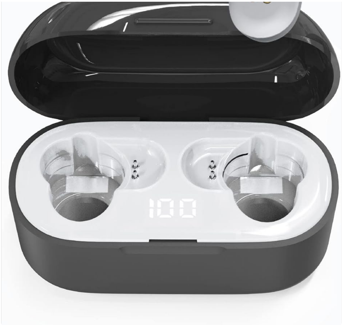
Image: Maxell 199652 True Wireless Earbuds, showing both earbuds and the open charging case with a digital battery indicator.