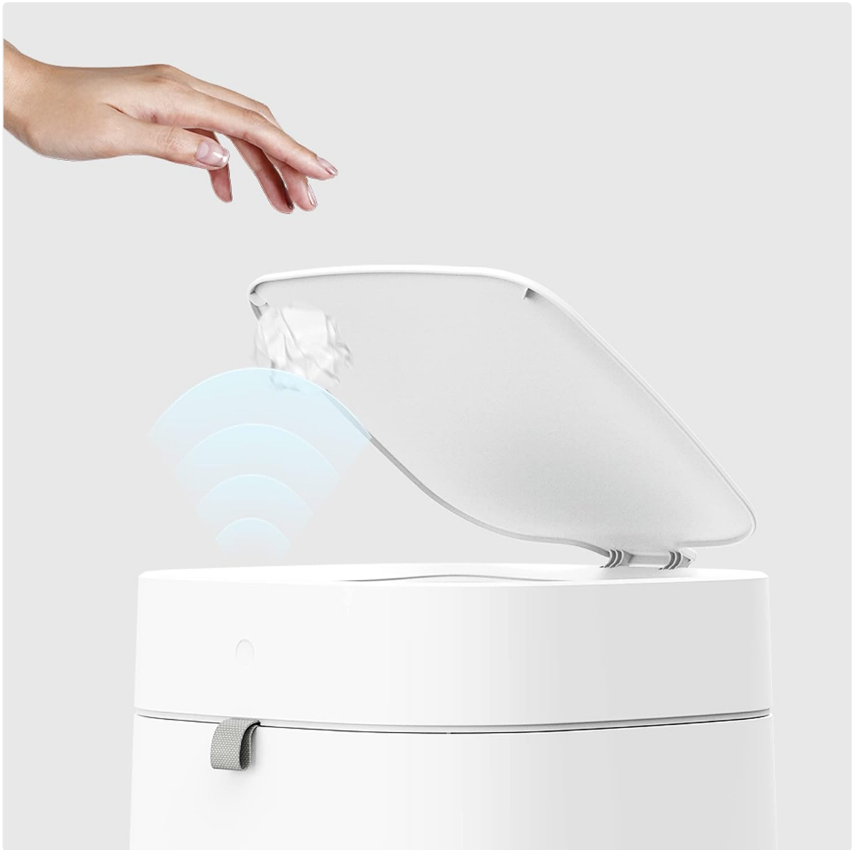
Image 6.2: A hand activating the motion sensor to open the lid of the smart trash can.