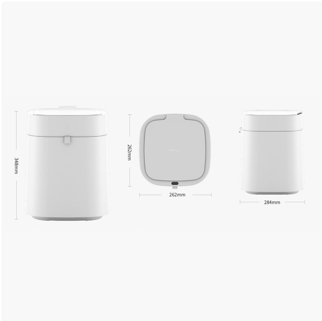
Image 4.1: Front, top, and side views of the TOWNEW T Air X Smart Trash Can with dimensions (e.g., 348mm height, 262mm width).