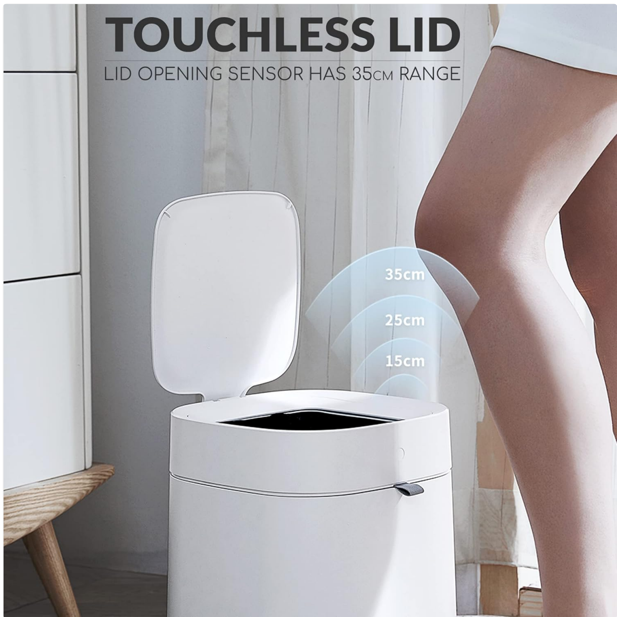
Image 6.1: Demonstration of the touchless lid opening mechanism, showing the sensor range (15cm, 25cm, 35cm).