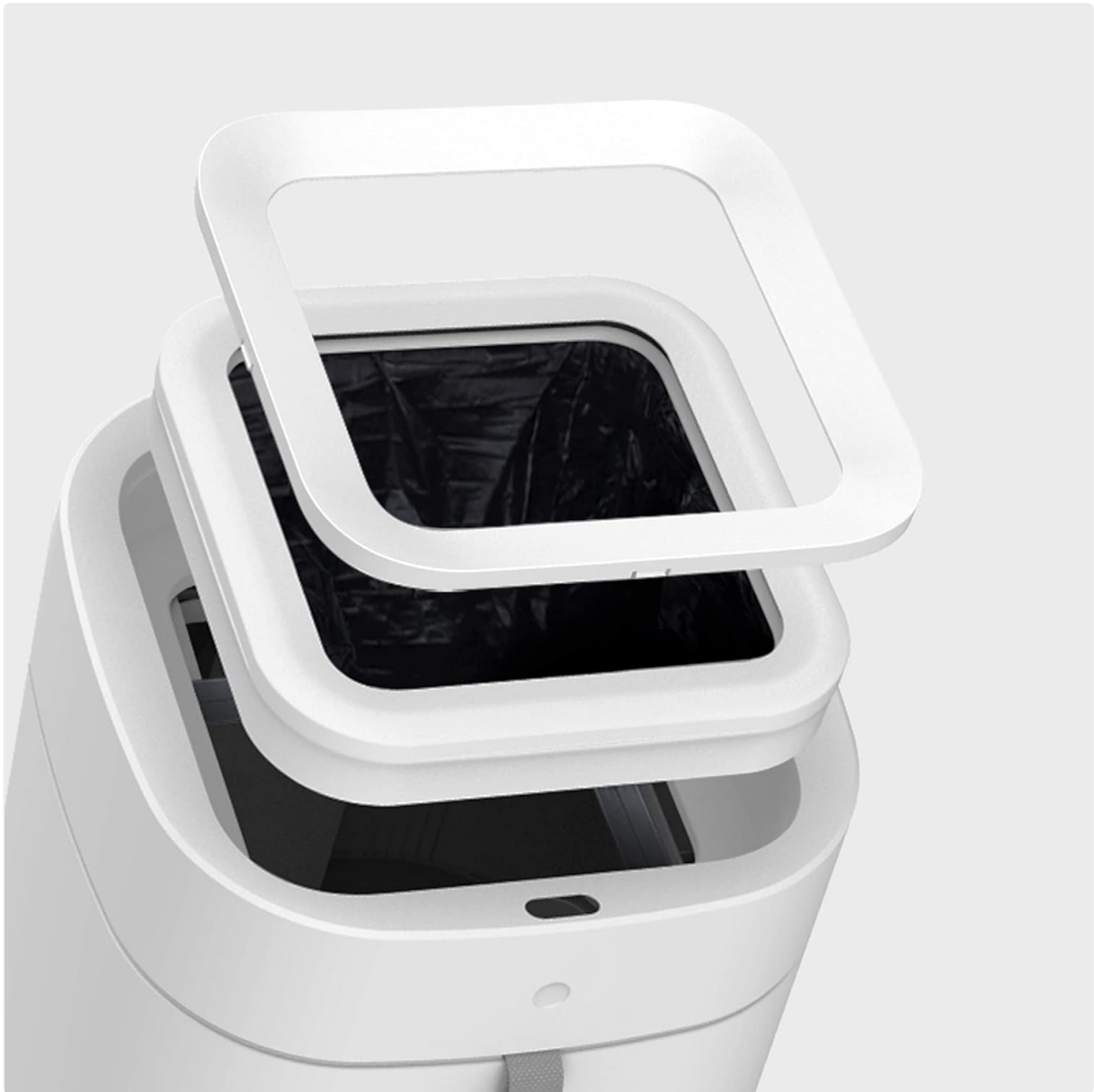
Image 5.2: Illustration of how to install the trash bag ring into the TOWNEW T Air X Smart Trash Can.