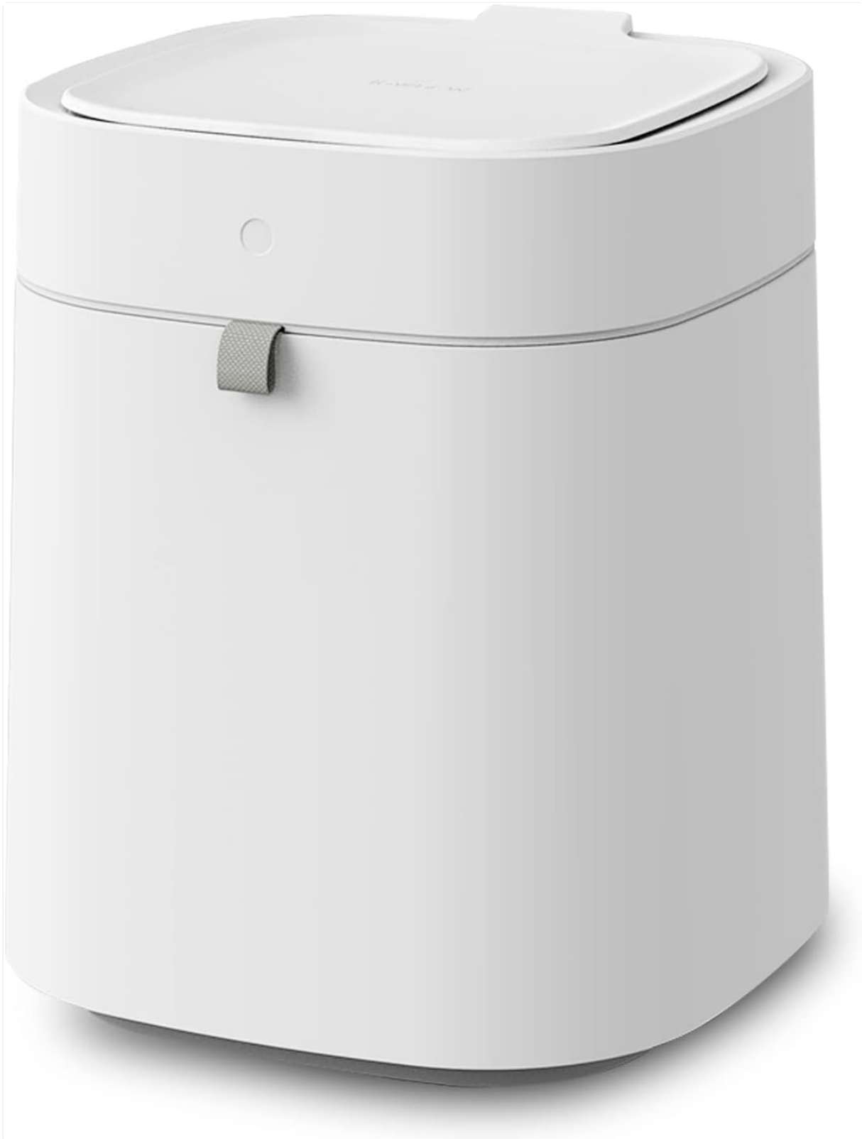
Image 3.1: The TOWNEW T Air X Smart Trash Can, typically included with a Micro USB cable and a trash bag ring.