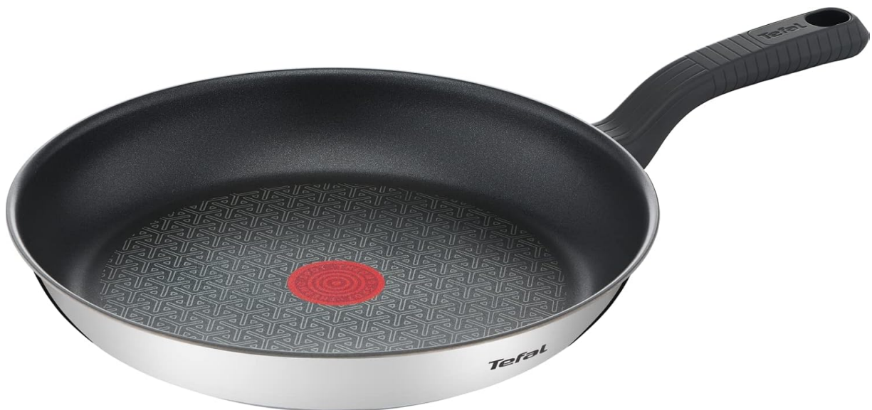
Image: The Tefal Comfort Max 26cm Stainless Steel Frying Pan, showcasing its non-stick interior and stainless steel exterior.

The Tefal Comfort Max 26cm Stainless Steel Frying Pan is designed for efficient and comfortable cooking. It features a durable non-stick coating, a Thermo-Spot heat indicator, and an induction-compatible base. This manual provides essential information for the proper use and care of your frying pan to ensure long-lasting performance.