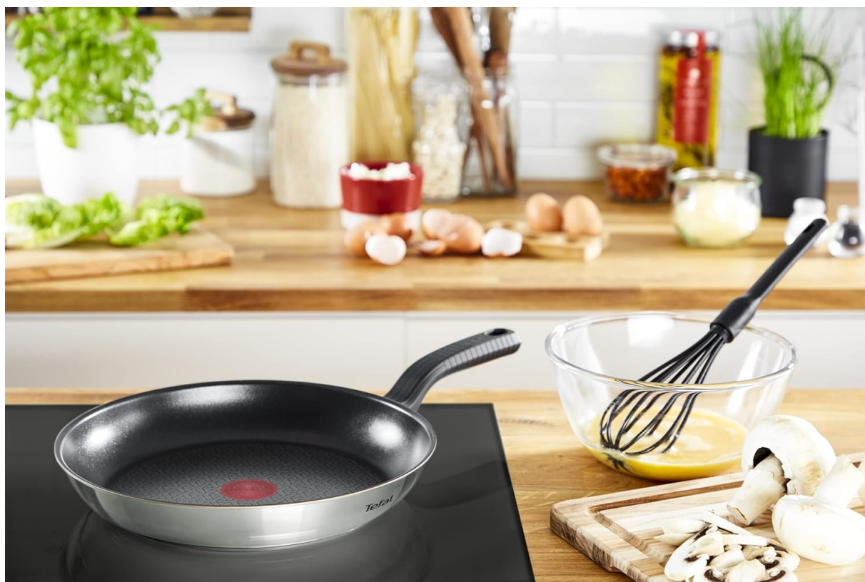
Image: The frying pan positioned on an induction cooktop, ready for cooking, with a bowl of whisked eggs and sliced mushrooms nearby.