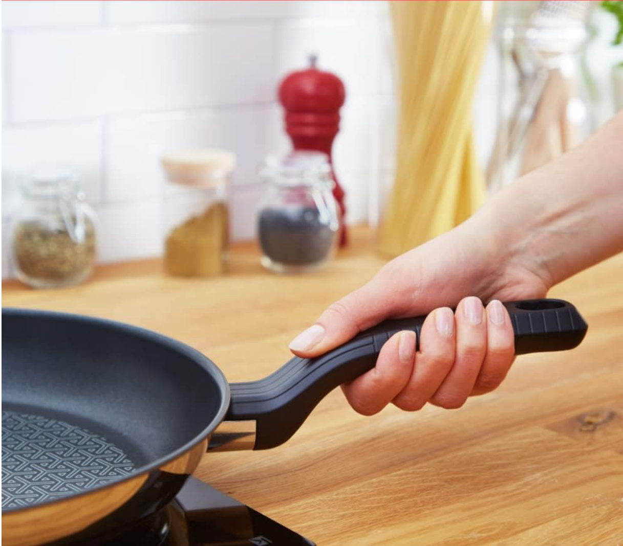
Image: A hand demonstrating the comfortable and secure grip on the cool-touch handle of the frying pan.