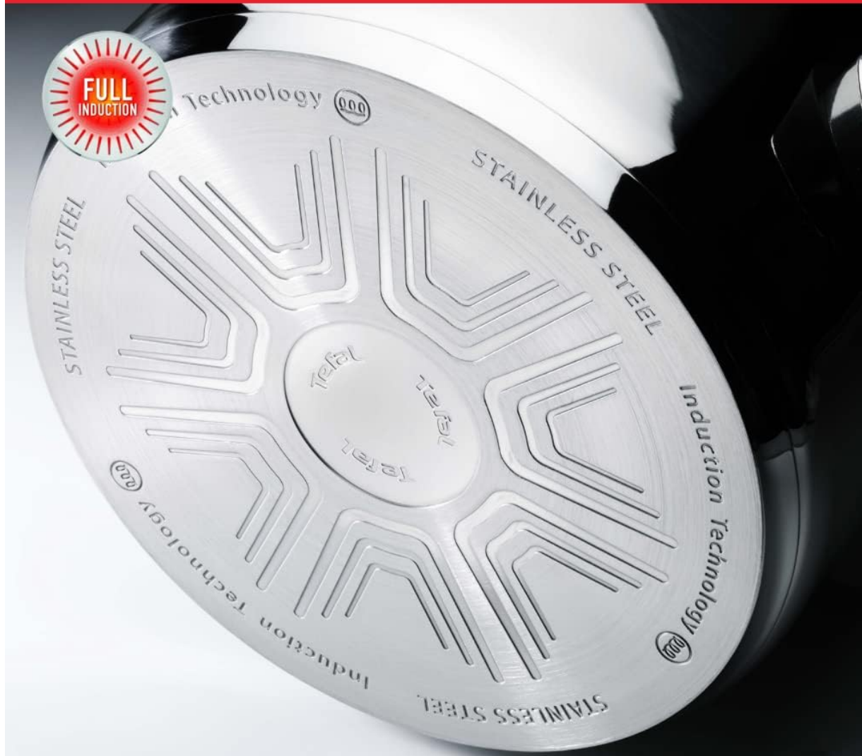
Image: A close-up view of the pan's thick, full induction-compatible base, designed for fast and even cooking.