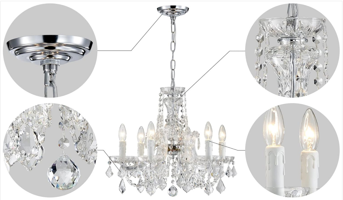
Image: All chandelier components laid out, including the ceiling canopy, chain, main body, bulb sockets, and various crystal elements.