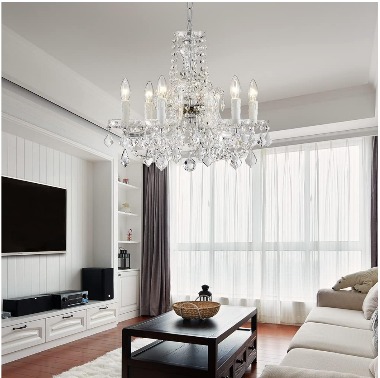
Image: The AGV LIGHTING Chandelier fully installed and illuminated in a modern living room setting.