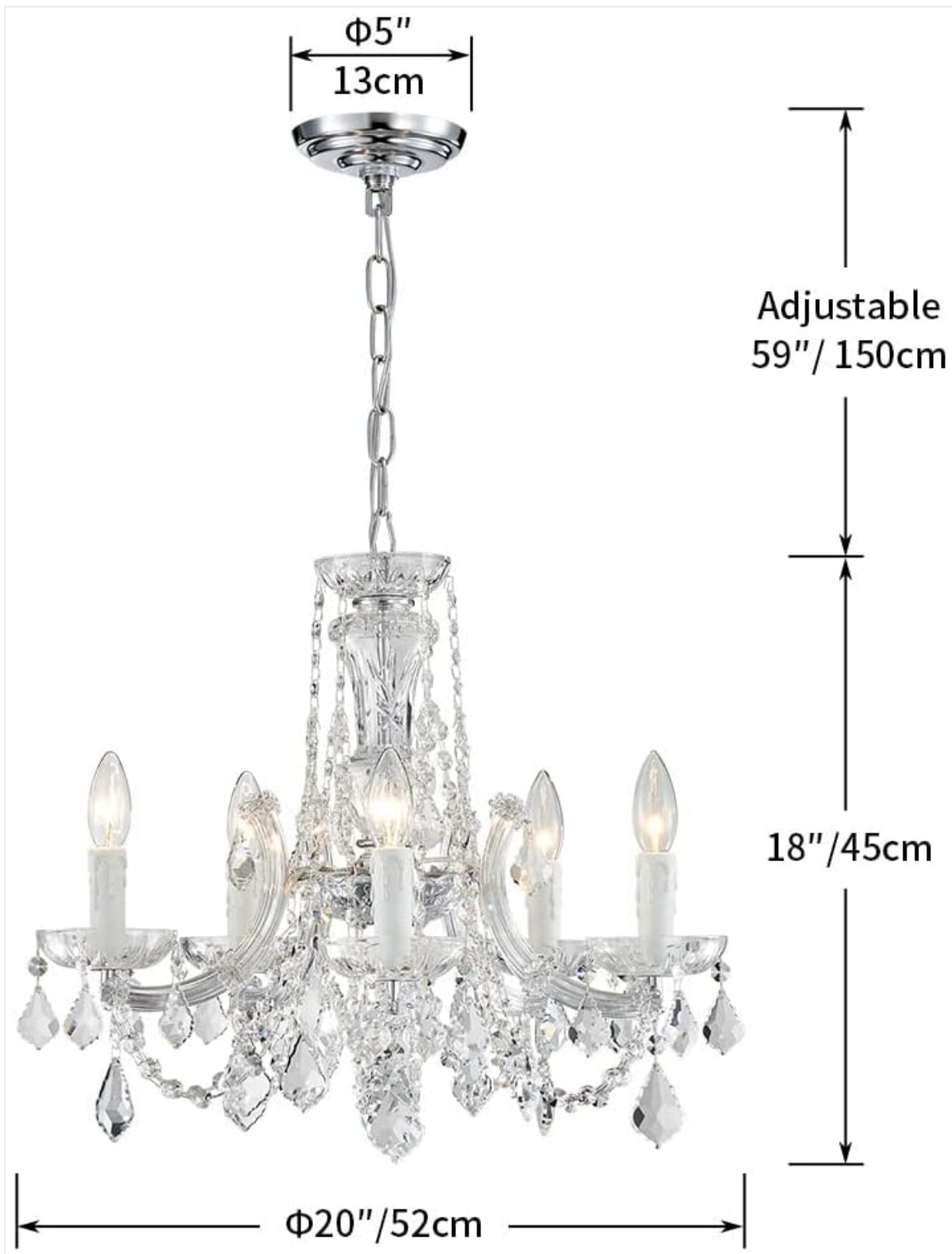
Image: Dimensional diagram of the chandelier, indicating a diameter of 20 inches (52 cm), a fixture height of 18 inches (45 cm), and an adjustable chain length up to 59 inches (150 cm).