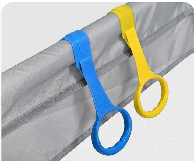
2 Pull Rings for Assisting Child Stand Up