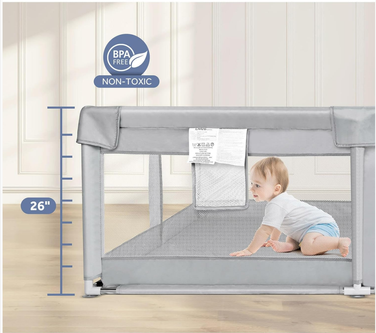
Figure 6: Scientific Height. The playpen's 26-inch (65.5 cm) height is designed to be a safe barrier, preventing children from climbing out.