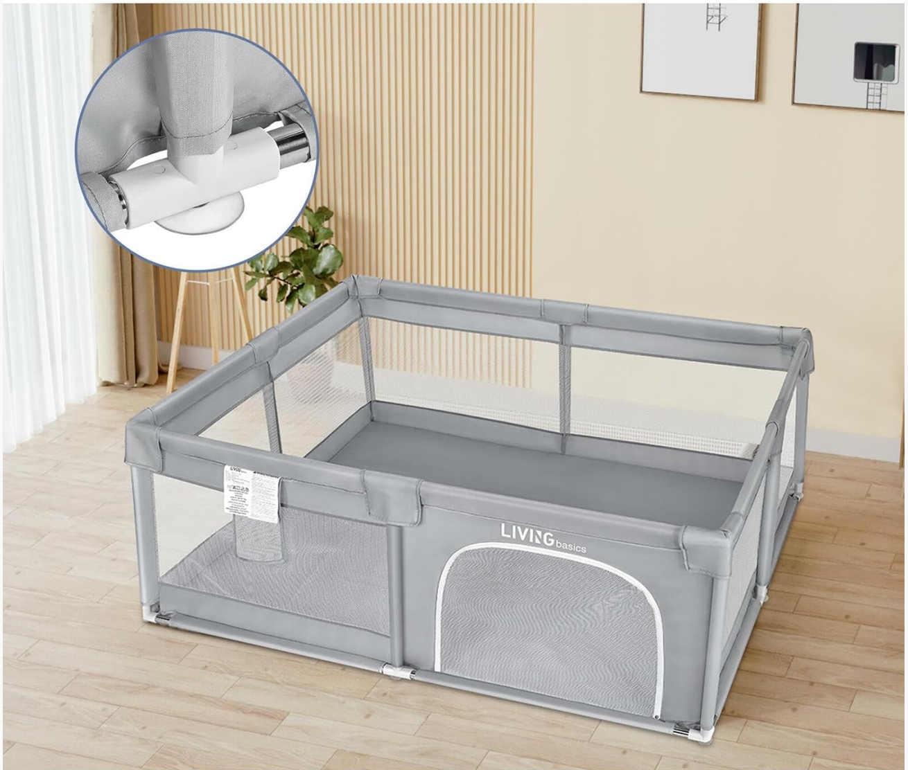
Figure 3: Strong Suction Cup. The base of the playpen is equipped with suction cups to firmly attach to the floor, enhancing stability and preventing overturning.

STEEL PIPE STRUCTURE, STABLE AND UNBREAKABLE