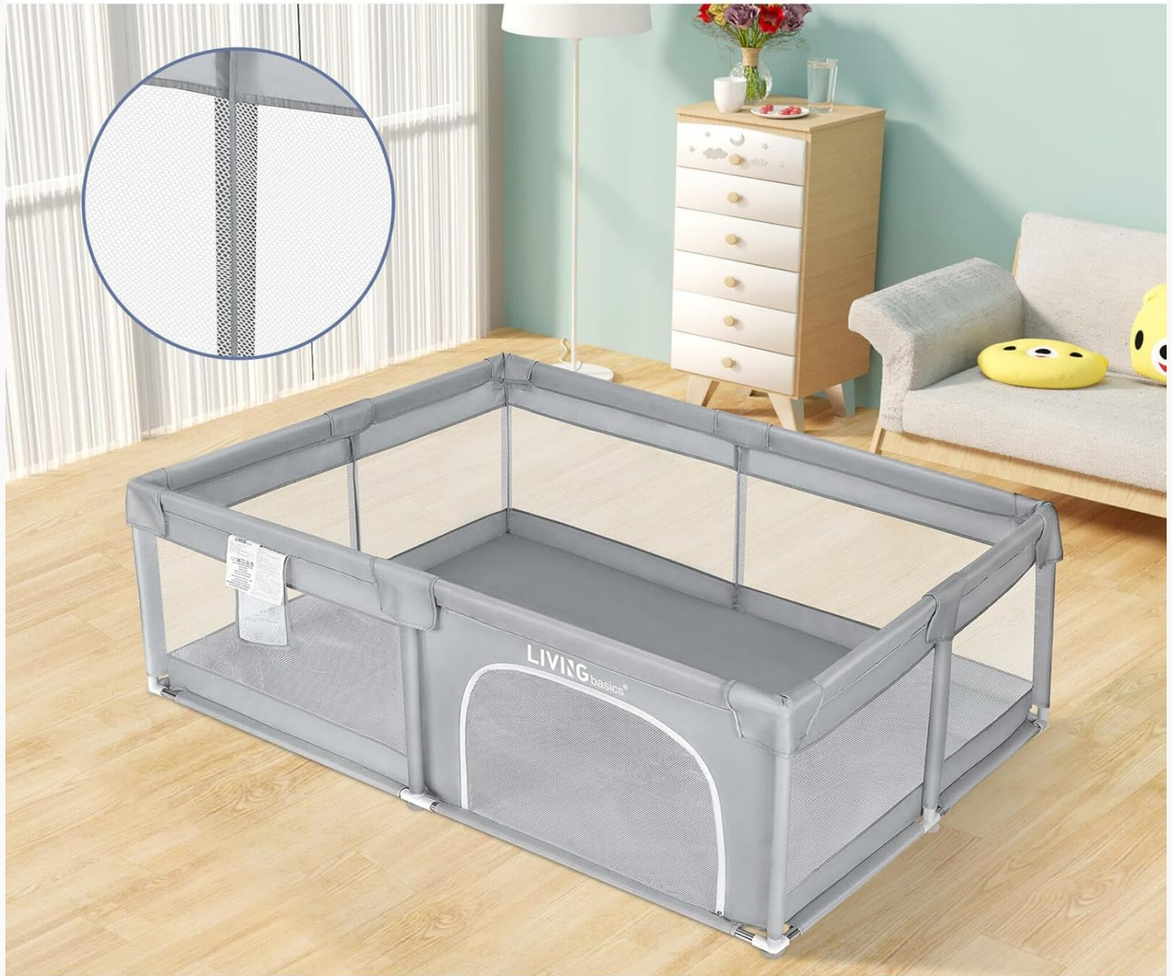
Figure 2: Side Zipper Door. The playpen features a smooth zippered door for easy access for children to crawl in and out.

SO BABIES CAN SEE THEIR MOTHER FROM DIFFERENT SIDES BEHIND THE FENCE