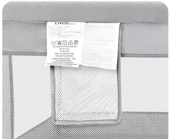
Toy Storage Bag