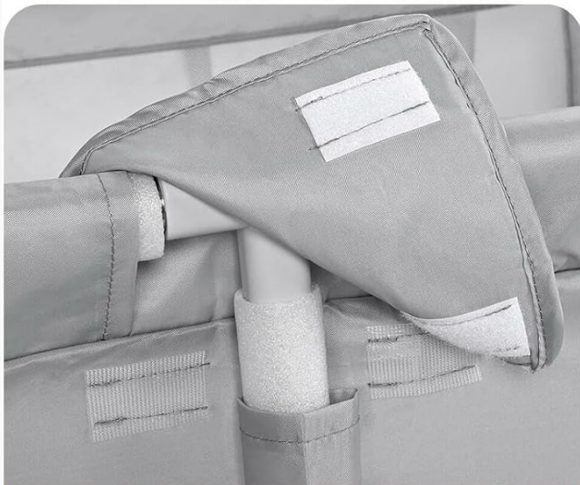
Thickened Anti-collision cotton at the Connection