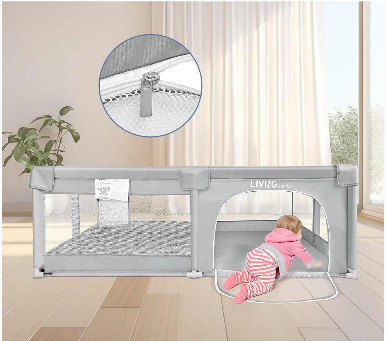
Figure 5: 360 Visibility. The transparent mesh sides allow for full visibility of the child inside the playpen from any angle.