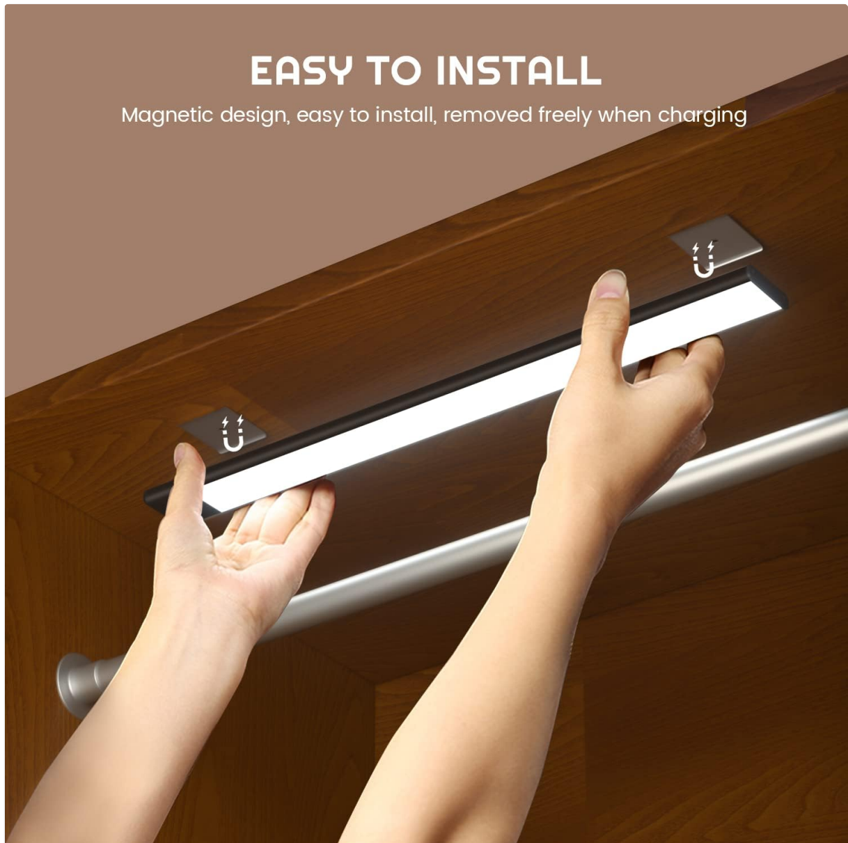
Image: Magnetic installation of the Yeelight Closet Light. The light can be easily removed for charging.