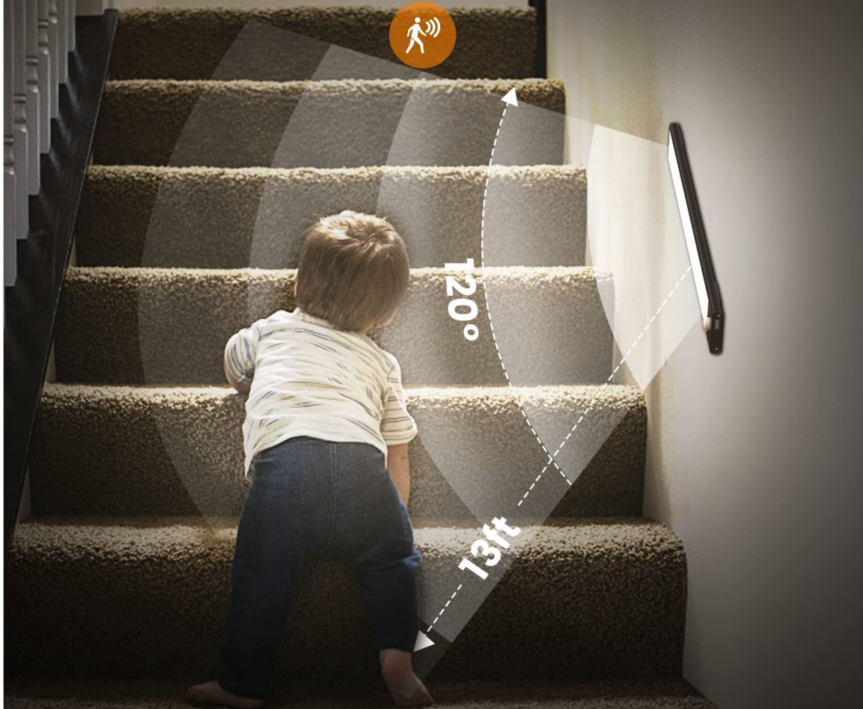
Image: Illustration of the automatic motion sensor light in action, detecting motion within a 120-degree angle and up to 13 feet.

Automatically turn on the lights when motion detected in the dark