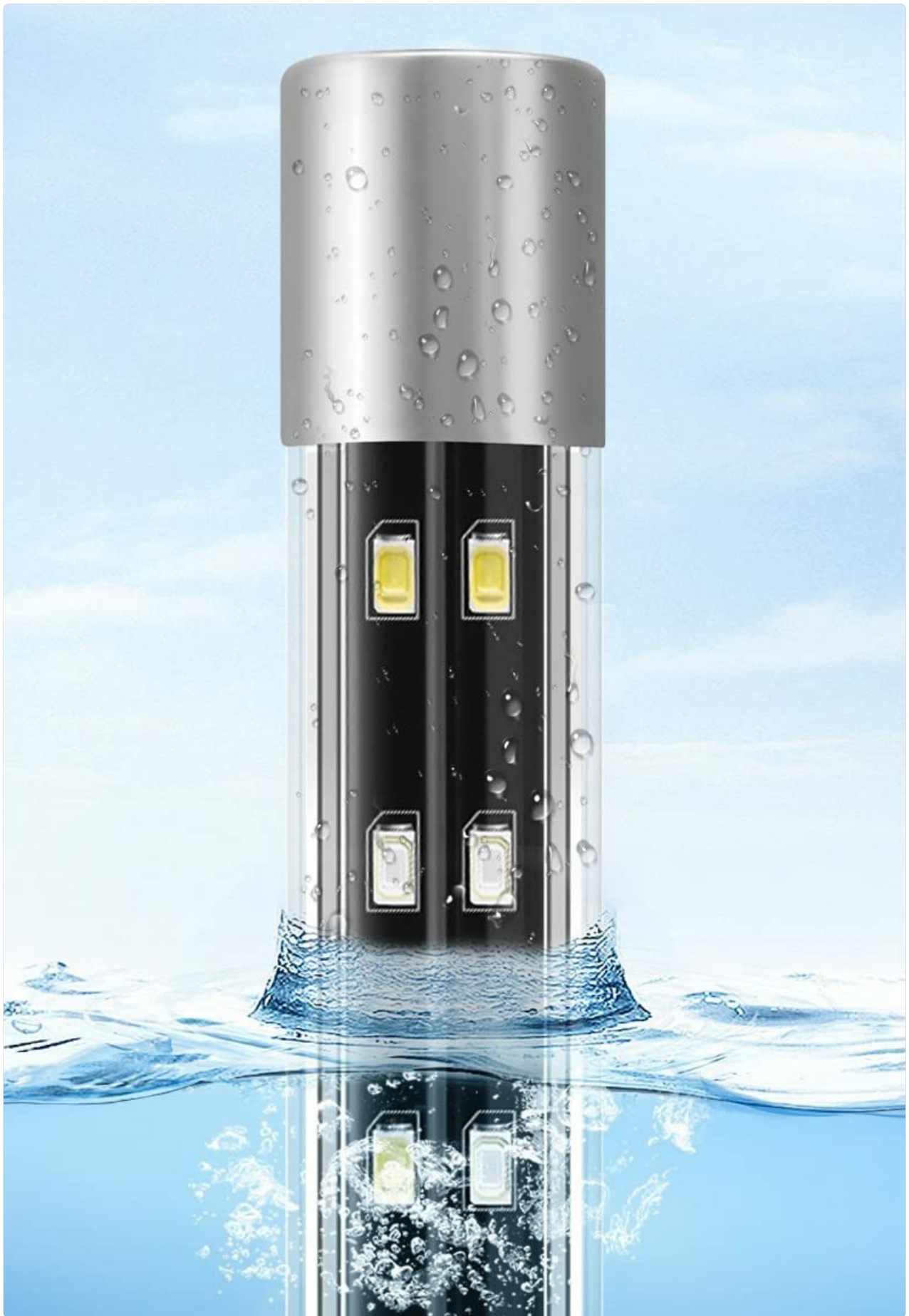
Image: A close-up view of the light unit partially submerged in water, highlighting its waterproof construction.