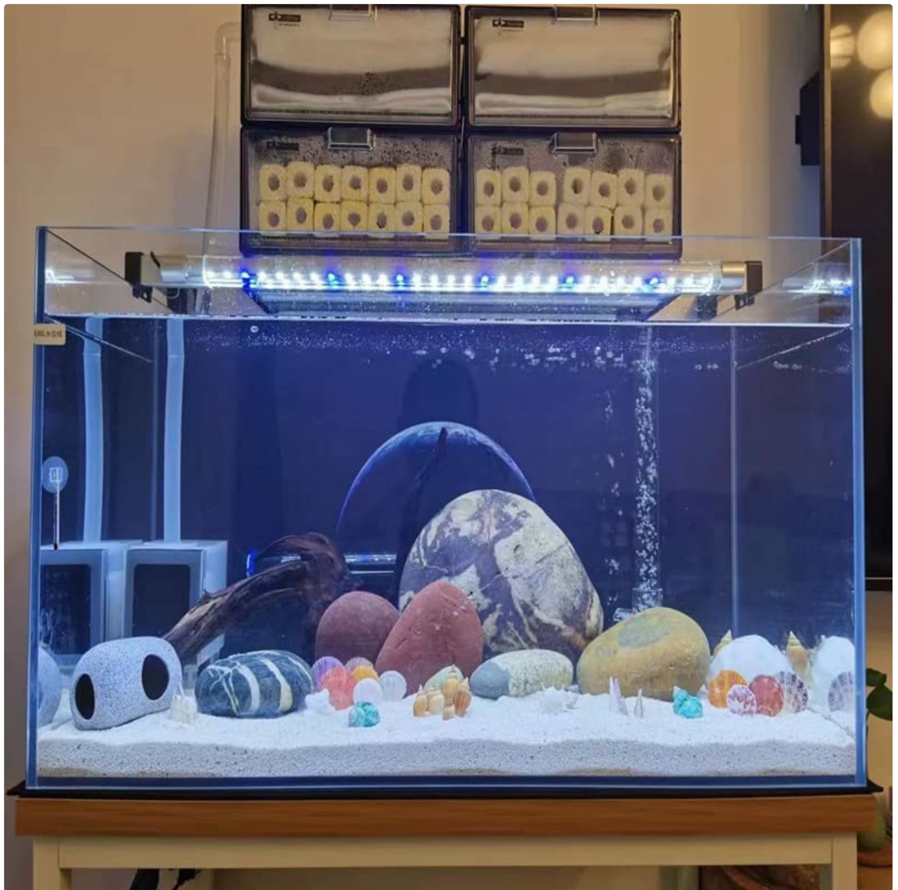
Image: The LED light installed horizontally across the top of an aquarium, illuminating the tank.