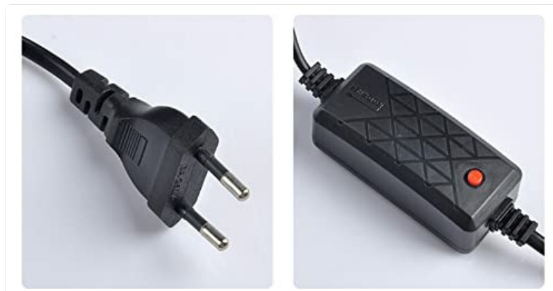
Image: A detailed view of the power plug and the inline control switch on the power cord.