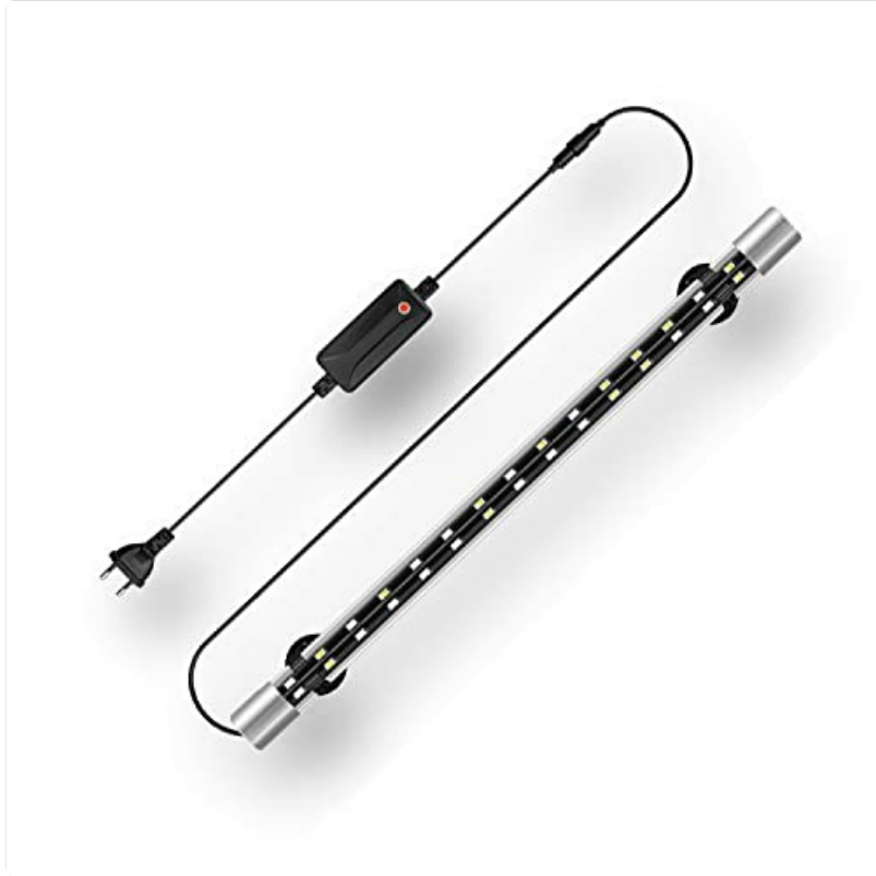
Image: The Sobo T8-290F LED light unit connected to its power cord and adapter.