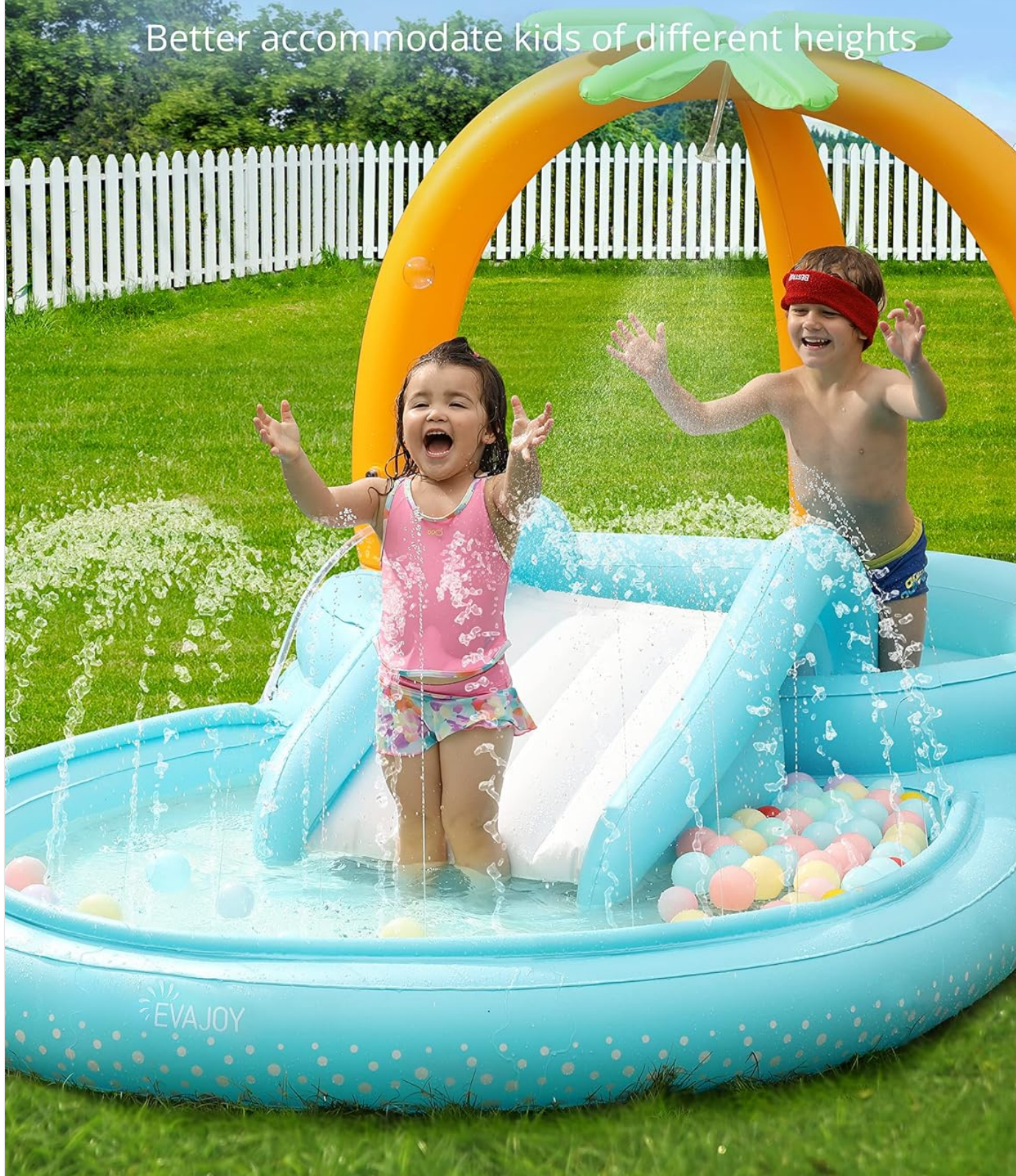
Figure 3: The two separate pool areas, designed to accommodate children of different heights.

Better accommodate kids of different heights