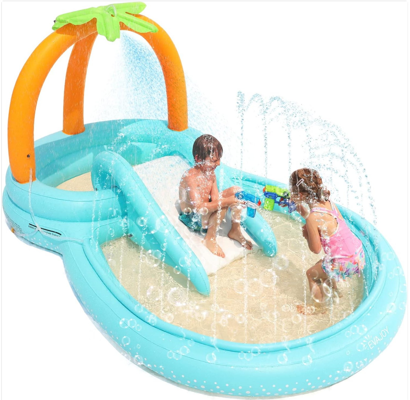
Figure 2: The Evajoy Inflatable Play Center after full inflation, ready for water play.