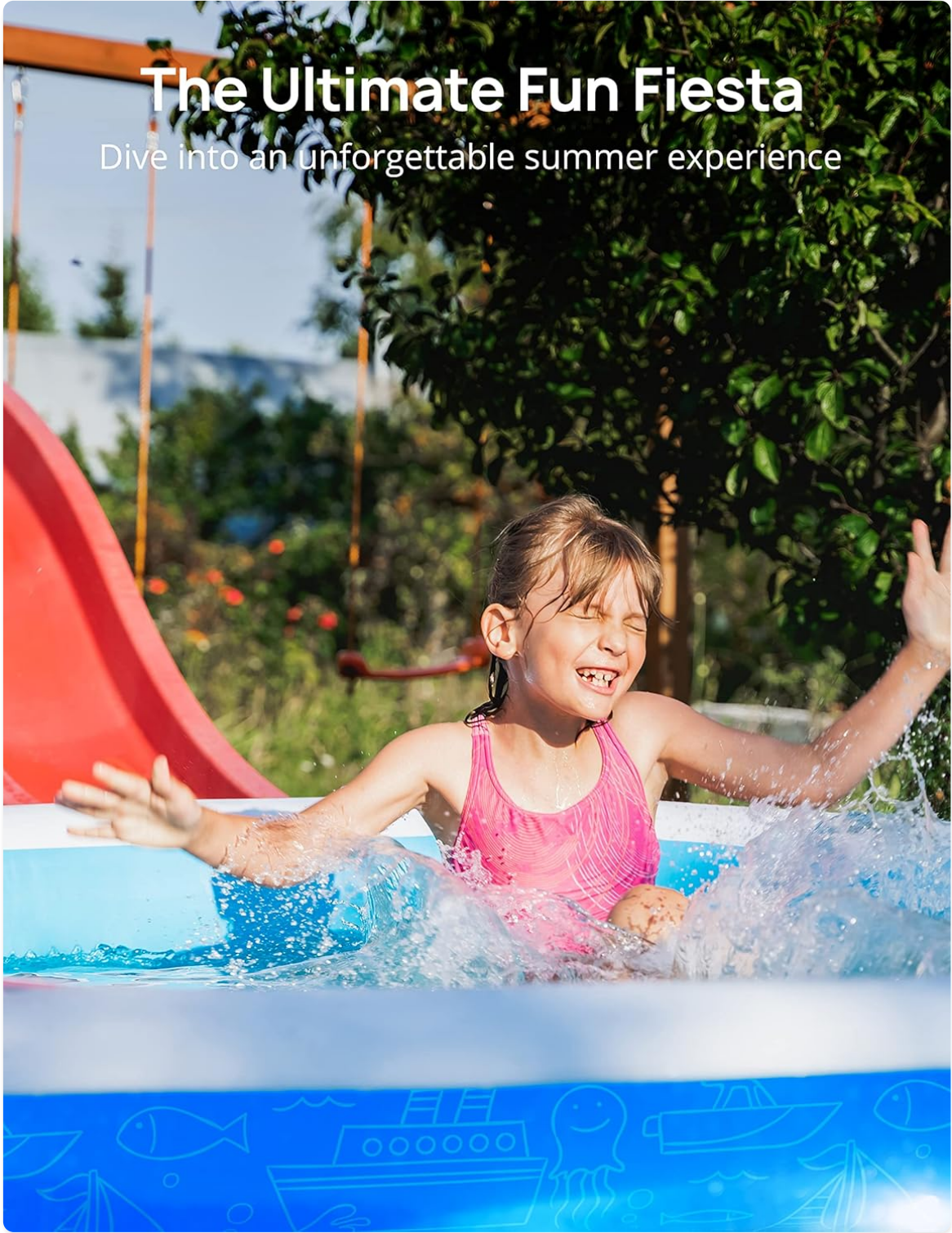
Image: A child enjoying the EVAJOY inflatable pool, demonstrating its suitability for active play.

Dive into an unforgettable summer experience