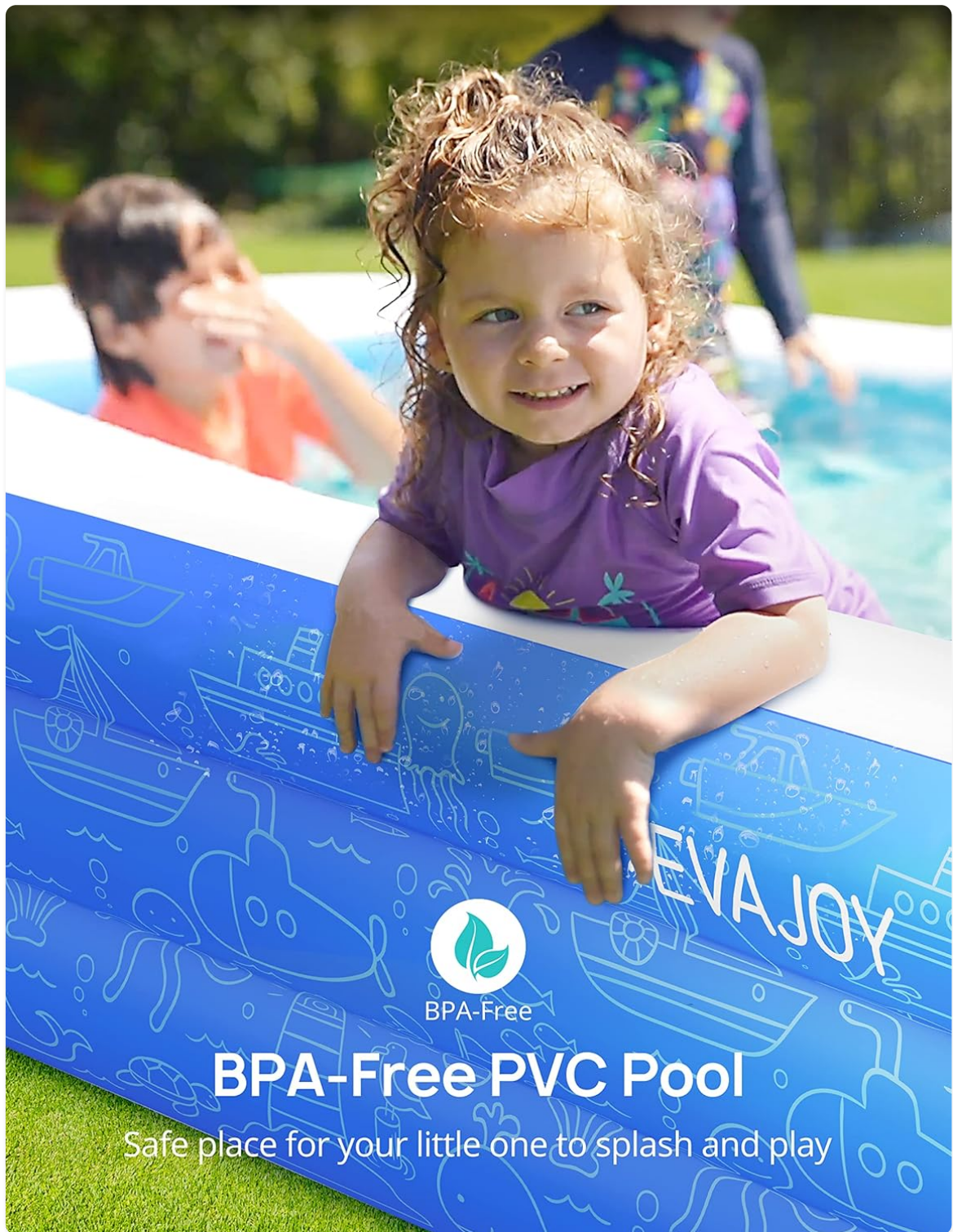
Image: The EVAJOY pool is made from BPA-Free PVC, ensuring a safe environment for users.