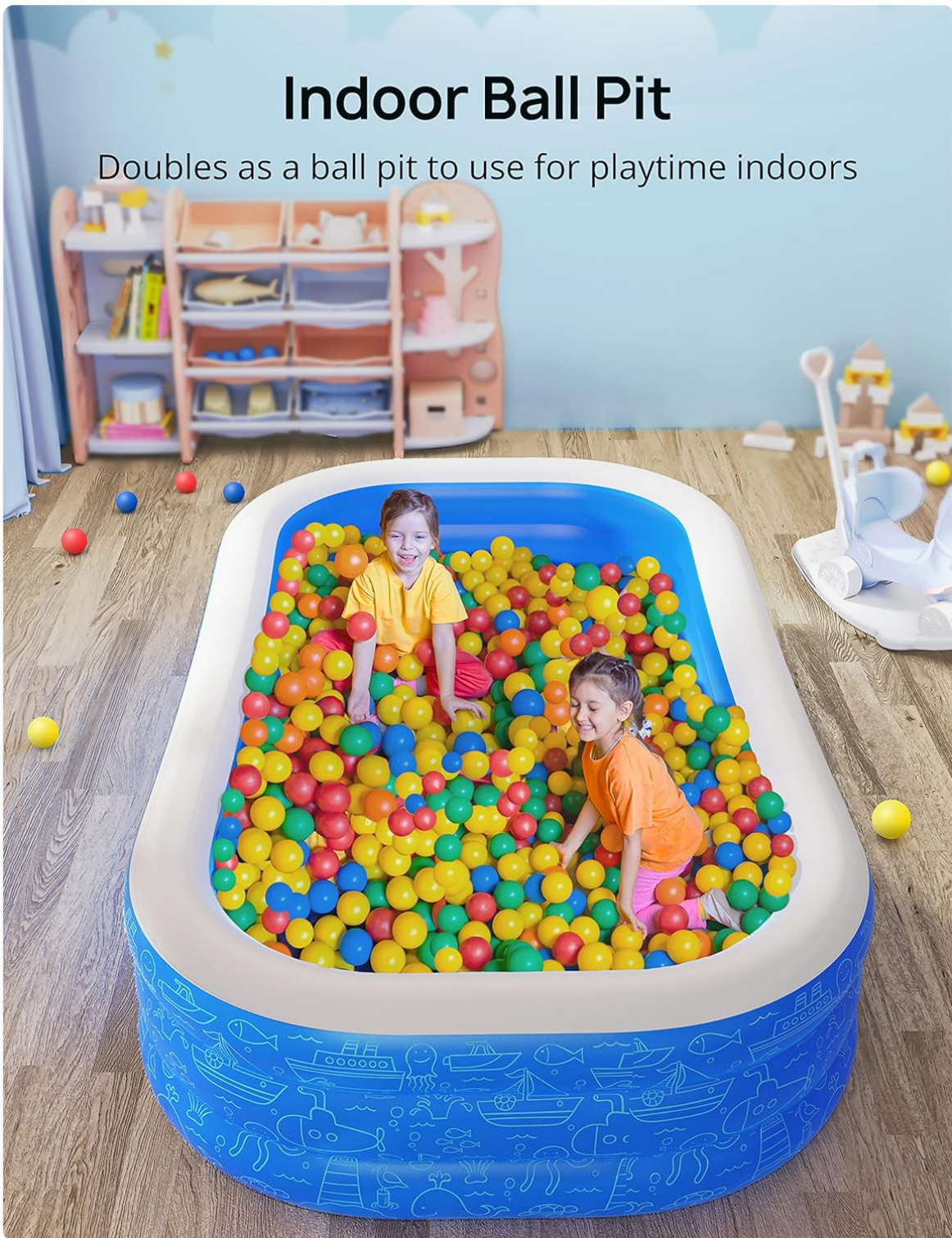
Image: The EVAJOY pool repurposed as an indoor ball pit, showcasing its multi-functional design.

Doubles as a ball pit to use for playtime indoors