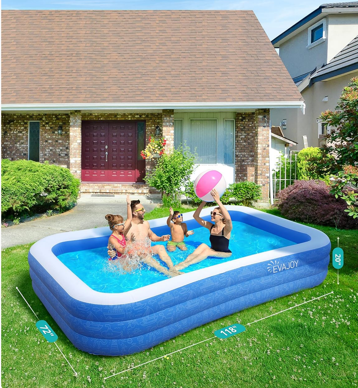
Image: A fully inflated EVAJOY pool in a backyard, showing its large size (118" x 72" x 20") suitable for family use.

Plenty of room for the whole family to chill