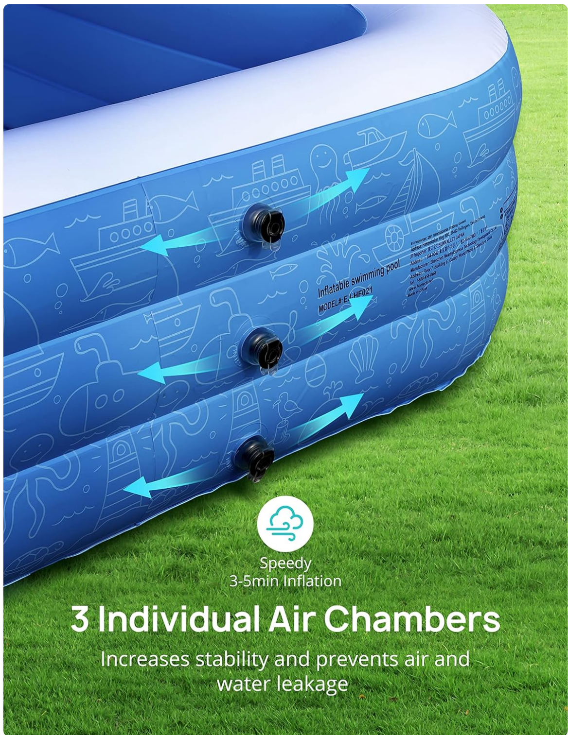
Image: The three individual air chambers of the EVAJOY inflatable pool, highlighting the inflation valves and the speedy 3-5 minute inflation time.

Use an electric air pump (not included) to inflate each chamber. Inflate until each chamber is firm to the touch but not over-inflated. Over-inflation can cause damage. The inflation process typically takes 3-5 minutes.