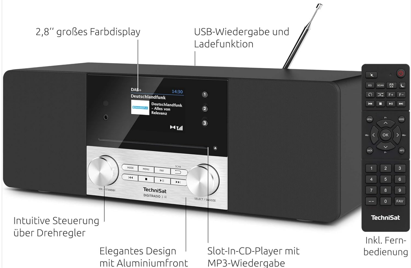
Figure 1: Front View of TechniSat DIGITRADIO 3 IR. This image shows the front of the radio with its 2.8-inch color display, intuitive rotary controls, slot-in CD player, USB playback and charging function, and the included remote control. The design features an elegant aluminum front.