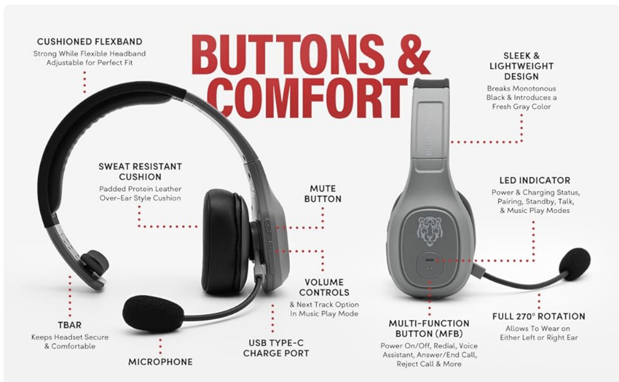
Image: Diagram of headset components and controls.

Familiarize yourself with the various parts and controls of your headset: