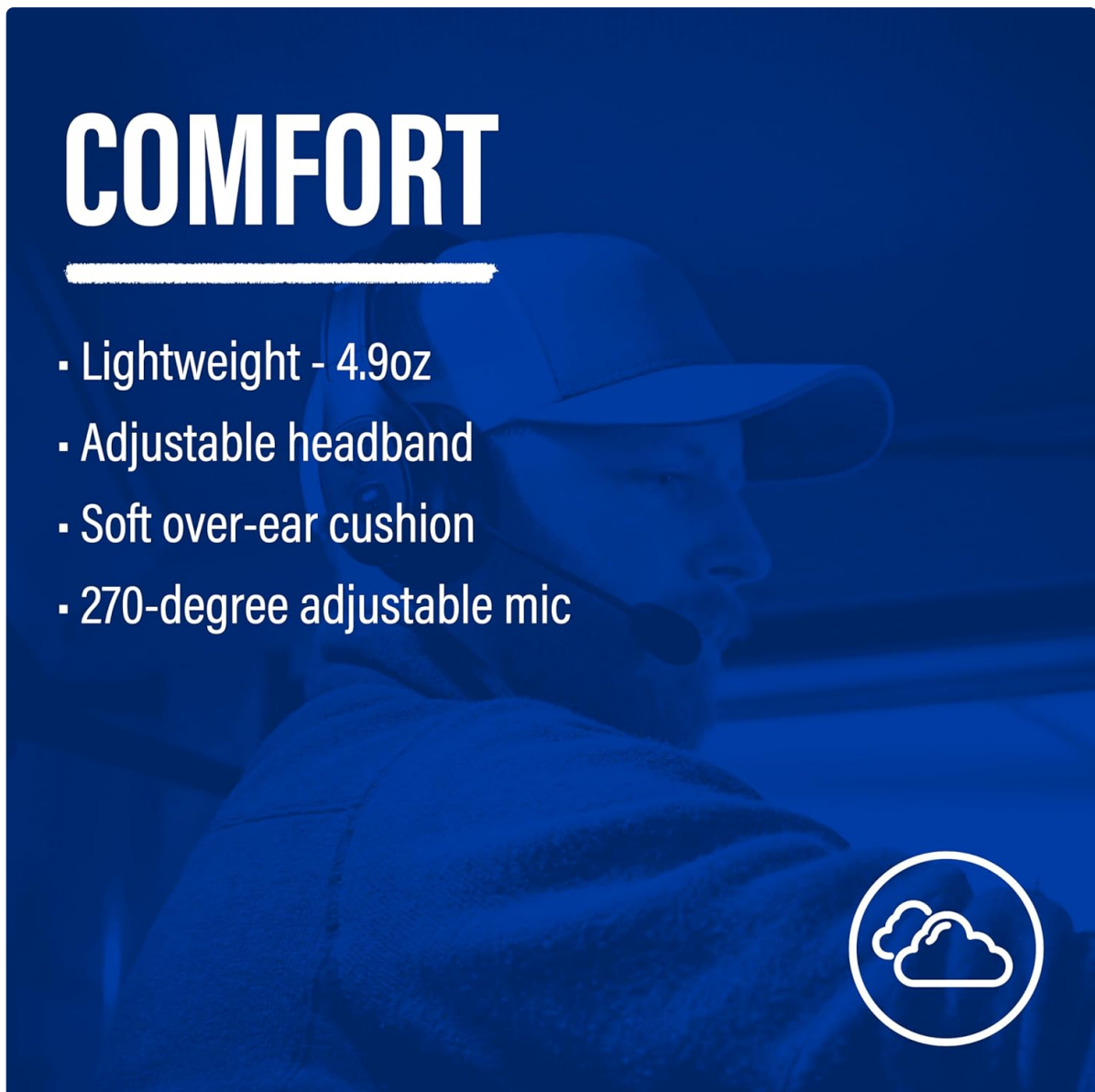
Image: Comfort features of the headset.