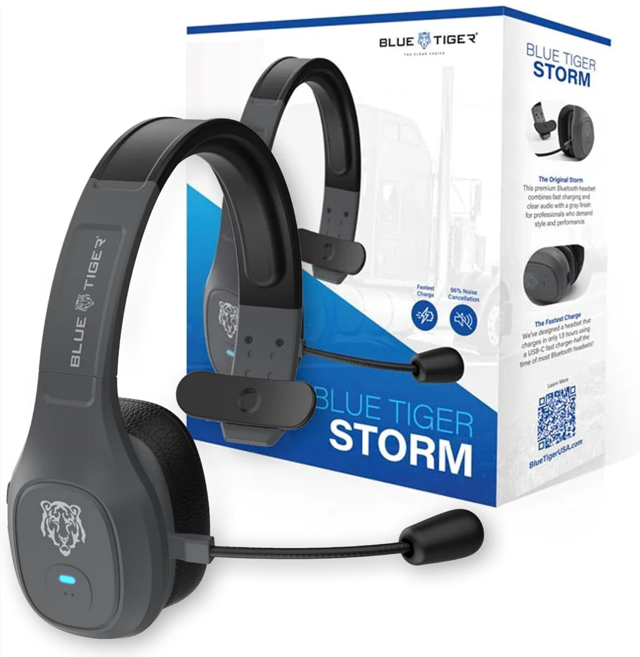
Image: Blue Tiger Storm Gray Premium Trucker Bluetooth Headset with its packaging.