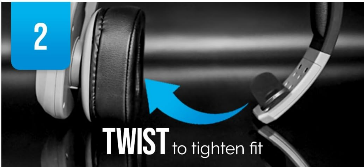
Image: Adjusting the headset for a perfect fit.