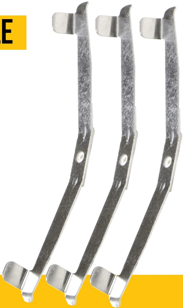
Image: Visual representation highlighting compatibility with Broan and Kenmore brands.