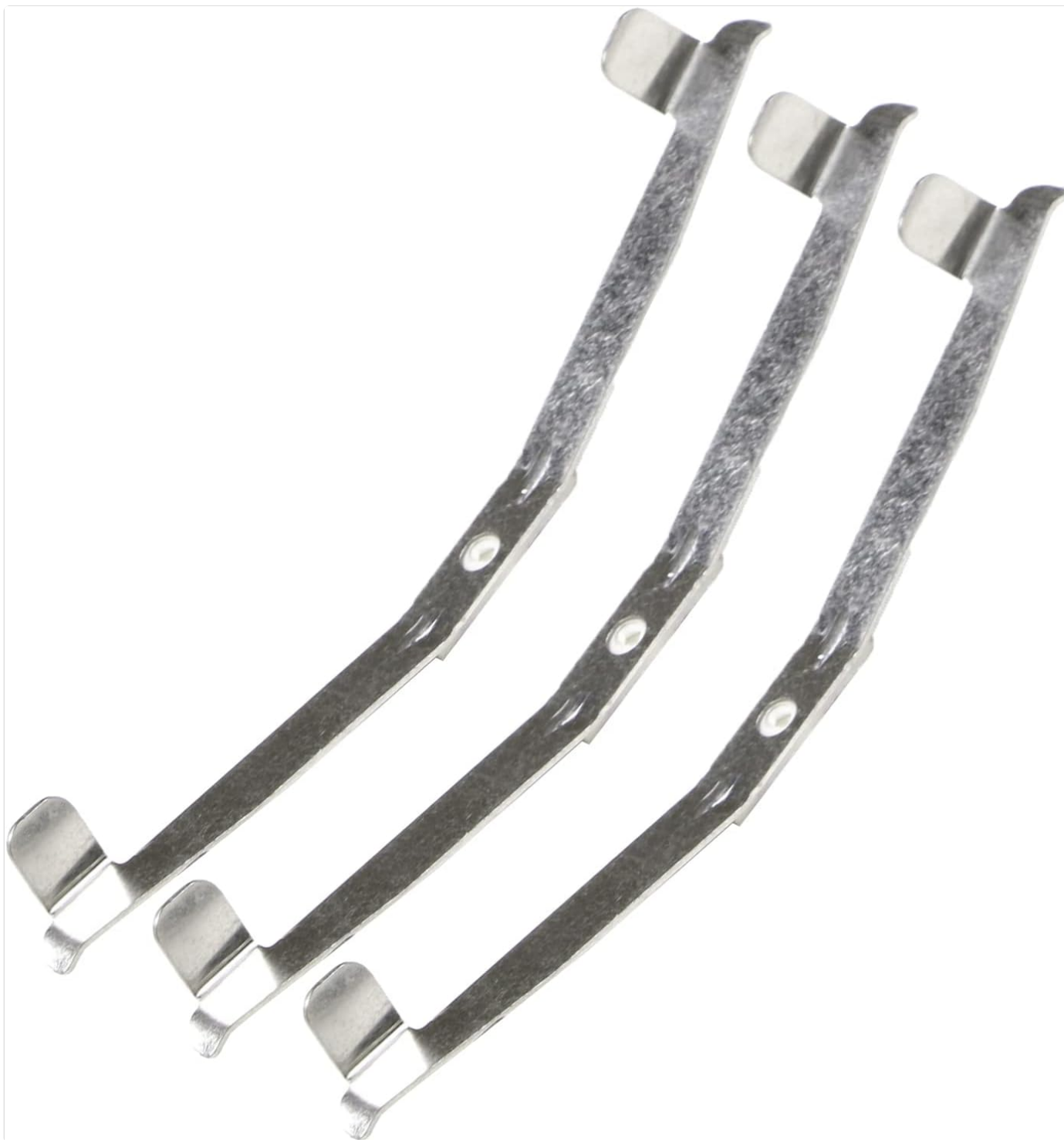
Image: Three SR169016 R169016 filter clips, showcasing their design and material.