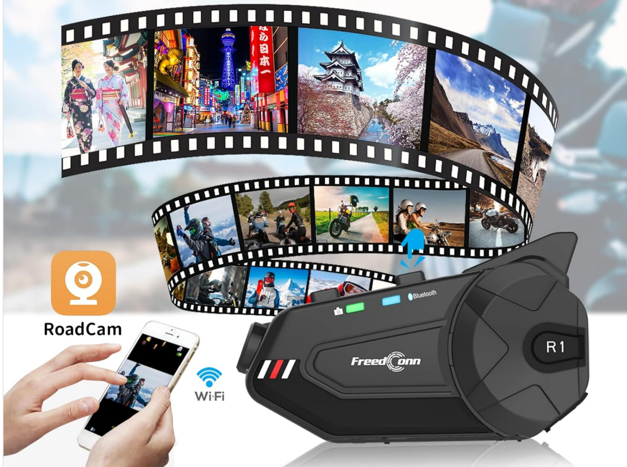
Image: The FreedConn R1 Plus unit highlighting its WiFi feature, showing a smartphone connected to the device via the RoadCam app to view live footage.

内蔵のWiFiモジュールを使用すると、いつでも ビデオ画像を視聴およびダウンロードできます。