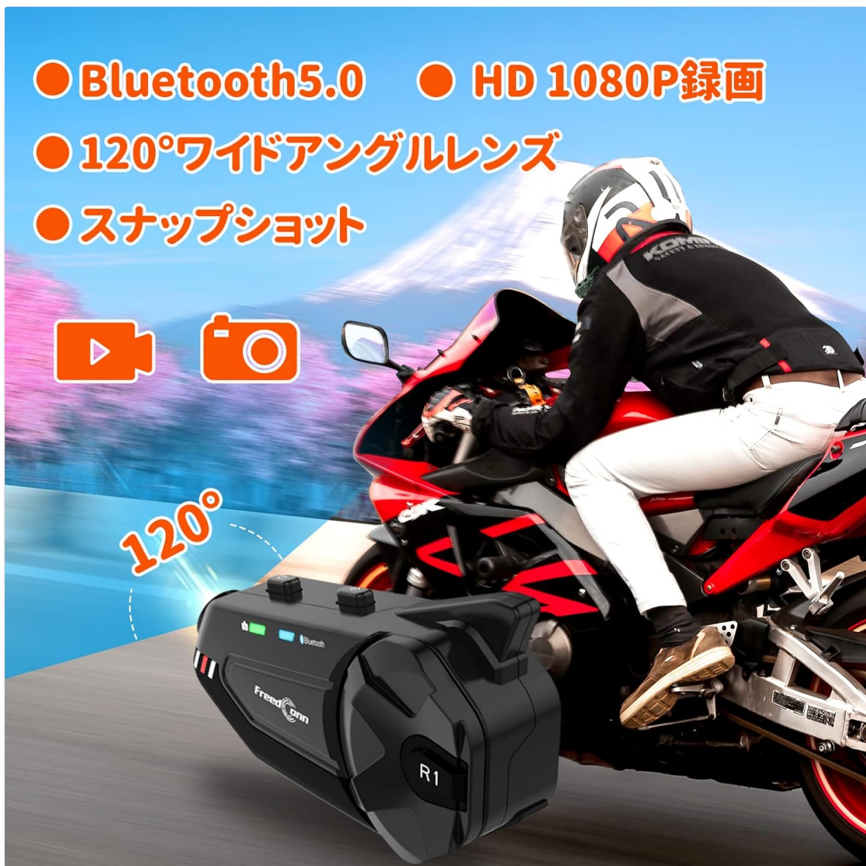
Image: Visual representation of the FreedConn R1 Plus camera features, including Bluetooth 5.0, HD 1080P recording, 120° wide-angle lens, and snapshot capability, with a motorcycle rider in the background.